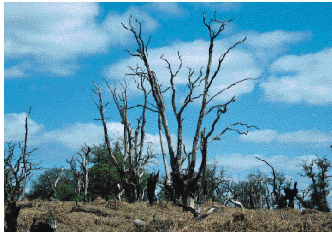
Figure 24a. Veteran trees killed by a bracken fire at Ashted Common (Surrey).