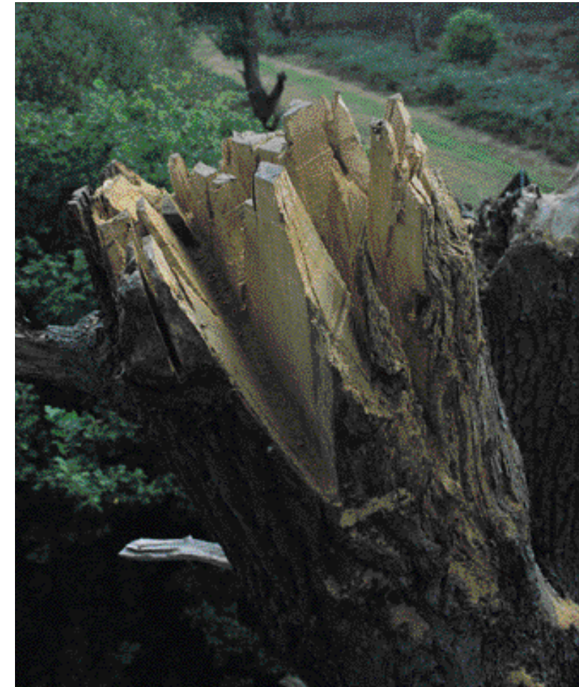
Figure 31. 'Coronet' cuts on a veteran oak tree, Ashted Common (Surrey).