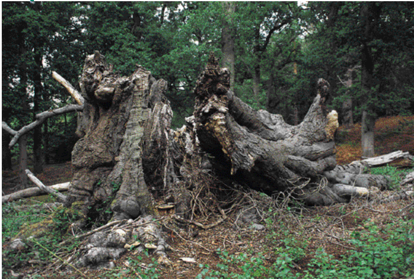
Figure 28. The base of a large beech tree, fallen apart and left to decay naturally, Windsor Forest (Berkshire).