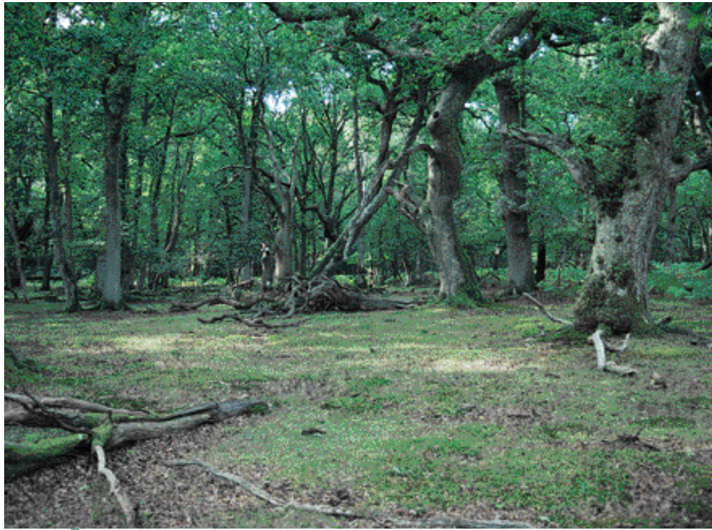
Figure 23. Old growth woodland in the New Forest (Hampshire), grazed extensively.