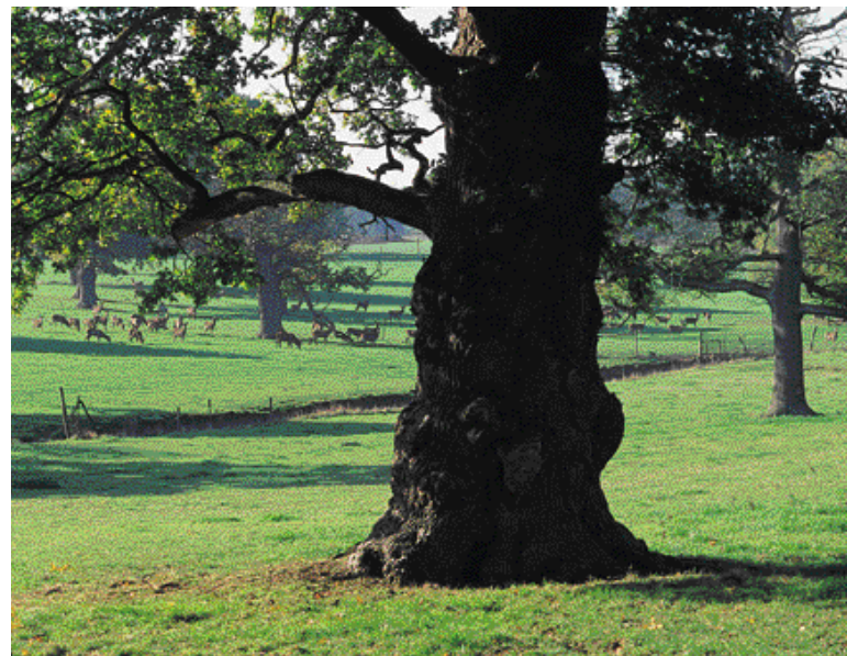
Figure 24. Whittlewood Forest (Northamptonshire), a deer park with improved grassland.