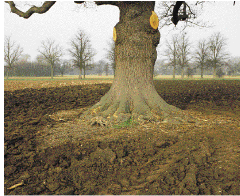
Figure 25. Ploughing too close to a veteran tree. The tree has also had its lower branches removed, which is also detrimental.