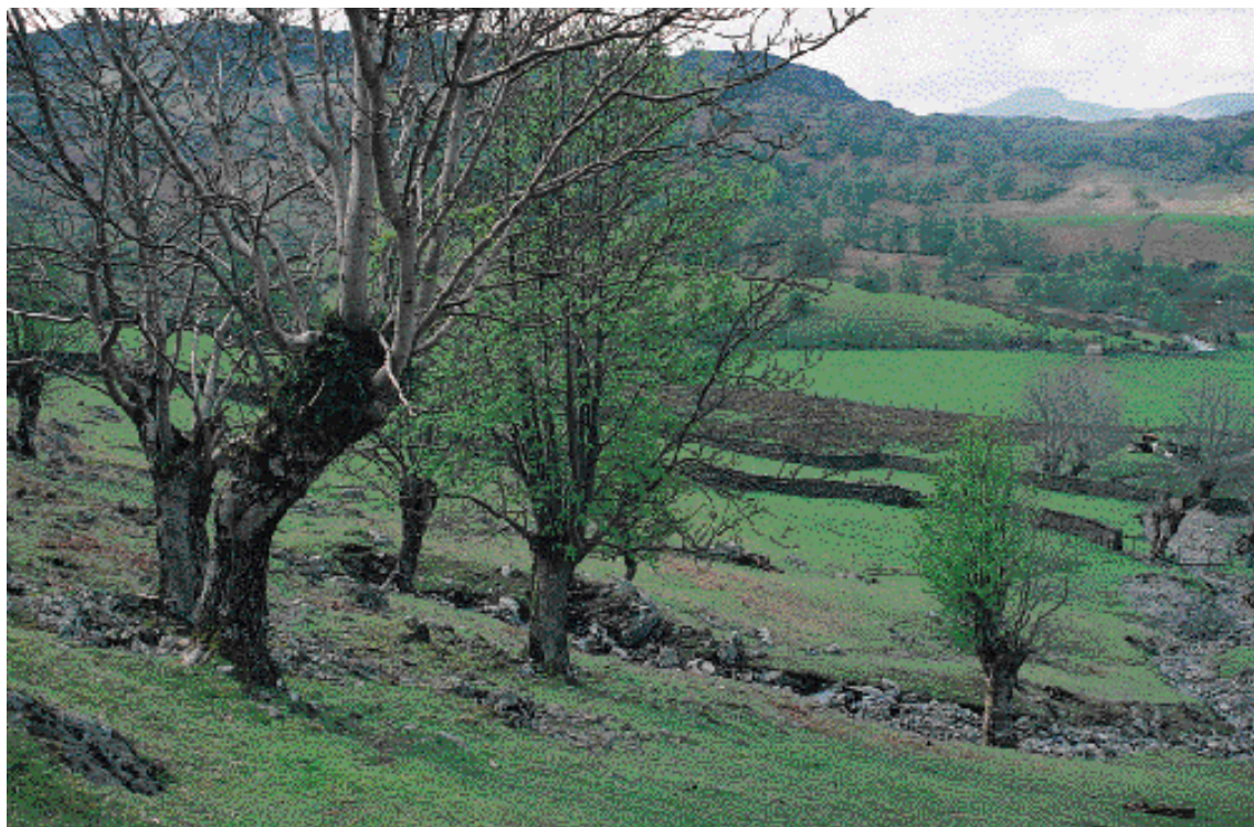
Figure 30. A landscape with veteran trees, Watenlath, Lake District.