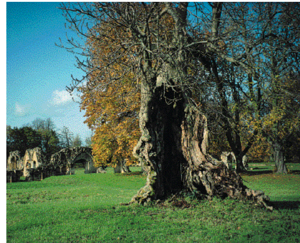
Figure 32. Veteran tree on an ancient monument, at Hailes Abbey.