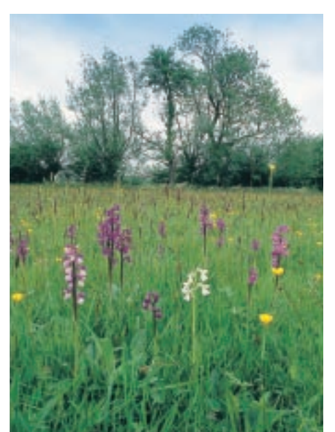
An old meadow with green-winged orchids.

Conservation of those remaining old meadows and pastures is therefore extremely important. Certain fields that are particularly rich in wildlife have been notified as Sites of Special Scientific Interest (SSSIs) and others are managed as nature reserves.