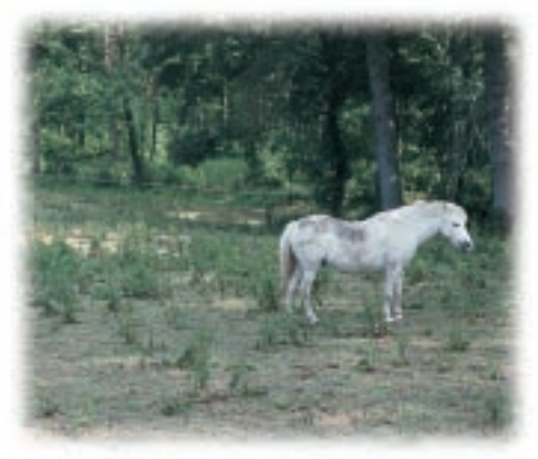
Over-grazed sward and problem weeds in a horse-sick pasture

A fine old meadow in early summer.