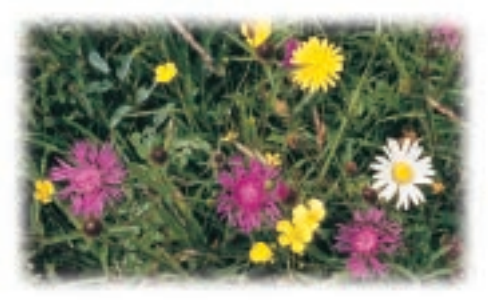
A grassland sward made up of many different grasses and wildflowers.

Old meadows and pastures are wonderful places for wildlife. They contain a rich variety of plants and insects and provide feeding and nesting places for birds. These grasslands were once common in the countryside and were maintained by a long tradition of low-intensity grazing or hay-making. However, over the last fifty years farming has become more intensive and most of these rich wildlife habitats have been lost through ploughing, reseeding or treatment with chemical fertiliser and herbicides. Such agriculturally improved grasslands support very few plant and animal species.