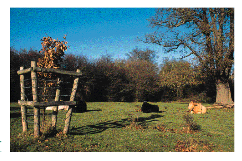
Figure 45. A large tree guard in use, Hatfield Forest (Essex).