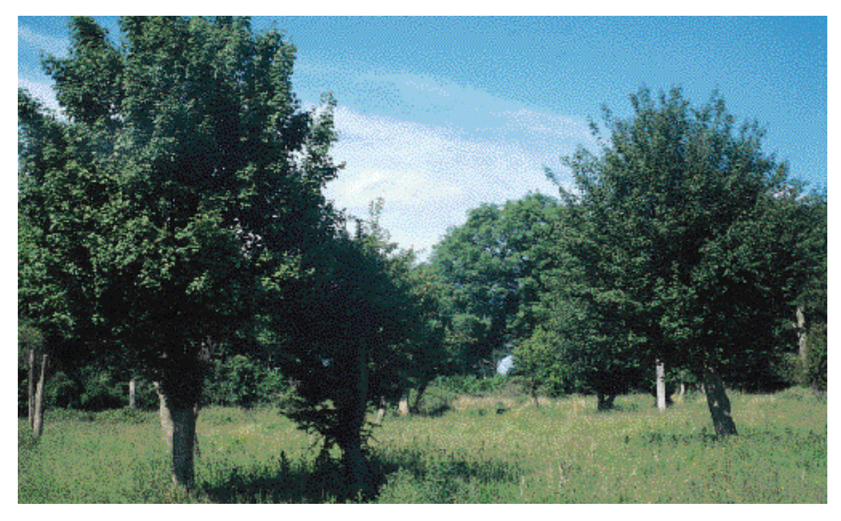
Figure 46. Young, newly created pollards at Hatfield Forest (Essex).