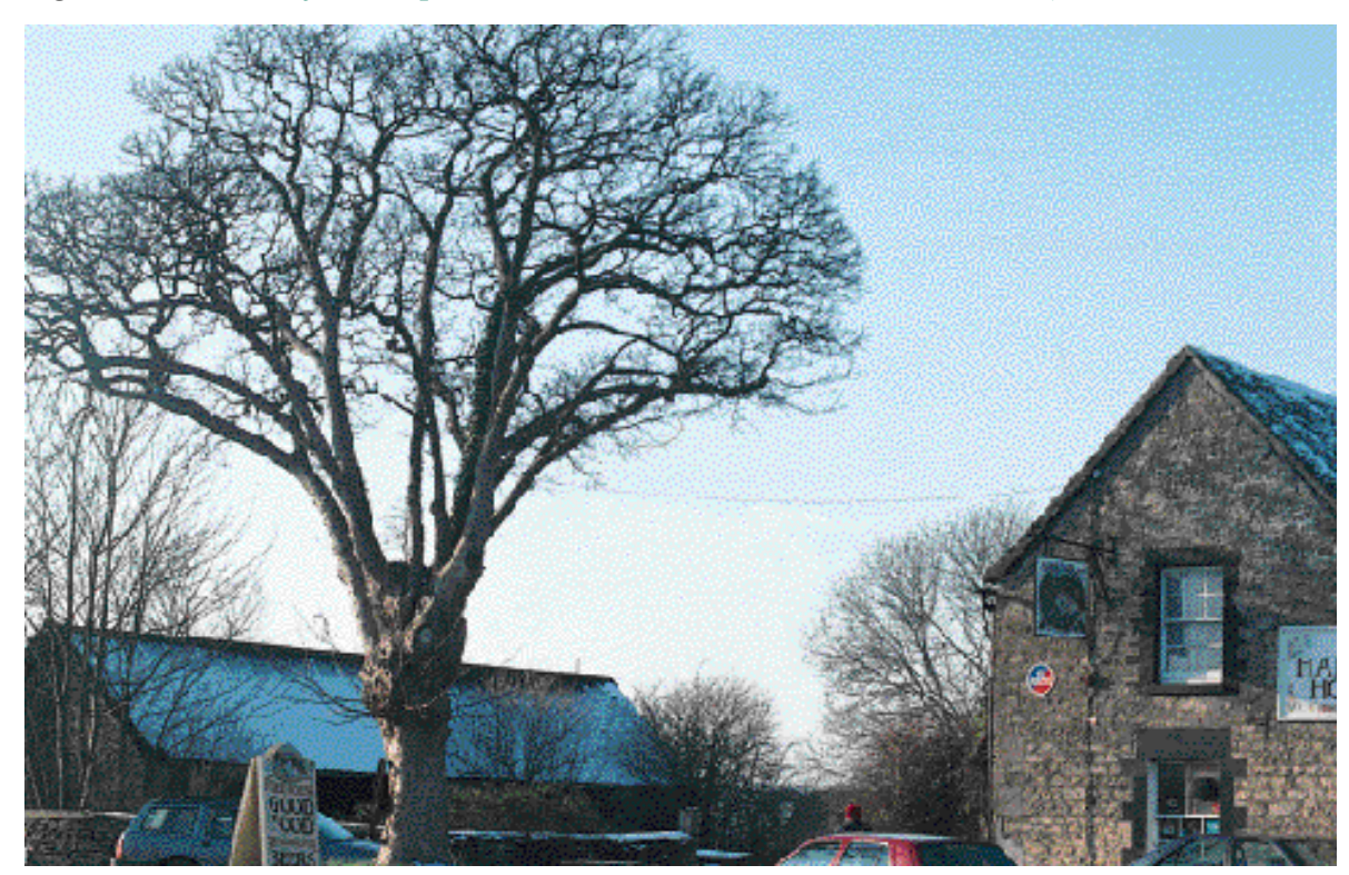
Figure 33. A veteran sycamore pollard outside the Fox and Hounds at Foss Cross, Cotswolds.