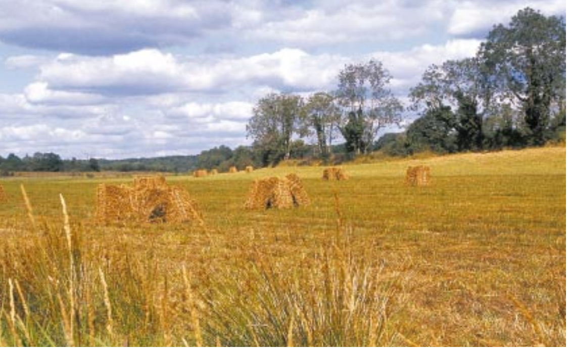
Rush bales, Co Fermanagh, Northern Ireland. Mark Wright

the site at any one time. Mowing changes the structure of the vegetation suddenly, and this can harm invertebrates. It is best used where it has been the traditional management regime. Patch mowing is a way of enabling grazing stock to return to pastures that have become too rank to be grazed.