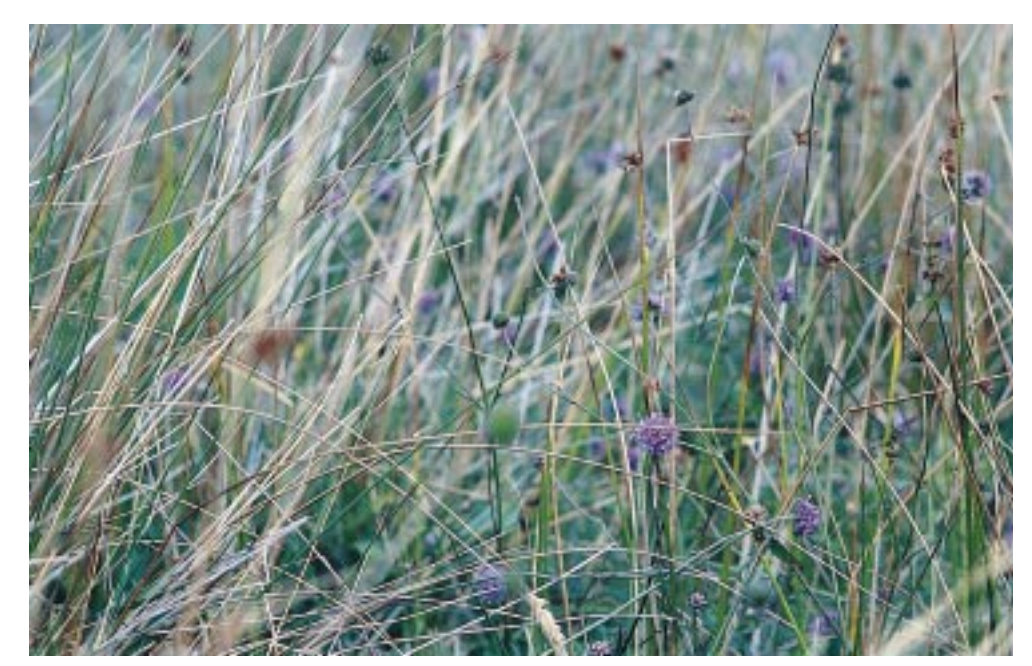
Devil's-bit scabious. Adrian Fowles

jewel beetle, the larvae of which emerge from shiny, black eggs to leave thin white trails as they 'mine' the leaves. The bizarre, day-flying narrow-bordered bee hawk-moth is also a specialist of these pastures. With its clear wings and short body covered by hair-like scales, this moth mimics the appearance of a bumblebee.