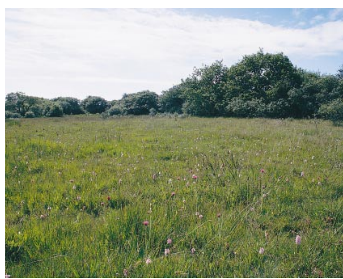
Culm grassland, Devon. Peter Wakely/English Nature 16,585

Changes in agricultural practices have caused the loss of many marshy pastures, but those that do remain and are managed appropriately are often havens for wildlife, full of birdsong in the spring and humming with insects in summer.