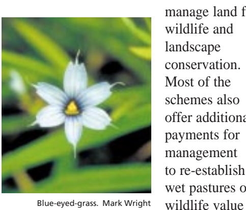
Blue-eyed-grass. Mark Wright

from agriculturally improved and partially improved grassland or arable land. Benefits for wildlife from these payments are likely to be greatest where re-establishment occurs in