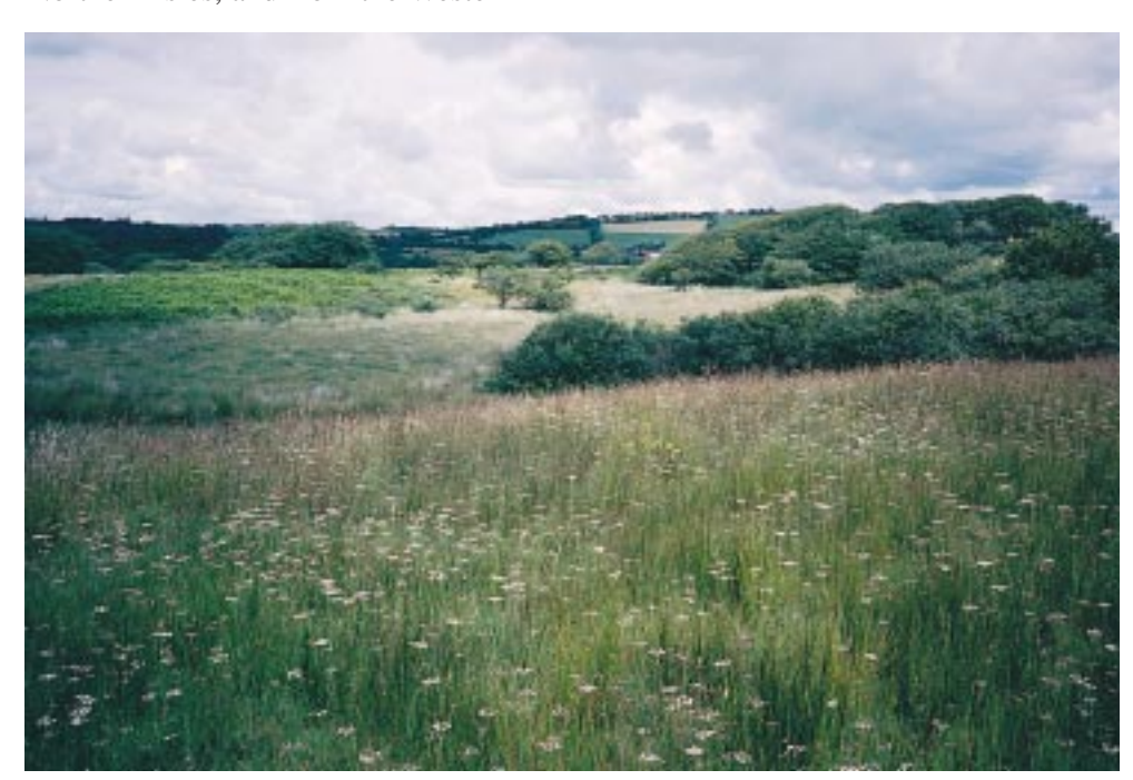
Rush pasture with whorled caraway, South Wales. Jon Turner

These pastures occur mostly on gently sloping land, where there is lateral movement of water through the soil, but also on river and lake floodplains, where they may be periodically flooded during the winter and early spring. They may be small and isolated, or form large tracts of rough grazing, and are often mixed with other habitats, such as heaths, fens, drier grasslands and scrub or woodland.