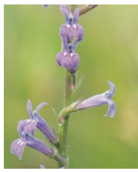
Heath Jobelia

hand, wet pastures are generally unsuitable for modern breeds of sheep, and particularly lactating ewes, because of the low sodium and calcium content of the forage.