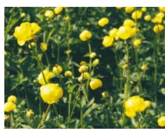
Globeflower David Stevens

variety of uncommon plants, such as lesser butterfly-orchid and fragrant orchid. In southern Britain, the flower-heads of meadow thistle add splashes of purple to many of these fen-meadows in mid-summer. Marsh hawk's-beard is frequently found in a scarce form of fen-meadow in the hill country of Scotland, northern England and north Wales, where you may also find occasional plants of the aptly named globeflower, a striking relation of the buttercup. A rarer form of fen-meadow is dominated by the uncommon blunt-flowered rush. A wealth of herbs may be found amongst the rushes, including marsh valerian, with its delicate pale-pink flowers, and the scrambling stems of fen bedstraw.