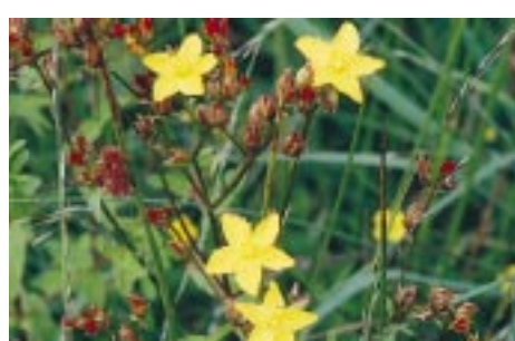
Wavy St John's-wort. Peter Wakely/English Nature 8,567

Other forms of the habitat occur on more acidic soils. These too may be dominated by purple moor-grass or rushes, and brightened by tall herbs such as the robust white-flowered wild angelica and the pungent meadowsweet. Smaller in stature but equally distinctive are ragged-robin, with its finely cut pink flowers, the aromatic water mint, and tormentil, an almost ubiquitous associate of purple moor-grass. Orchids are also wellrepresented, usually by the heath spotted-orchid and southern or northern marsh-orchids. Visually drabber forms of the habitat may be no less rich in plants, with inconspicuous species often concealed within the tangle of grasses and rushes.