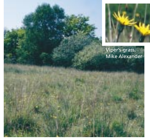
Purple moor-grass pasture with viper's-grass. Mike Alexander

flowers and feathery, fragrant leaves, and the miniature gorse-relative petty whin, can be found fairly easily by looking in the right places. Others are more restricted in their distribution and harder to find. Examples include the magenta-flowered heath lobelia of southern England; the yellow-flowered wavy St John's-wort of south west