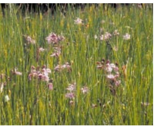
Ragged-robin.