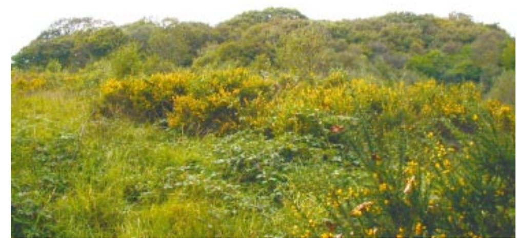
Scrub invading marshy grassland. Graham Motley

As marshy grasslands have dwindled, management of the remaining examples has become increasingly precarious. Farmers have sometimes stopped actively farming them, because of a perception that the inconvenience outweighs the economic returns. These sites rapidly become rank and impenetrable and may change over time into dense scrub or woodland. This means that smaller plants, such as devil's-bit scabious, are rapidly shaded out, and dependent species such as the marsh fritillary are then also lost.