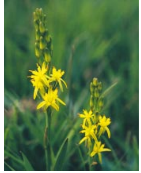
Bog asphodel. David Stevens

from agriculturally improved and partially improved grassland or arable land. Benefits for wildlife from these payments are likely to be greatest where re-establishment occurs in