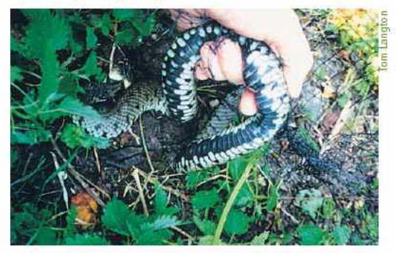
Snakes, like this grass snake, can become entangled in garden netting where they may die.

Create a wildlife pond and allow it to be colonised naturally by newts, frogs or toads. Grass snakes may then visit in search of food. Froglife can supply a free