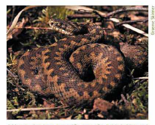
Adders tend to keep to specific areas of suitable habitat and do not wander far from these.