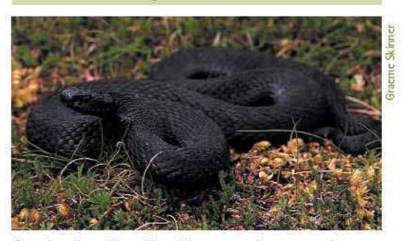
Occasionally, adders, like this one, and, more rarely, grass snakes, are completely black or very dark.