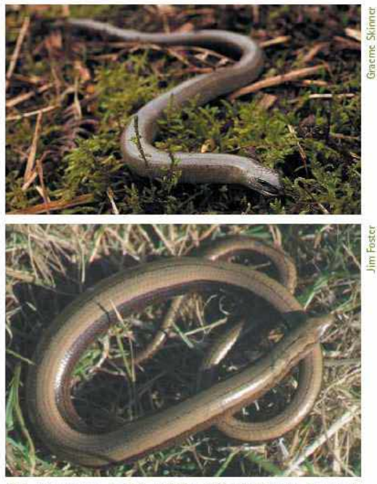
The slow-worm is the reptile most commonly found in gardens. Male (upper photograph) and female.

Slow-worms are fairly widespread in England, Scotland and Wales, and are found in a variety of habitats, particularly