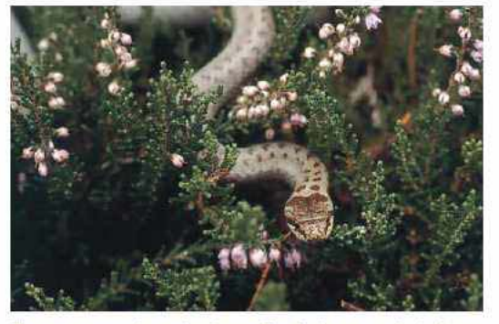
The rare smooth snake is confined almost exclusively to heathlands in Dorset, Hampshire and Surrey.