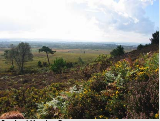
Canford Heath - Dorset