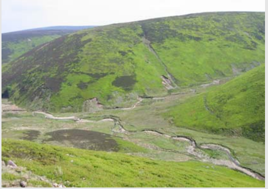
Bowland Fells - Lancashire