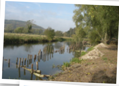
During & after