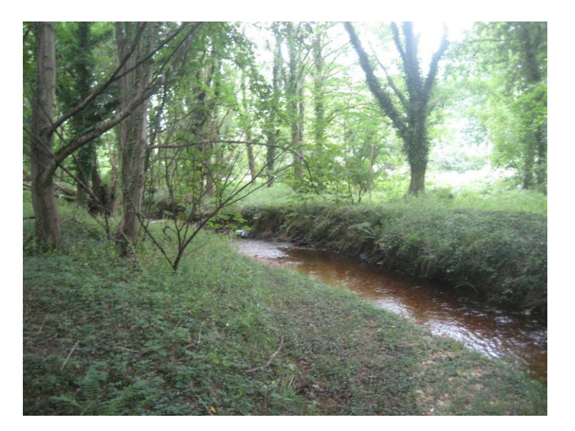
Photo DOR01-n: Looking downstream with vegetated bar in the foreground.