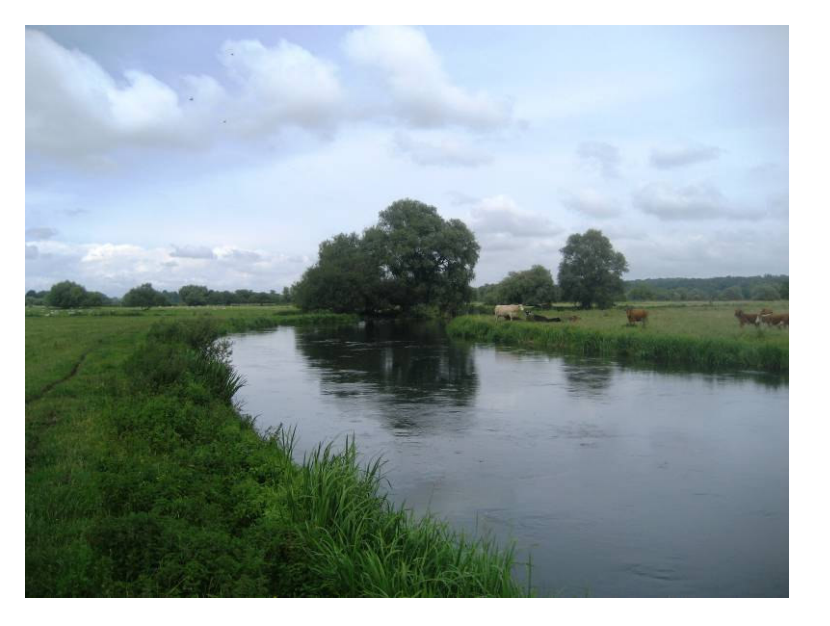
Photo HAR02-f: Looking upstream along the glide from the downstream boundary.

Looking downstream along the glide with broadleaved woodland along the left hand bank.