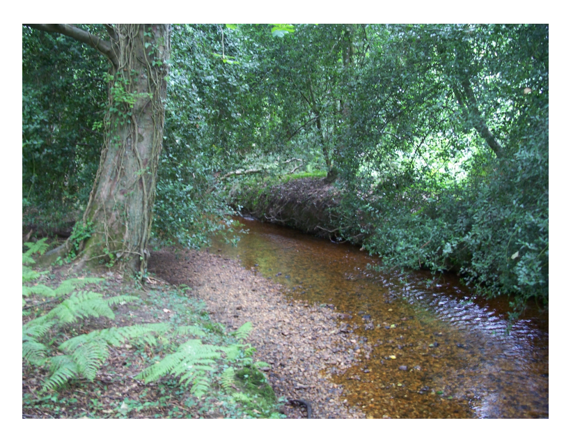
Photo DOR01-i: Looking downstream with a point bar on the inside of the meander.

Photo DOR01-n: Looking downstream with vegetated bar in the foreground.