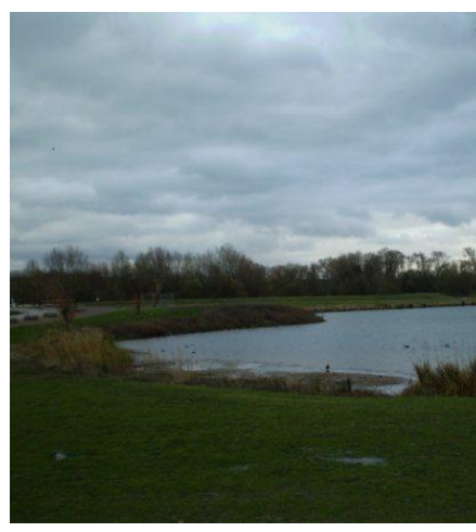
Partnership working in action