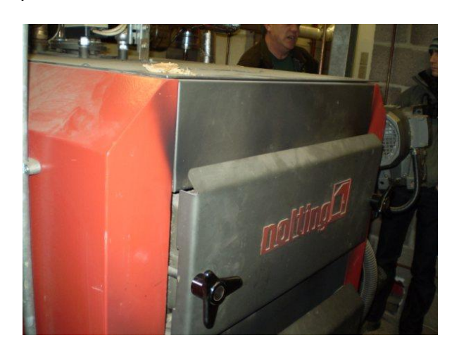
Stanwick Lakes Visitor Centre

GI for energy in action - biomass produced in Forestry Commission woodland and used to power their office