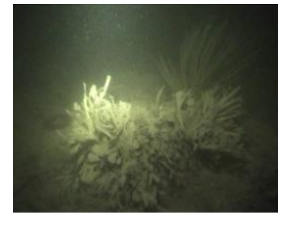
Plate 2: Flustra foliacea on tide swept circalittoral rock