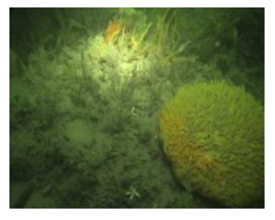
Plate 1: A rich faunal turf dominated by erect branching sponges on tide swept circalittoral rock