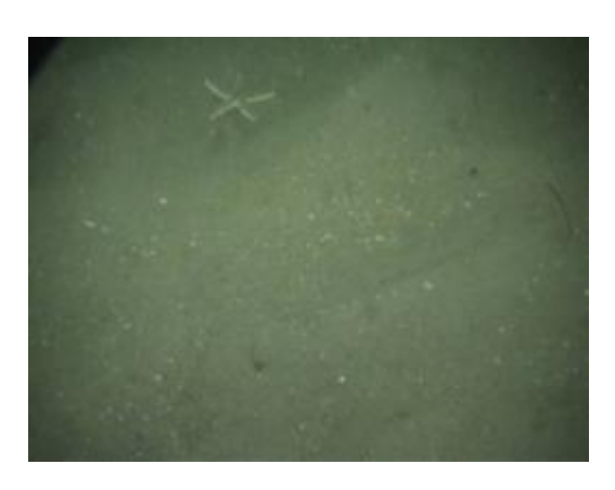
Plate 3: Subtidal muddy sand with Asterias rubens