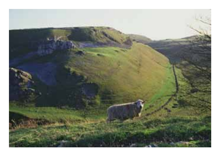
The Derbyshire Dales