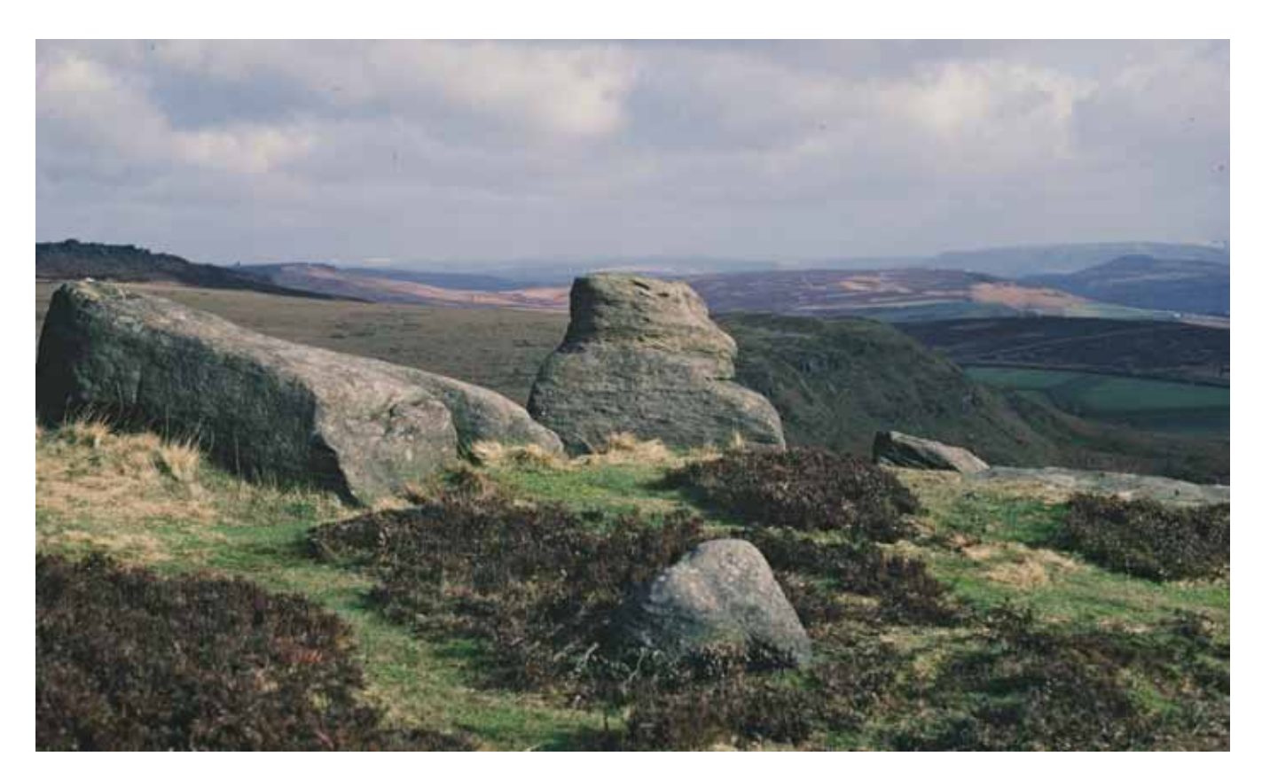
The Dark Peak, one of the 12 Nature Improvement Areas

New Nature Improvement Areas, in response to the recommendations set out in Making Space for Nature. NIAs aim to restore and connect nature on a significant scale and are established by partnerships of local authorities, local communities and landowners and conservation organisations (paragraphs 2.27–2.32). A list of the 12 designated NIAs is available on the website, with details of the work they are doing, and contact details: