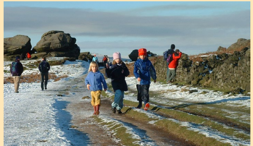
The well-worn path along Froggatt Edge popular with walkers and birdwatchers