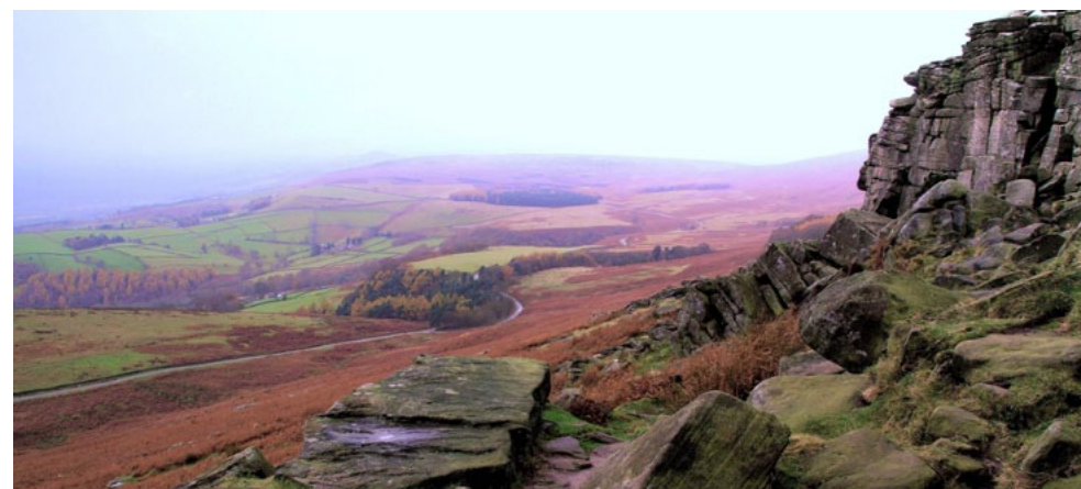
Open moors and inbye land, Stanage

http://magic.defra.gov.uk/website/magic/ – select 'Landscape' (shows ALC classification and 27 types of soils).