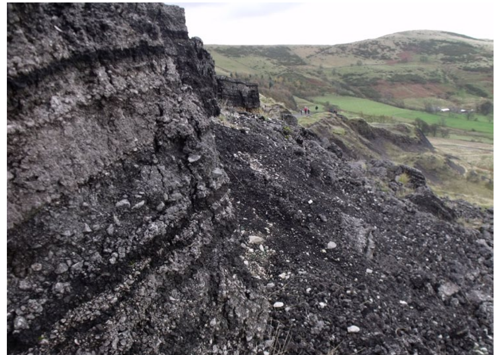
Landslips have caused road closure below Mam Tor

Canyards Hills, while Mam Tor is one of the best examples of a large-scale rotational landslide affecting hard rocks in inland England. There are currently eight nationally designated geological sites within the NCA and a further five mixed-interest SSSI. A total of 75 local sites of geological interest have been designated within the NCA. The underlying geology also has an impact on the species and habitats found within the NCA as does the landscape character via the impermeable rocks which allowed for the construction of the reservoirs.