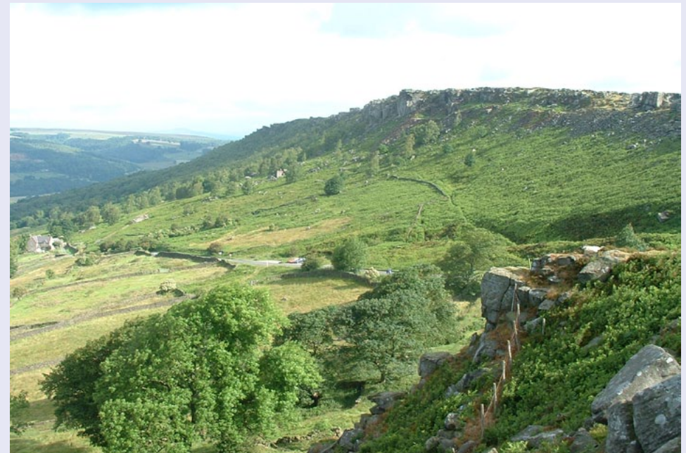
Curbar Edge with oak woodland and inbye pasture land below