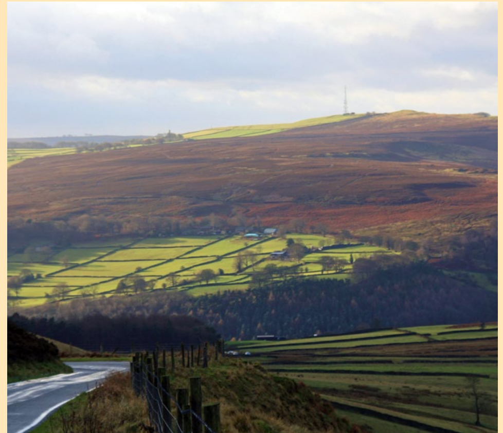
Open moors and inbye land, Hathersage