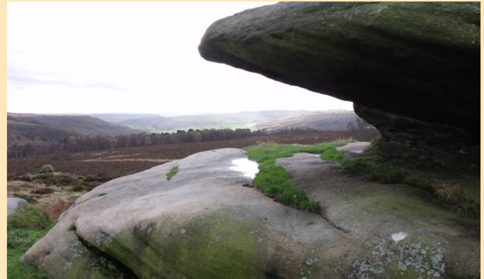
Millstone grit at Surprise View near Hathersage