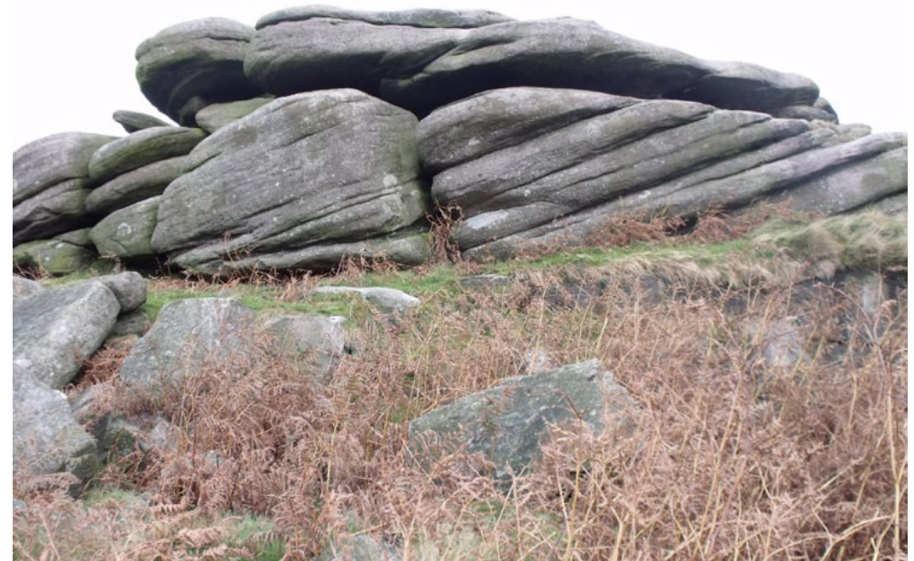
Weathered gritstone outcrop near Hathersage with distinct current bedding