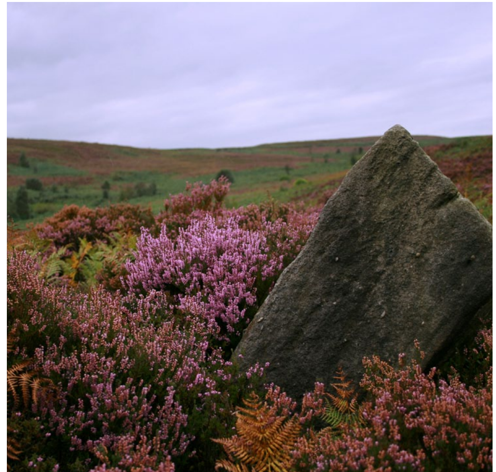
Redicarr Clough, Dark Peak