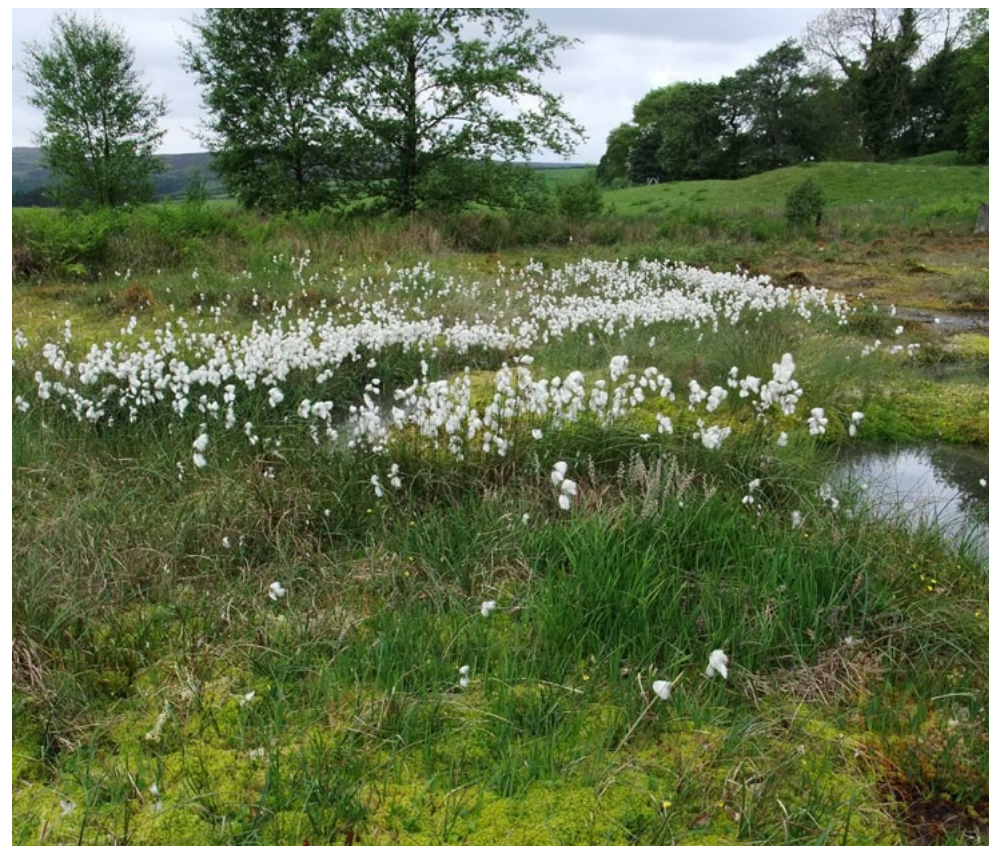
Wet flush with Sphagnum moss and cotton grass in the Bradfield Valley

http://maps.environment-agency.gov.uk/wiyby/wiybyController?ep=maptopic&lang=_e