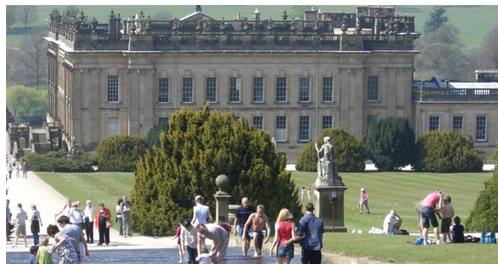
Chatsworth House and the cascades, a popular visitor attraction in the Derwent Valley