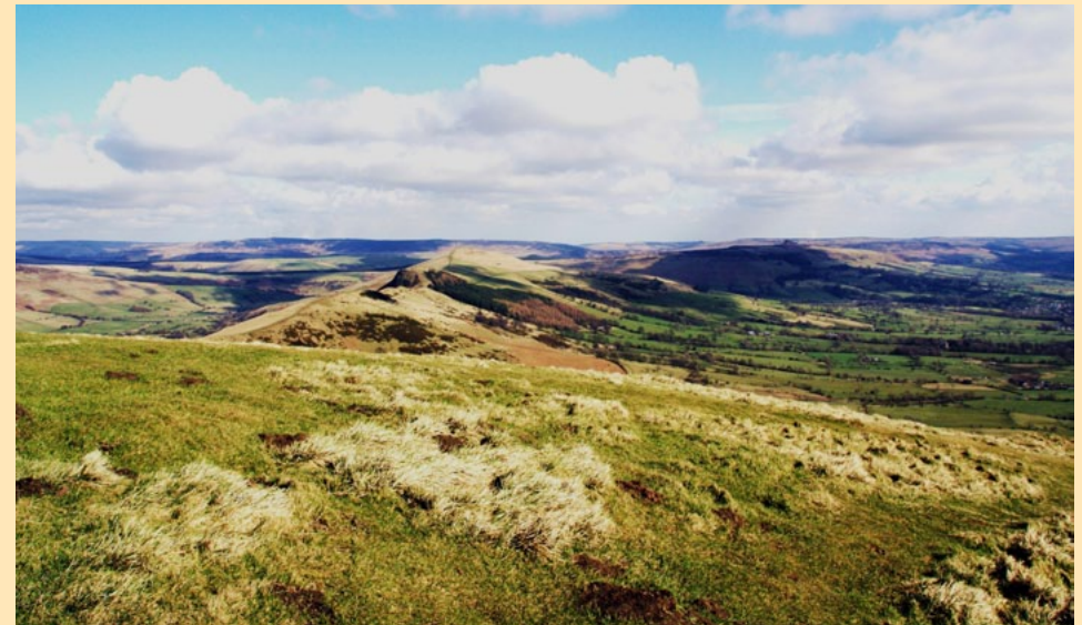
Moorland valleys from Mam Tor