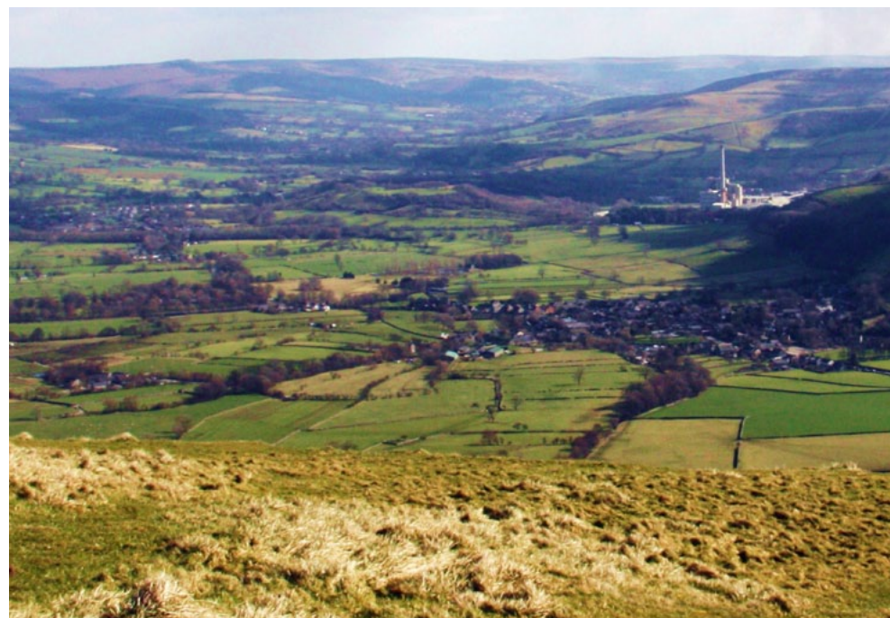
The settlements of Castleton and Hope enclosed by gritstone upland and limestone hills (to right) of the White Peak

Please note all figures contained within the report have been rounded to the nearest unit. For this reason proportion figures will not (in all) cases add up to 100%. The convention <1 has been used to denote values less than a whole unit.