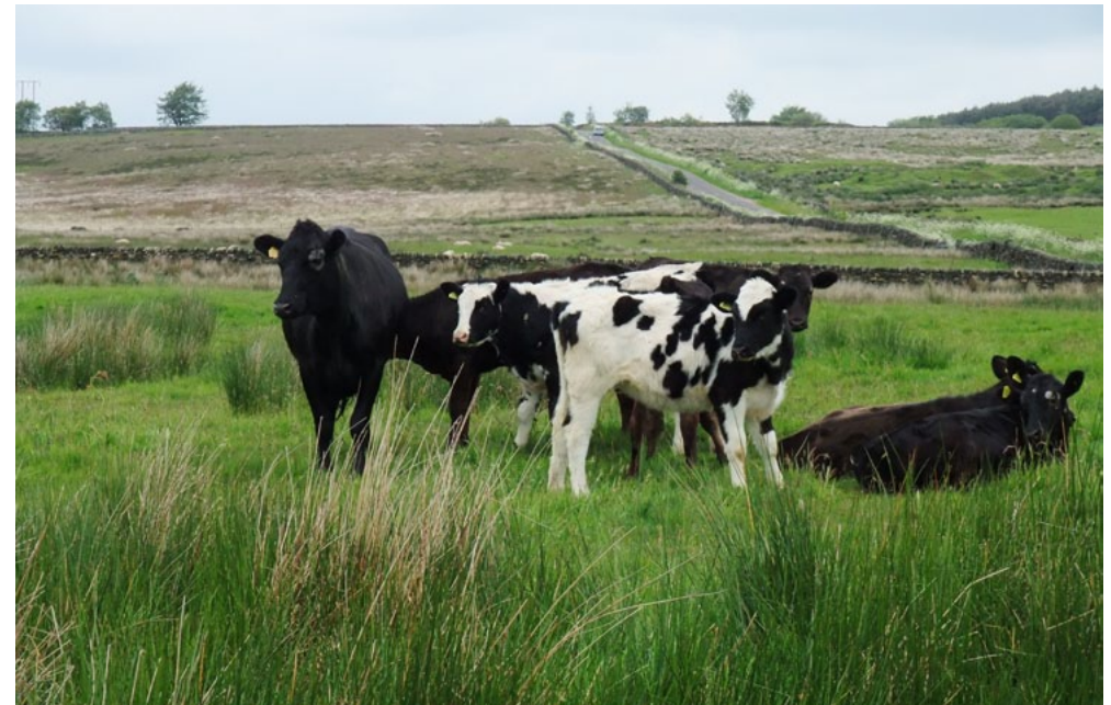
Cattle grazing on upland pastures of Bradfield Moors

Agriculture is largely limited to livestock grazing on upland pastures, with some small-scale dairy farming in the valley bottoms. Dry gritstone walls, built from local stone, are the only traditional form of field enclosure. Enclosures are generally irregular to regular in shape on flatter, lower margins, displaying a long history of enclosure from the medieval period, and larger in scale towards higher ground. Improved pastures are found on the relatively better quality land on lower moorland fringes and in the wider valleys, and in places (for example the Hope Valley) there are extensive strong, regular patterns of walled fields. Many of the farms hold rights, which they actively exercise, to graze livestock on the moorlands.