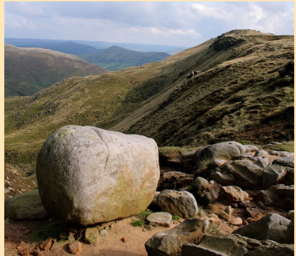
Grindsbrook Clough and first ascent of the Pennine Way National Trail