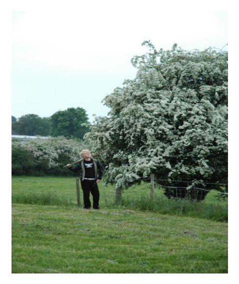
hawthorn young buds and berries can be foraged

http://www.smartsurvey.co.uk/s/sssi-occupier2/