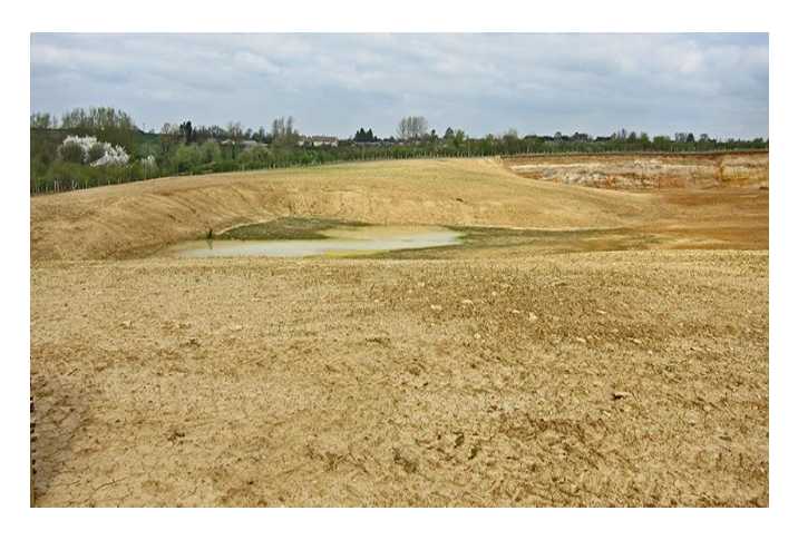
Restored face exposing the Horsehay Sand Formation and the Sharps Hill Formation (brown) at the top of the face.

The restoration leaves an extensive and stable face exposure of the Horsehay Sand Formation and overlying Sharps Hill and Taynton formations, and shows a complex assemblage of sedimentary structures that may provide further data in relation to the origins of the sands. The hummocky upper surface of the Northampton Sand Formation forms the floor of the quarry, and the junction with the Horsehay Sand Formation may easily be exposed by clearance of a small quantity of talus.