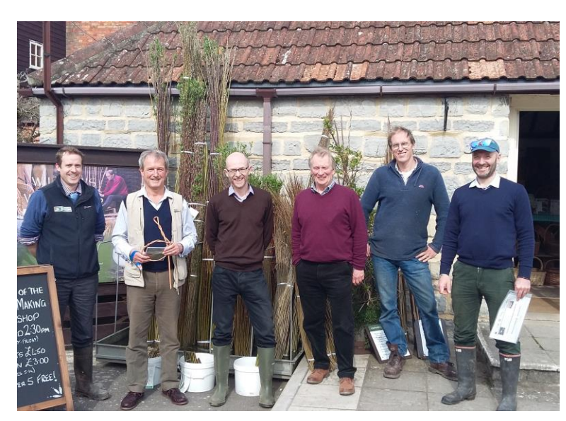
Owen Paterson visits a local farm

In order to restore the SSSI to Favourable Condition, additional action will probably be required in three key areas - further reduction of nutrients in the wider catchment and from local sources; interception of nutrients from the River Parrett if feasible; taking opportunities to manage the ditches and make them more resilient to nutrient enrichment. Funding has been secured for a PhD study to investigate options associated with ditch management.