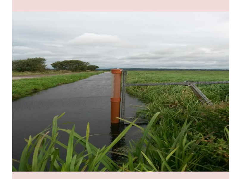
Continuous monitoring of the West Sedgemoor Site of Special Scientific Interest

In 2015/16, using Water Framework Directive funding (WFD), Natural England (NE) commissioned Plymouth University to undertake water quality monitoring to look in more detail at nutrient distribution across the site.