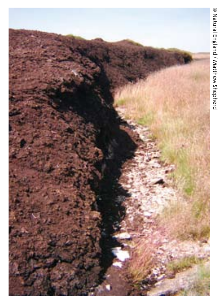
Damaged peatlands, like this bare peat hagg at Holme Moss in the Peak District, will be less able to retain their stored carbon during predicted hotter summers and wetter winters. Restoration management could protect more peat carbon, for longer.

in the long term, even in the absence of peatland restoration.