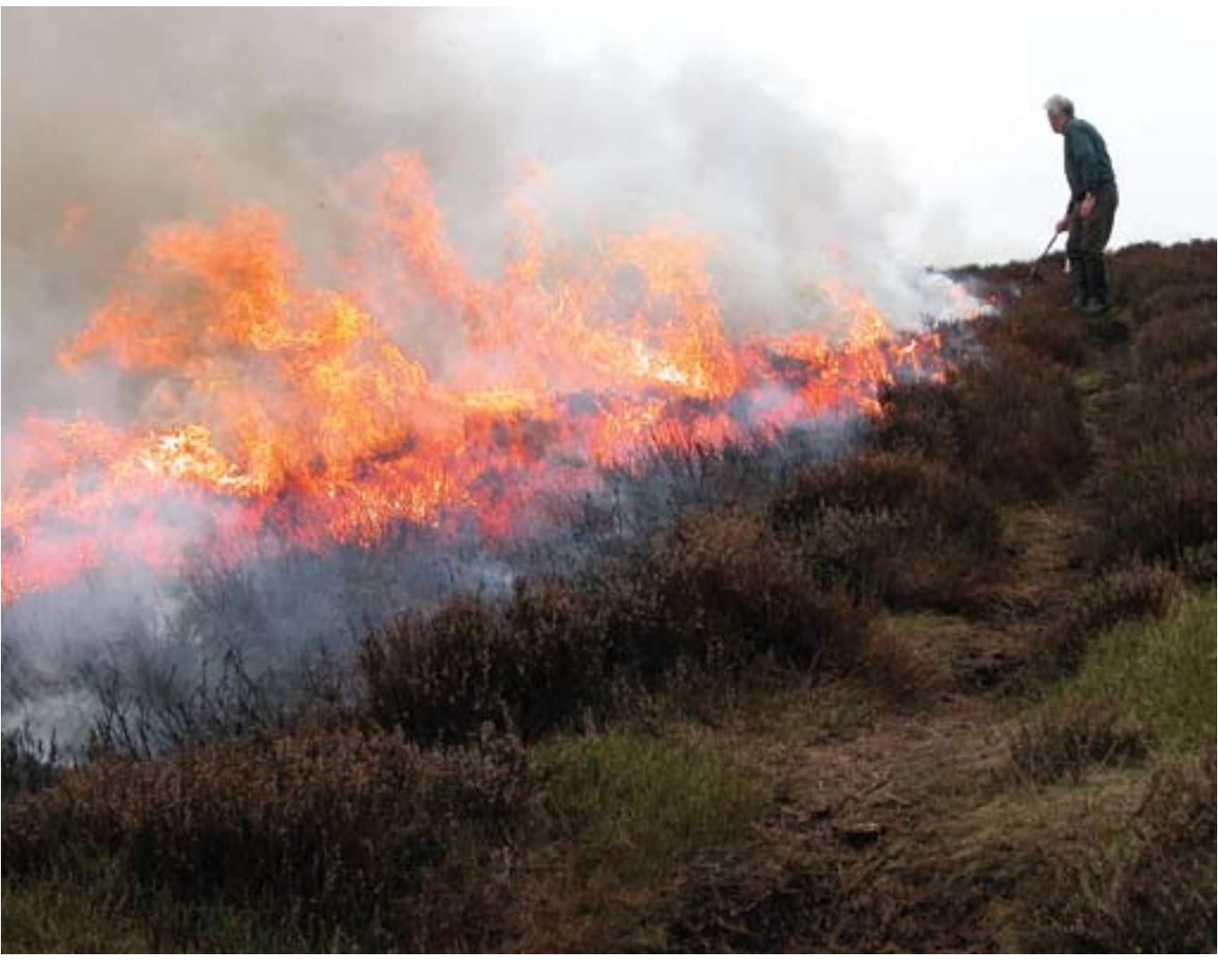
The heather and grass burning regulations prevent the most damaging burns, but rotational burning for rearing grouse affects over 1,000 km<sup>2</sup> of English blanket bog peatlands. A voluntary code of good practice advises land managers not to burn on blanket bog

Of particular relevance to the uplands, including undesignated peatlands, is the Heather and Grass (Burning) (England) Regulations 2007. These limit the size of burns,