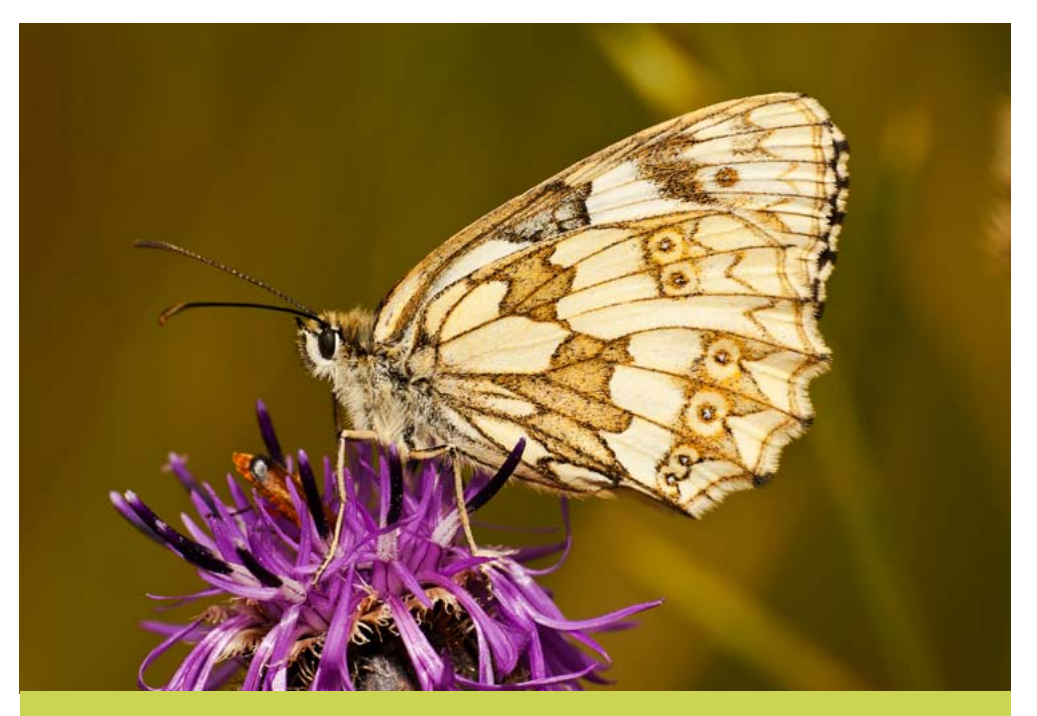
Calcareous grasslands support a mosaic of calcicolous plants, butterflies and moths such as the marbled white butterfly shown here.