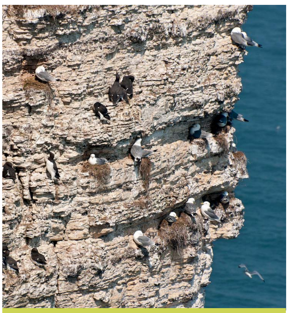
Bempton cliffs provide important habitat for colonies of internationally important seabirds such as guillemots and kittiwakes.