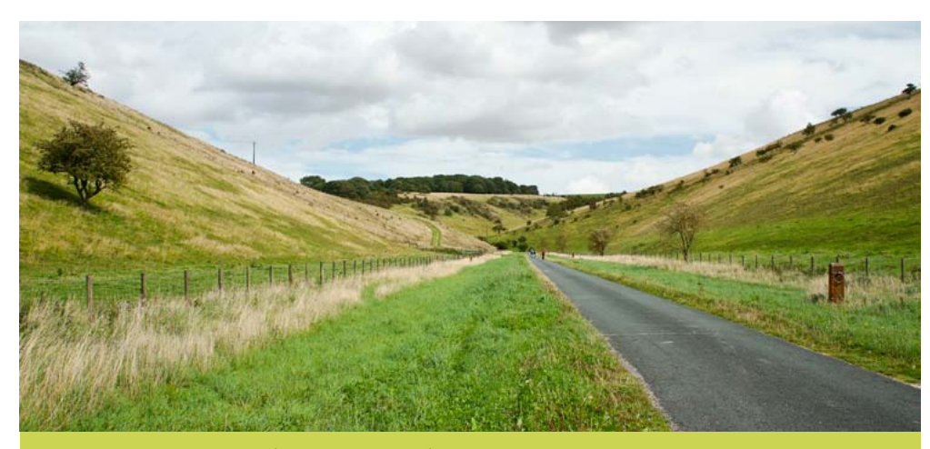
Despite a low density of public rights of way, there are opportunities to link permissive paths to strategic routes.