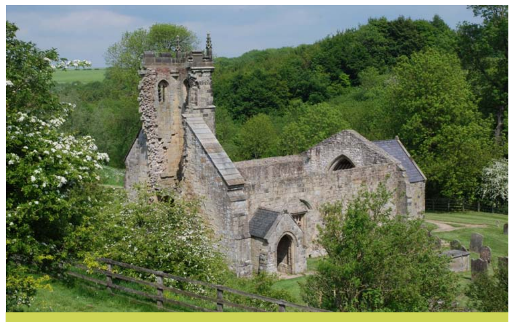
The Wolds has a history of recurrent periods of settlement including deserted medieval settlements like Wharram Percy.

Parliamentary enclosure of these open-field landscapes came rather later to the Wolds than to the adjacent vale landscapes of Holderness and the Vale of York. When enclosure came, it brought many of the features of today's landscape; hedges were planted to enclose large, regular fields; new large, brick-built farmsteads appeared scattered across the open farmland and well away from traditional villages and roads and, because of their exposed