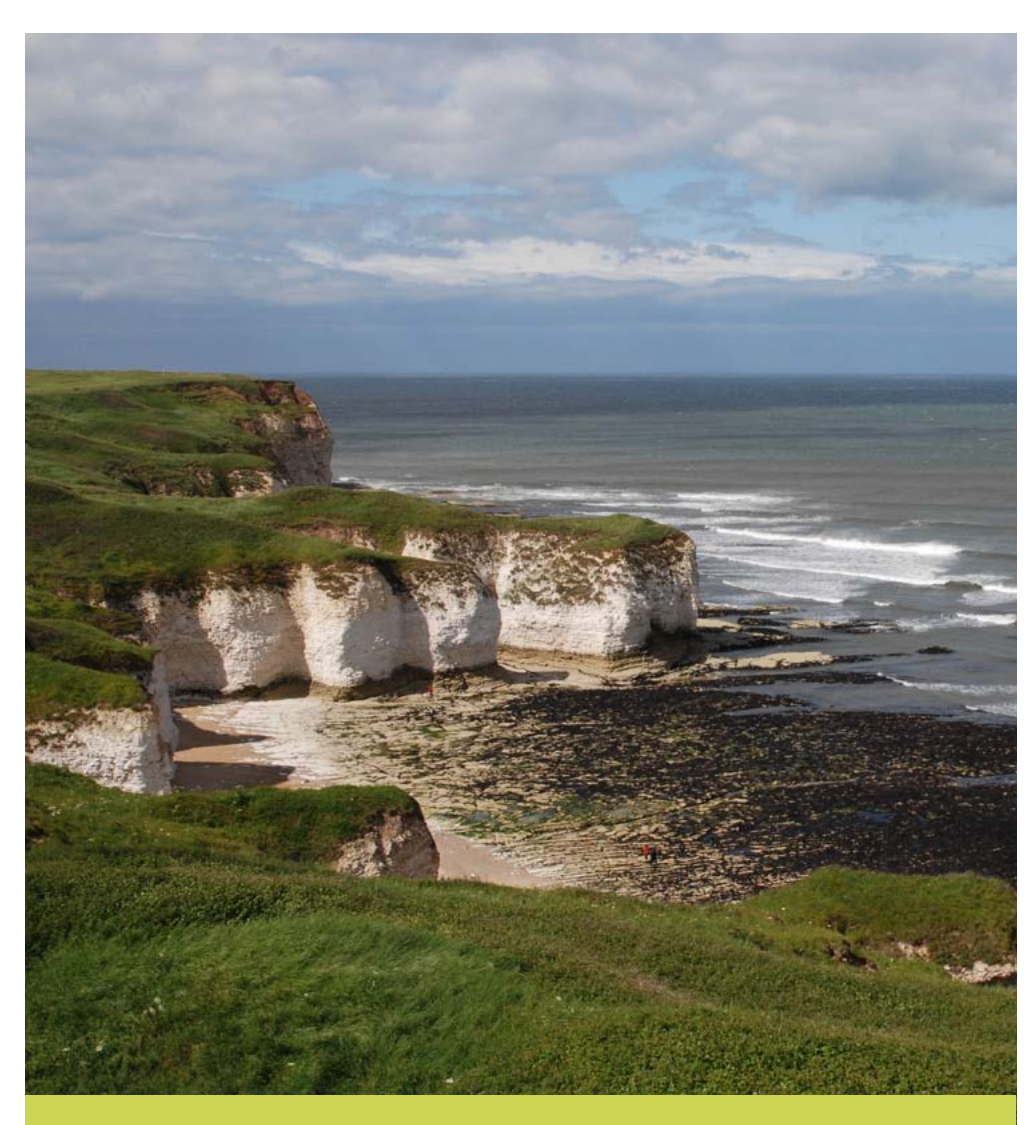
On the coast, the dramatic high chalk cliffs of Flamborough Head meet the North Sea.

■ Recreation: Although there is a low density of public rights of way, there are recreational opportunities through the Yorkshire Wolds Way, and the two national cycle routes – the Way of the Roses and the Yorkshire Wolds Cycle Route. Shorter, circular routes and easy-access walks are also established and have the potential to increase over time by making more links from permissive paths and bridleways to the main walking routes.