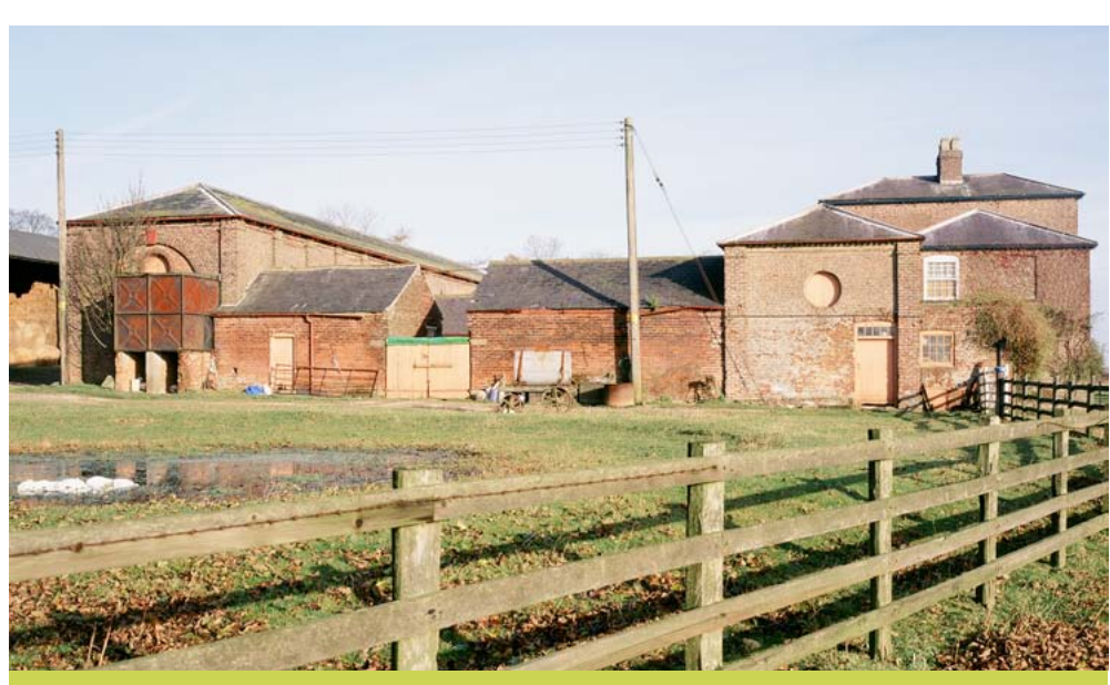
Sledmere Estate. Traditional buildings are constructed of brick and pan-tiled roofs.

In this remote landscape, the Yorkshire Wolds Way National Trail, a long distance route from Hull to Filey Brigg, provides an important recreation opportunity. Long and short walks can be enjoyed throughout the NCA and two national cycle routes pass through: the Way of the Roses, running coast to coast from Morecambe Bay to Bridlington Bay and a circular route known as the Yorkshire Wolds Cycle Route running from Beverley to Market Weighton.