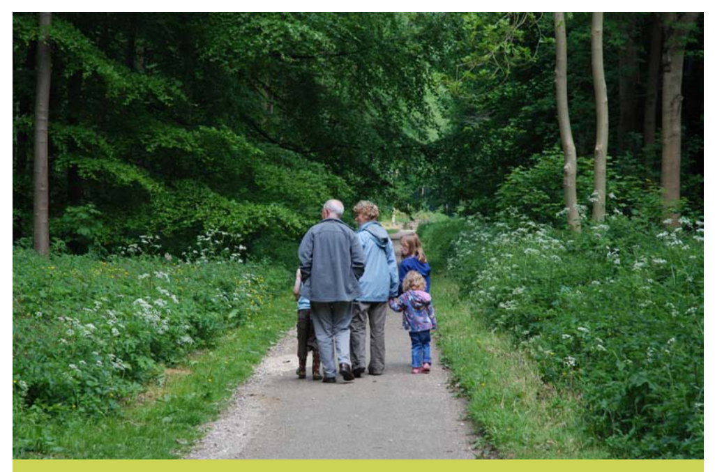
Millington Wood. A small number of calcareous ash woodlands are of nature conservation and recreational importance while creating variety and enclosure.

The Wolds plateau is dissected by numerous deeply incised valleys, which provide a sense of intimacy in contrast to the openness provided high on the plateau. Unimproved chalk grasslands, characteristic of the Wolds, occur on the steep side slopes of the dry valleys, and were once more widespread. Twenty sites are designated as SSSIs, and these are located above Pocklington, around Thixendale and in the north-eastern area at Fordon. They support a mosaic of calcium-loving plant species such as salad burnet, wild thyme and field scabious, and butterflies and moths such as the grayling and cistus forester. There are also many designated Local Wildlife Sites (LWS) throughout the NCA.