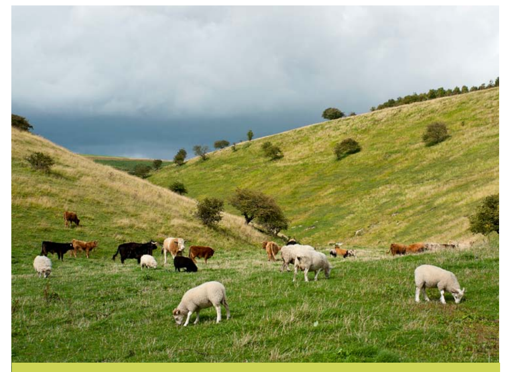
Planting semi-natural, chalk grasslands can help retain and purify water supplied by the underlying, chalk aquifer.

Biodiversity and geodiversity are crucial in supporting the full range of ecosystem services provided by this landscape. Wildlife and geologically-rich landscapes are also of cultural value and are included in this section of the analysis. This analysis shows the projected impact of Statements of Environmental Opportunity on the value of nominated ecosystem services within this landscape.