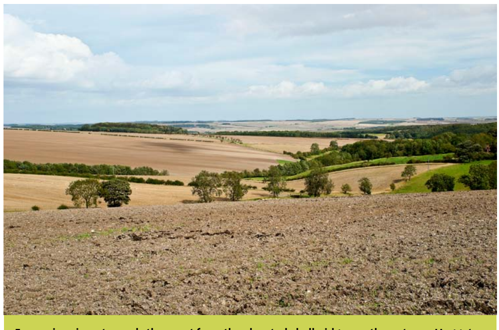
Expansive views towards the coast from the elevated chalk ridge, north-east near Huggate.