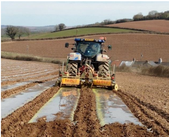
Fig 1 Maize drilling using degradable

The MGA with the support of Catchment Sensitive Farming (CSF) established a demonstration site in Tregony, Cornwall. Alongside cultivation, maize establishment, variety choice, herbicide and organic manure application plots, maize was established under degradable film with the aim being to demonstrate the potential of degradable film to enable earlier drilling and increased rates of crop development with the end result that harvest date is earlier than conventionally sown maize.