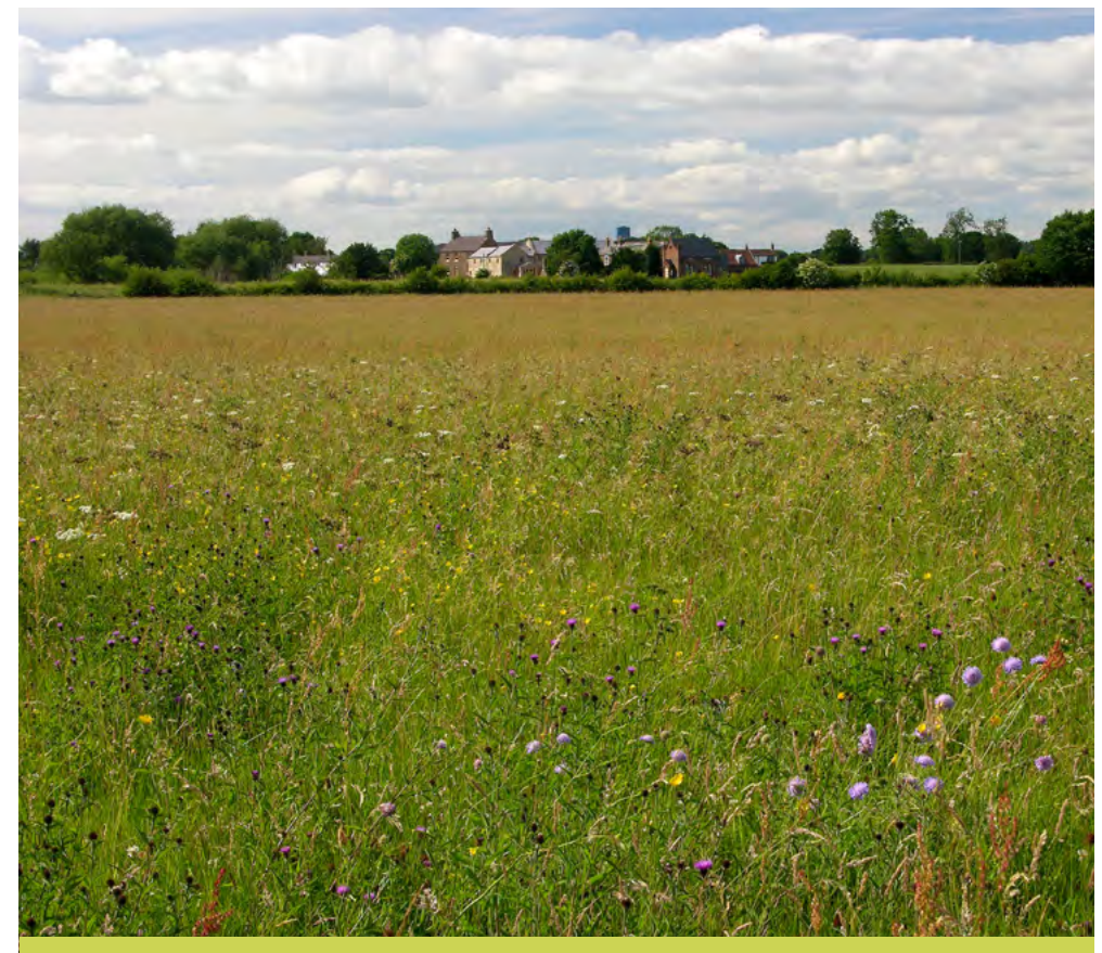
Patches of semi-natural habitat remain within the more intensely managed arable areas of the NCA and are important to provide a network for species movement.

Biodiversity and geodiversity are crucial in supporting the full range of ecosystem services provided by this landscape. Wildlife and geologically-rich landscapes are also of cultural value and are included in this section of the analysis. This analysis shows the projected impact of Statements of Environmental Opportunity on the value of nominated ecosystem services within this landscape.