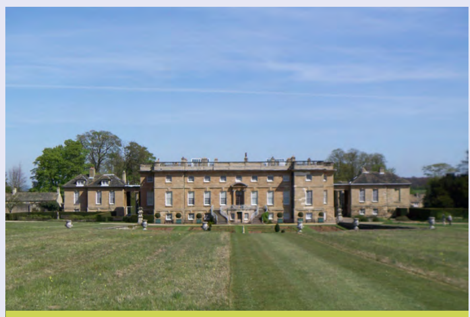
Bramham Park is one of a number of large country houses that have designed gardens and parklands.