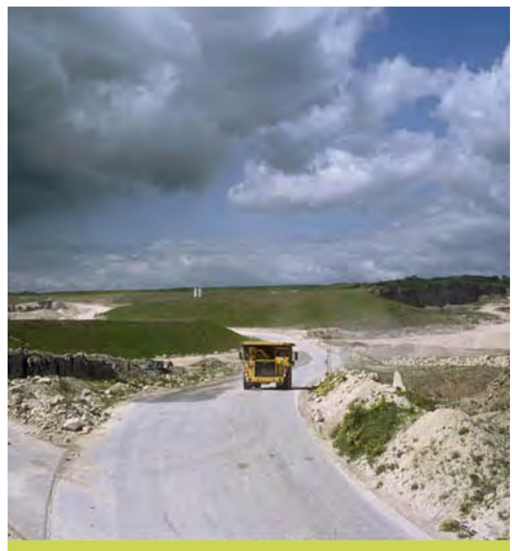
Limestone quarrying in central and southern areas has local impacts on the landscape but can also provide opportunities through restoration of sites after use.

North of Wetherby the Magnesian Limestone is largely covered with glacial deposits from the last glaciations. South of Wetherby the Magnesian Limestone has only a thin local cover of glacial deposits. The soils here are derived from the limestones and, locally, their associated red clays. They are generally very fertile and often support agricultural land classified as Grade 2 in quality.