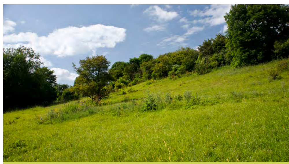
Hetchell Woods provides a refuge for species of lowland calcareous grassland habitat and a mosaic of grassland, woodland and wetter habitats.

The designed parklands and gardens, supported by estates, are a major influence on the landscape. With their extensive areas of woodlands, plantations and game coverts, in places they give the feel of a well-wooded landscape. The estates include early monastic abbeys such as Fountains Abbey and Newstead Abbey, and later; country houses established with the wealth generated from the industrialisation of the coalfield to the west. Designed parklands include the internationally renowned gardens at Studley Royal, along with Newby Hall, Bramham Park, Lotherton Hall, Brodsworth Park, Hardwick Hall and Annesley Hall. Fountains Abbey is part of the Studley Royal and Fountains Abbey World Heritage Site and provides outstanding value to the area through the designed landscape and associated Cistercian abbey.