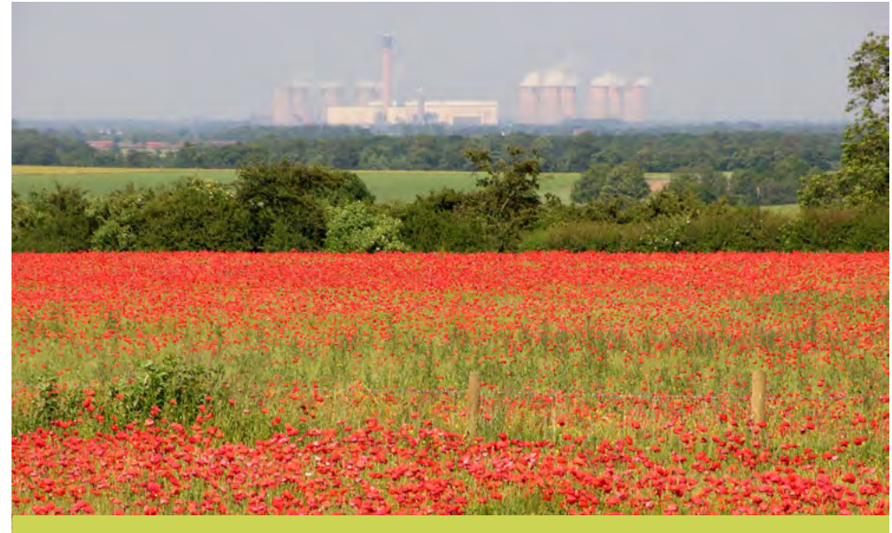
There are some large wooded areas within the NCA giving some places a well wooded feeling within the more open landscape.

There is evidence that, from the Iron Age to well after the end of the Roman occupation, there was increased agricultural exploitation of the area with the use of ditches and banks to define settlements, stock pens, fields and tracks. In this period, the landscape had probably been cleared of much woodland and was occupied by single, quite widely spaced farmsteads with their associated field systems and ditched trackways leading outwards to the open pastures and woodland. Examples of important defensible hill forts remain from this period at Barwick in Elmet in the central section and Markland Grips in the south.