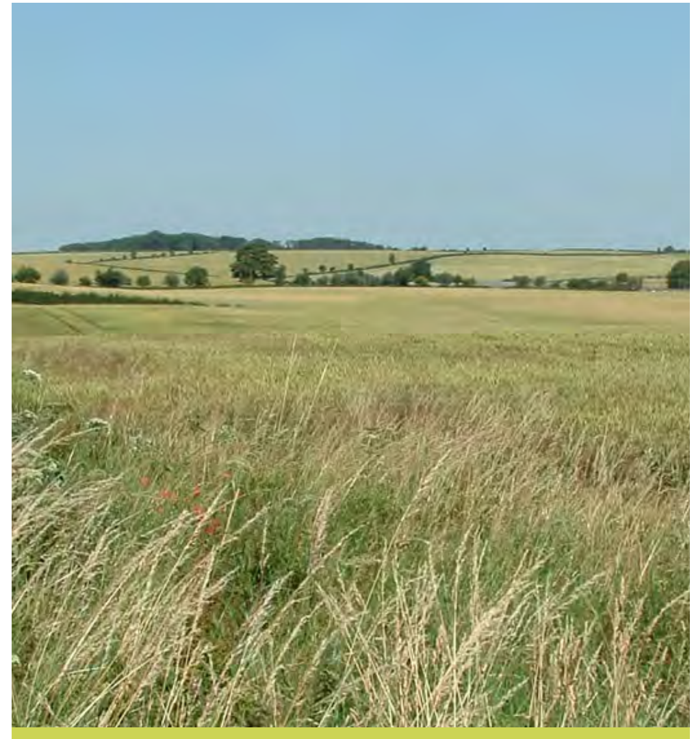
The low limestone ridge runs north-south through the NCA which is of an open, farmed character with few hedgerow trees.

More information is available at the following address: http://www.cpre.org.uk/campaigns/planning/intrusion/our-intrusion-map-explained