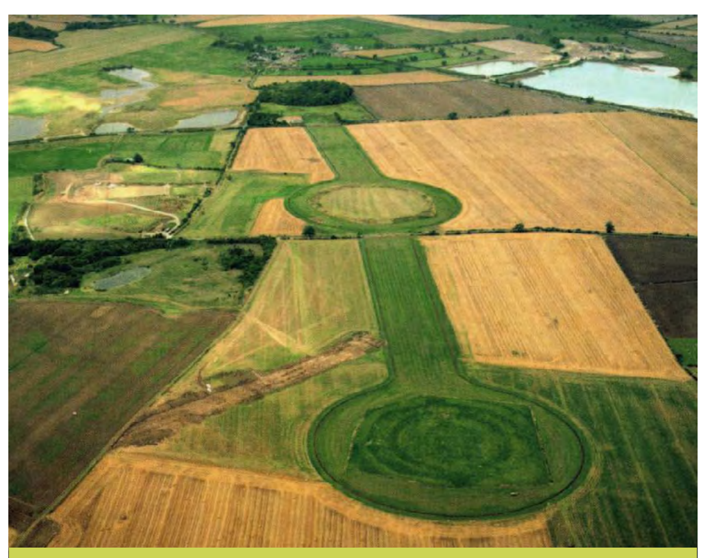
The three henges at Thornborough are of national importance and form part of a complex Neolithic and bronze-age ceremonial landscape.

Managing and maintaining these key landscape characteristics will be important in retaining the 'essence' of the Southern Magnesian Limestone NCA. There is a need to promote sustainable agriculture and appropriate hedgerow and woodland management and planting. Appropriate habitat enhancement and links are fundamental to this, along with guiding suitable development and appropriate mitigation of the impacts of changes to the landscape.