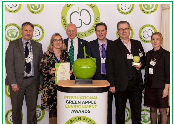
Some of the CSF and South East Water team receiving the Gold Award at the Green Apple Environment Awards

In November 2019 the ground-breaking scheme won a gold award at the internationally recognised Green Apple Environment Awards for Environmental Best Practice 2019. The awards recognise, reward and promote environmental best practice around the world.