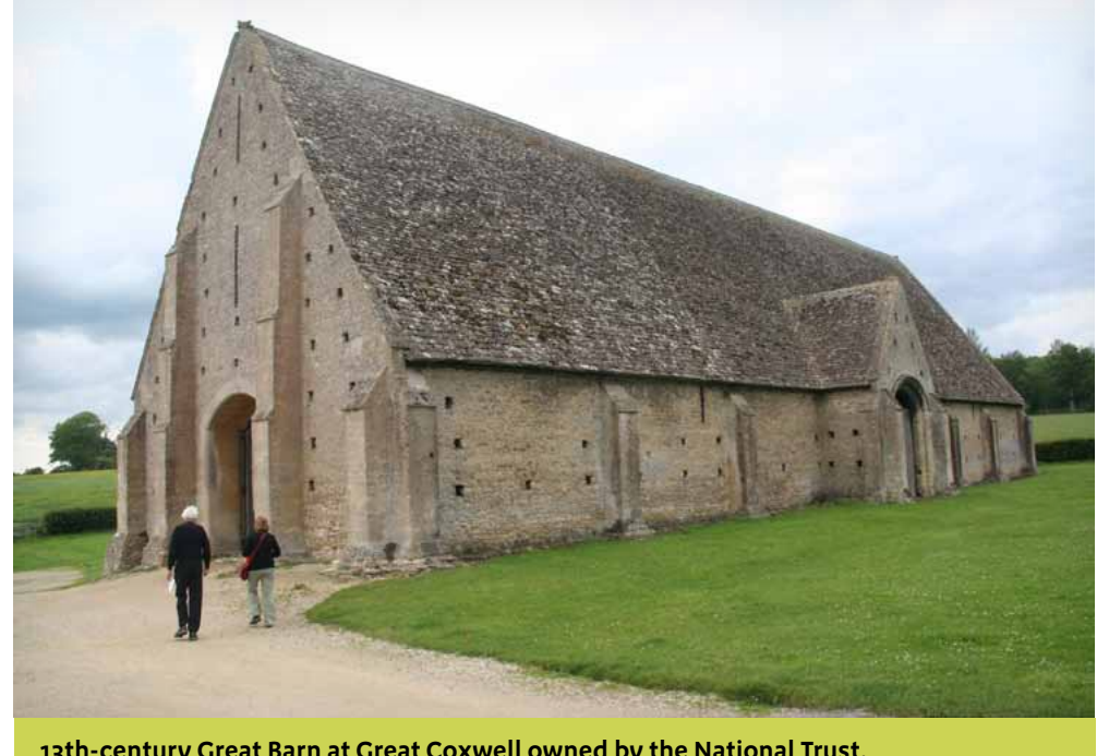
13th-century Great Barn at Great Coxwell owned by the National Trust.

The ridge has good tree cover. On moister soils, particularly around Oxford, ash, oak, hazel and field maple are common. Elsewhere, on the drier soils across the ridge, the characteristic tree types are oak and birch with significant plantations of conifers. To the east of Oxford lies Shabbington Wood, the largest surviving remnants of the former Royal Forest of Bernwood, important for the rare black hairstreak butterfly. While significant parts were managed as conifer plantations, most are now being managed to gradually return them