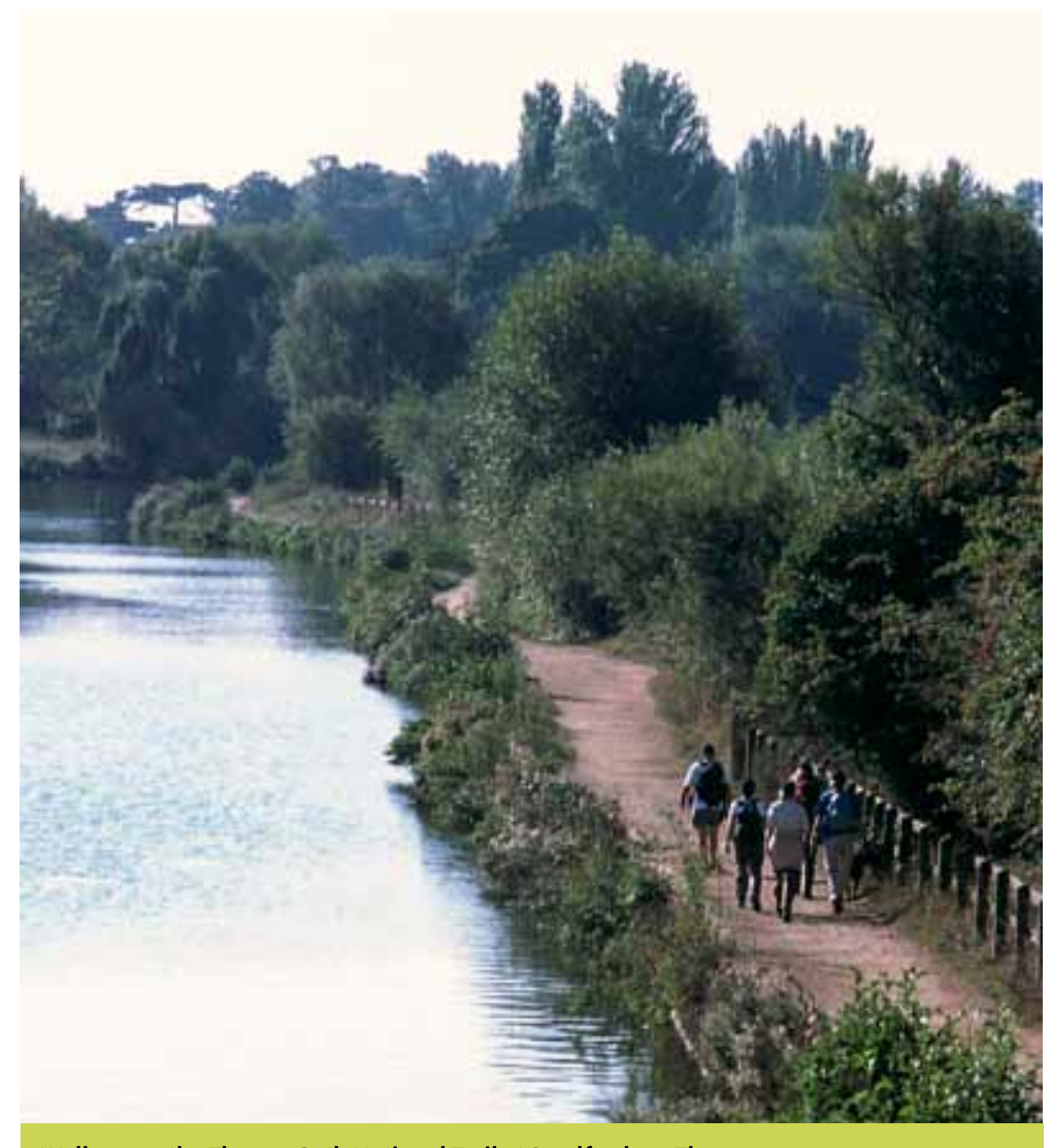
Walkers on the Thames Path National Trail at Sandford-on-Thames.