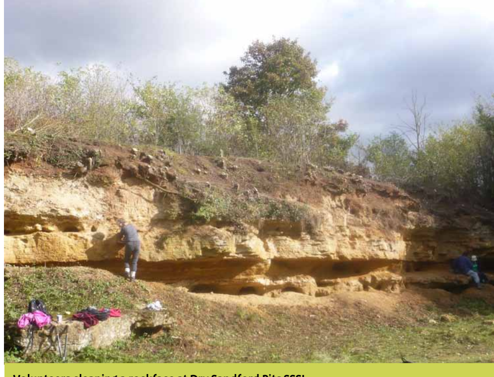
Volunteers cleaning a rockface at Dry Sandford Pits SSSI.

during the Jurassic it was covered by a shallow tropical sea. Noteworthy fossils of international importance, including the holotypes for several ammonite species and prehistoric sponges, have been found here. The local limestone has been used as a source of building material since the Middle Ages, providing the stone for some of the Oxford colleges.