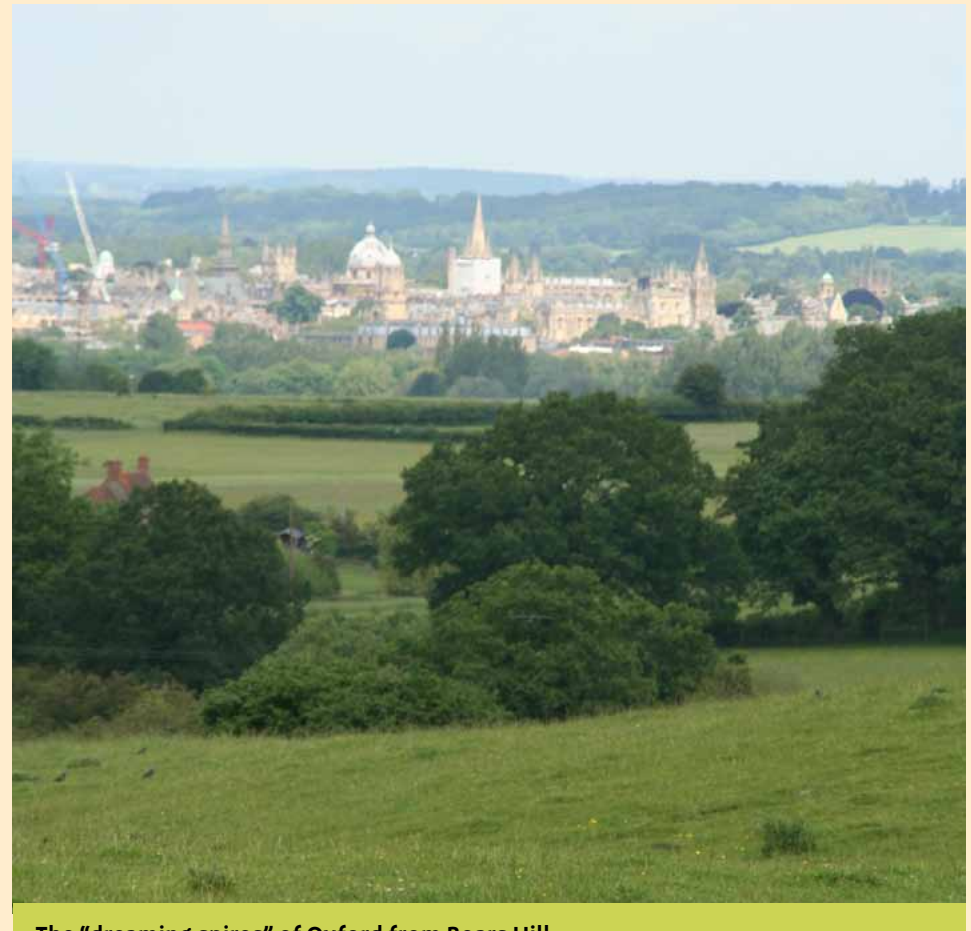
The "dreaming spires" of Oxford from Boars Hill.