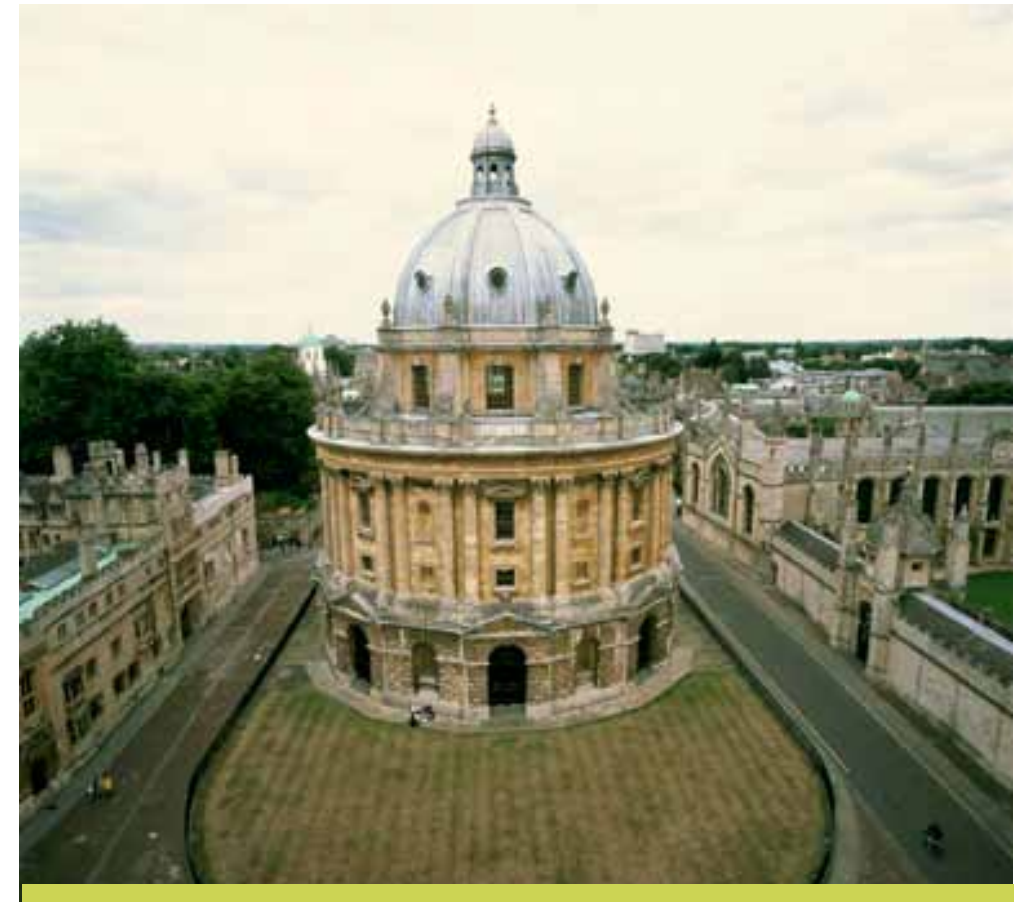
Radcliffe Camera, Oxford, built in part from stone quarried on the Midvale Ridge.

Biodiversity and geodiversity are crucial in supporting the full range of ecosystem services provided by this landscape. Wildlife and geologically-rich landscapes are also of cultural value and are included in this section of the analysis. This analysis shows the projected impact of Statements of Environmental Opportunity on the value of nominated ecosystem services within this landscape.