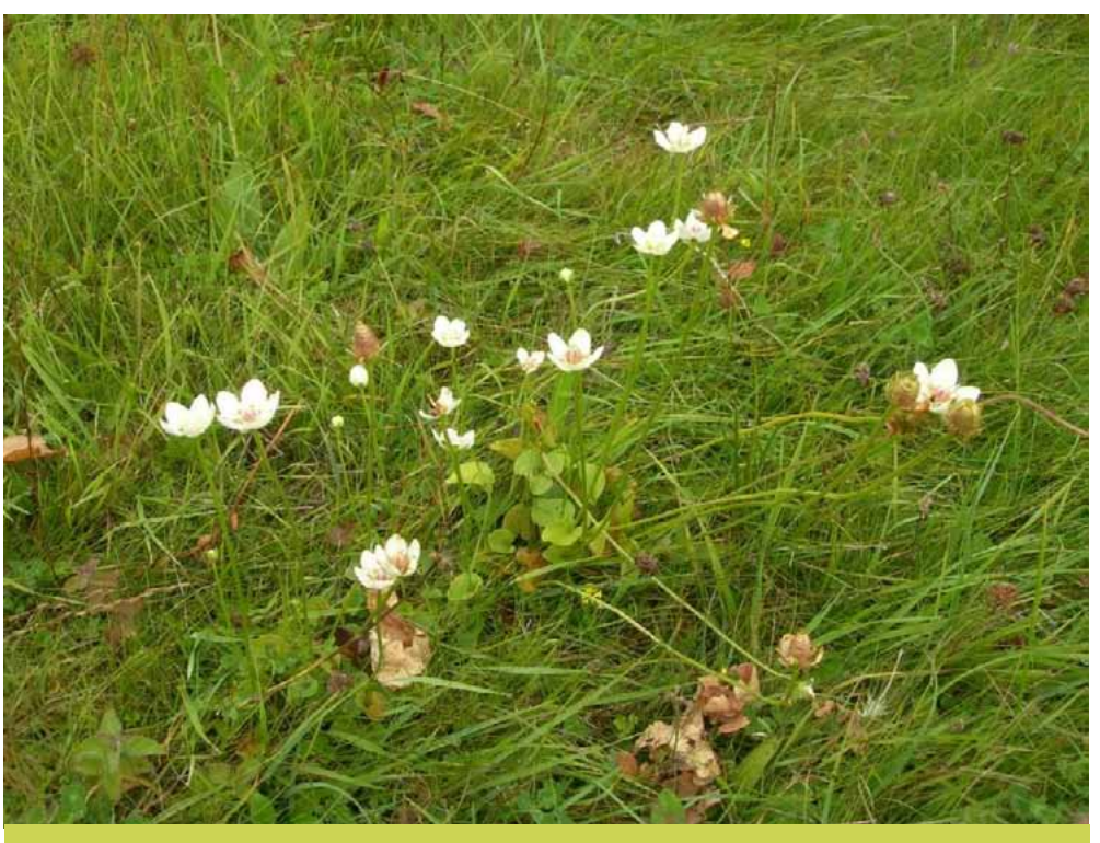
Grass of Parnassus at Frilford Heath.

■ The expansion of arable farming in the area has led in places to a reduction or complete loss of hedgerows. The estimated boundary length for the NCA in 2003 was about 3,079 km of which about 4 per cent was under Countryside Stewardship Agreements.