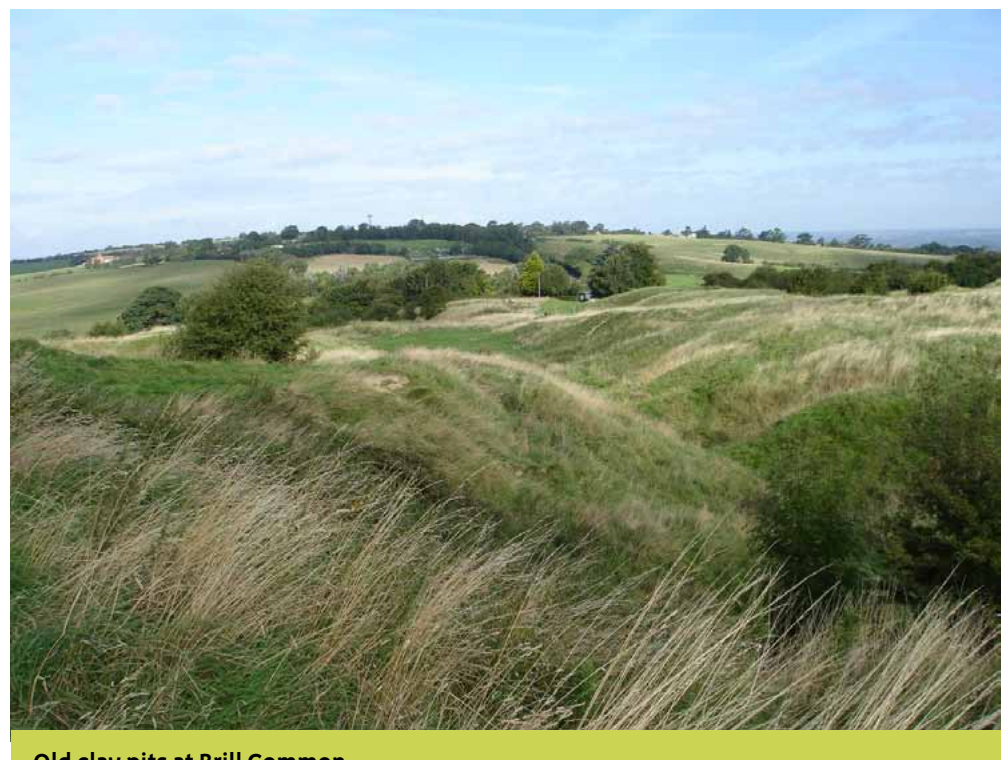
Old clay pits at Brill Common.

SEO 4: Maintain and enhance the National Character Area's internationally important geological heritage for the educational benefits it provides, its contribution to a sense of place and history and to increase recreational opportunities.