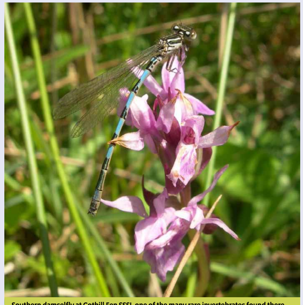
Southern damselfly at Cothill Fen SSSI, one of the many rare invertebrates found there.