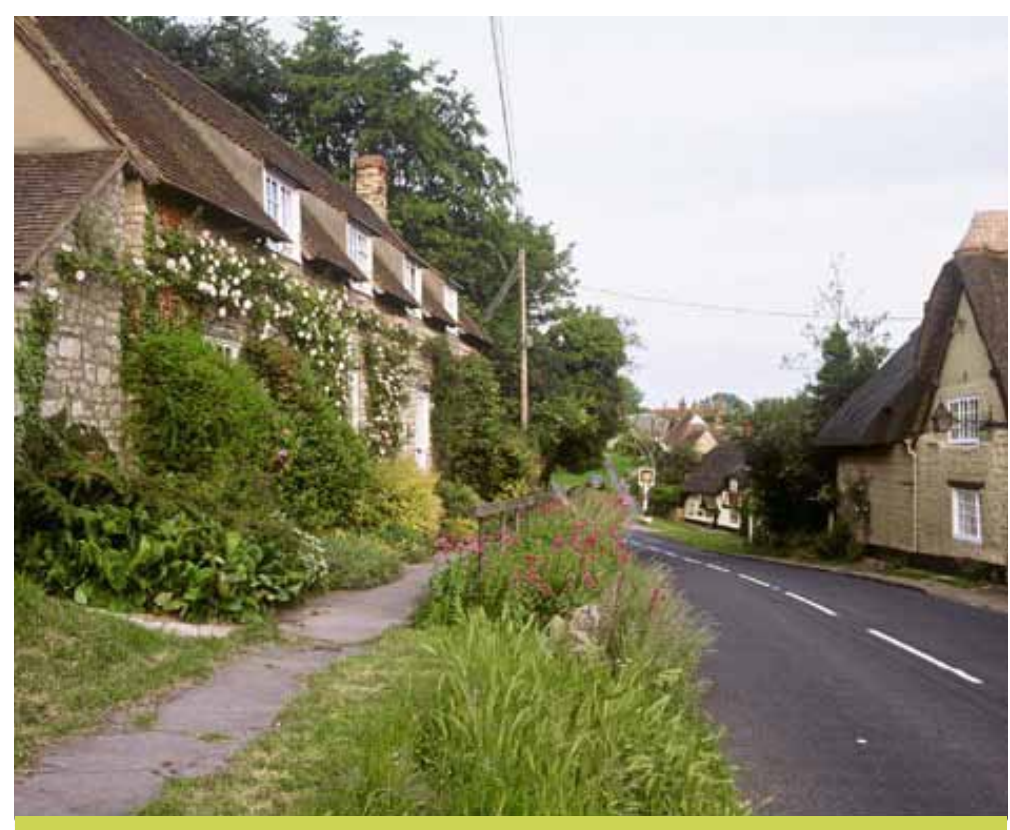
Traditional stone built cottages at Marsh Baldon, Oxfordshire.