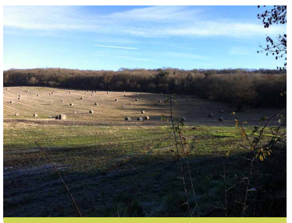
Wytham Woods near Oxford, used for environmental research and adjacent land under environmental stewardship.

Please note all figures contained within the report have been rounded to the nearest unit. For this reason proportion figures will not (in all) cases add up to 100%. The convention <1 has been used to denote values less than a whole unit.