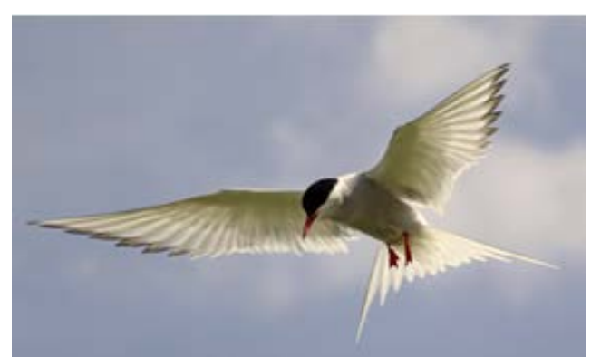
Arctic tern, Sterna paradisaea, foraging near the Farne Islands SPA

SPAs on land in the UK are now well established, but to provide seabirds, such as terns, with the protection they need, further work is required to establish SPAs at sea. The UK Government is committed to identifying SPAs in the marine environment by November 2015.