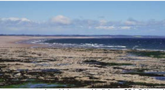
Intertidal area at Lindisfarne SPA

protect additional species within our existing SPAs.