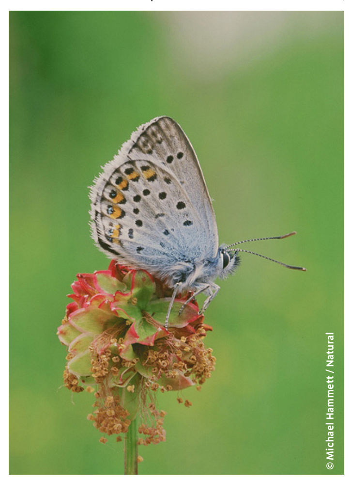
Silver Studded Blue Butterfly

The draft West Dorest, Weymouth and Portland Local Plan notes that the project is being brought forward as part of the Olympic Legacy, ensuring better public access, long-term management and interpretation for these culturally important sites. The Local Plan policy for the Nature Park is to 'promote sustainable tourism, management of conservation and heritage