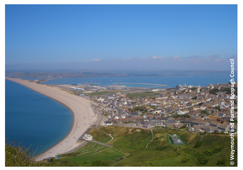
View looking west across Chesil Beach and Portland towards Weymouth Bay from Tout Quarry