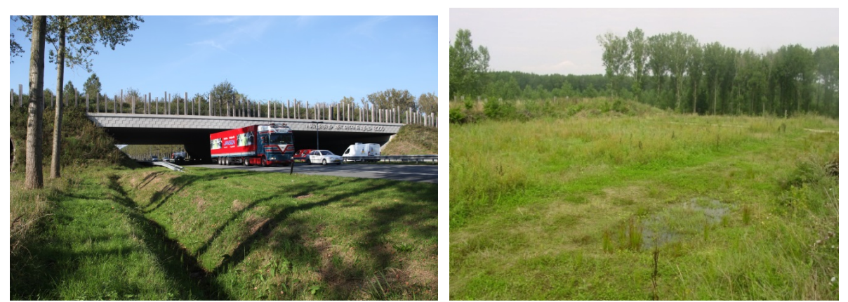
Photographs showing the Groene Woud

3.24 Another Dutch bridge which is designed with water in mind is the Ecoduct Wambach, constructed 2011-12 (2012 IENE). This is the first green bridge designed with climate change resilience. The design considered climate change resilience to match the water management on the green bridge with Intergovernmental Panel on Climate Change based climate scenarios of the Royal Dutch Meteorological Institute. Concrete ridges are glued to the deck of the green bridge which forms basins to retain water available for drought periods. Polystyrene bases of embankments retain water through raised edges covered with foil. To avoid excess water during rainfall peaks, an oversized drainage system has been designed to channel water to two ponds. The drainage system may also be used in a reversed fashion, to supplement the green bridge with water.