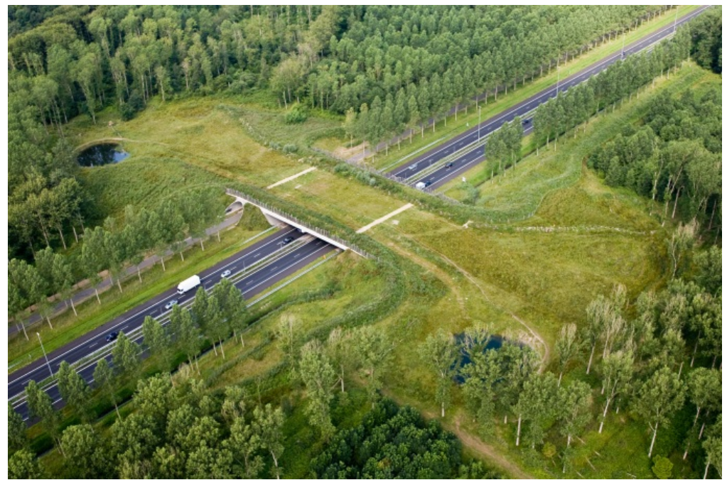
Photograph of Groene Woud