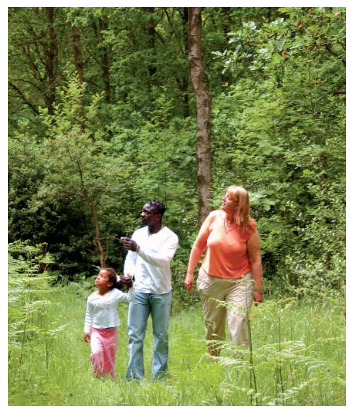
Walking through Hamsterley Forest.