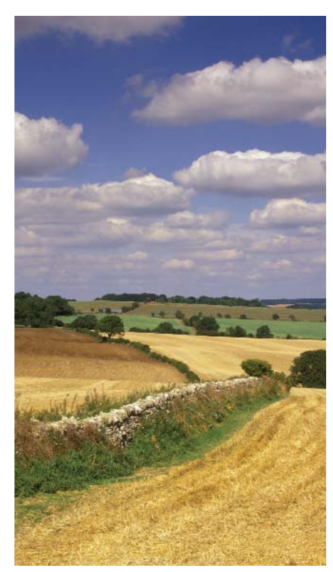
Nick Turner/Natural England