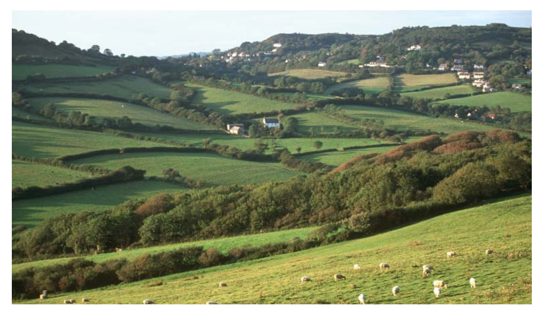
The Dorset Downs, one of four pilot areas selected to assess the impact of climate change