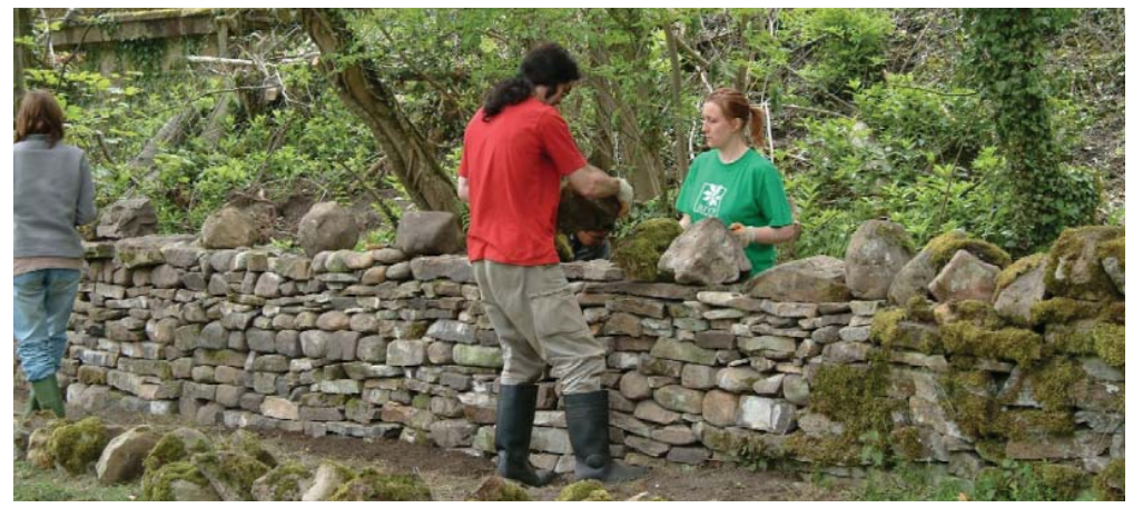
Tony Devos/Natural England