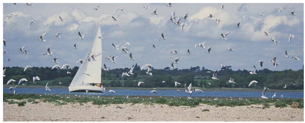
Chris Gomersall/Natural England