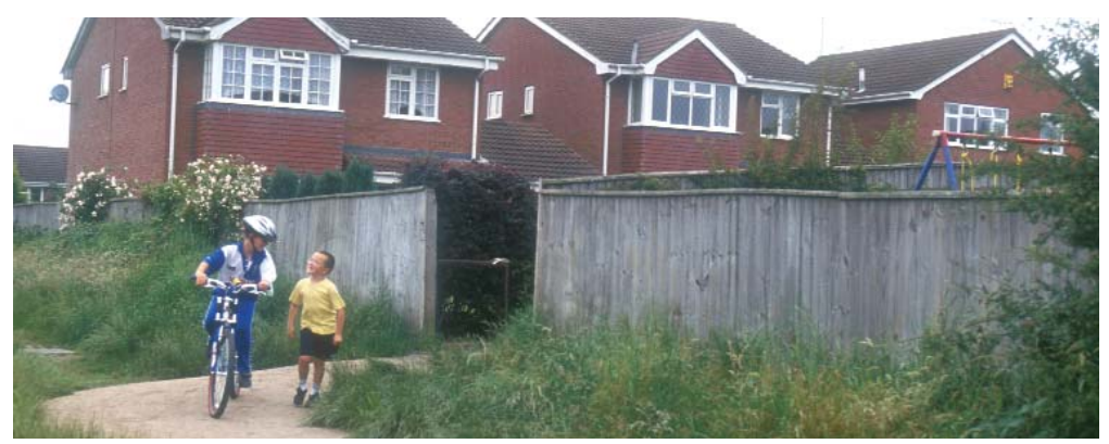
Julia Bayne/Natural England