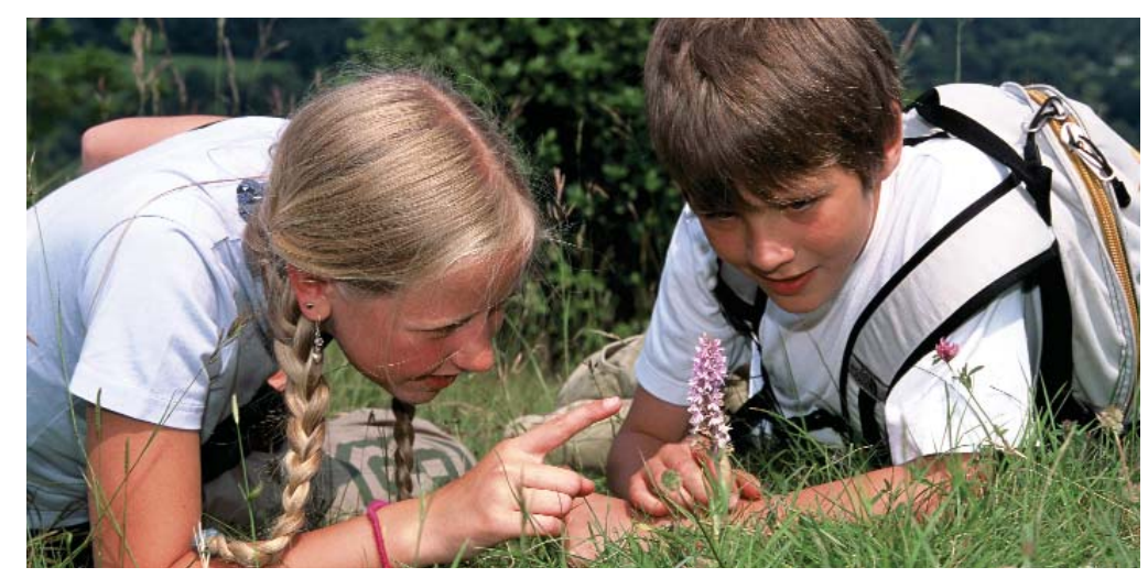
Identifying an orchid at Elliot Nature Reserve, near Stroud.