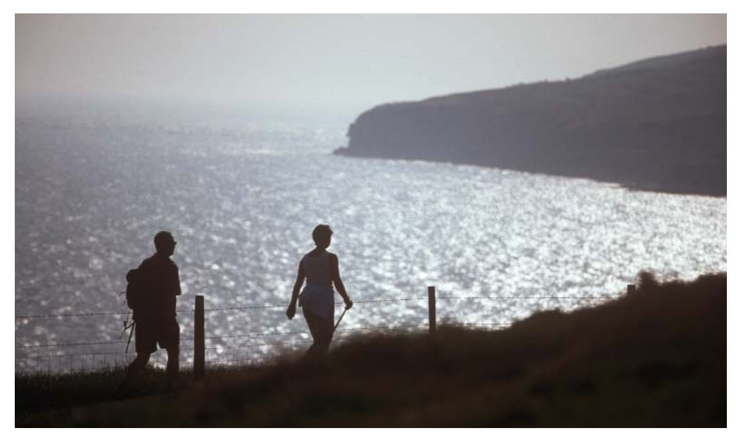
Walkers along the South West Coast.