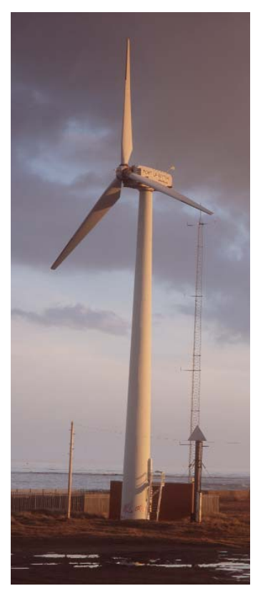
Wind farm, Blyth Harbour.