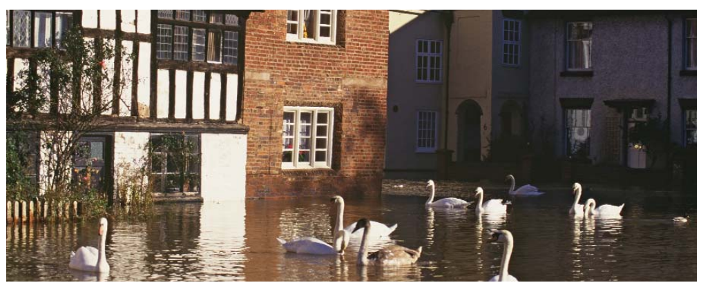
Flooding in Bewdley, Worcestershire.