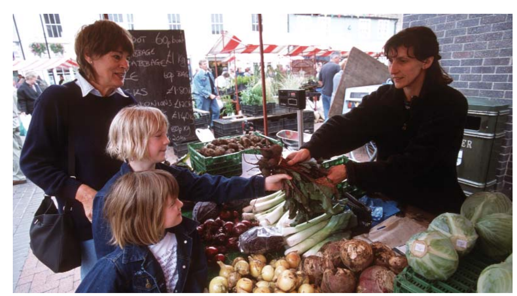
Farmers market, Cambridgeshire.