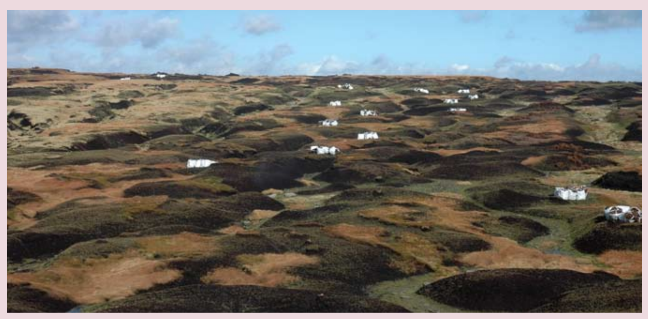
On-going restoration of Bleaklow using heather brash laying techniques