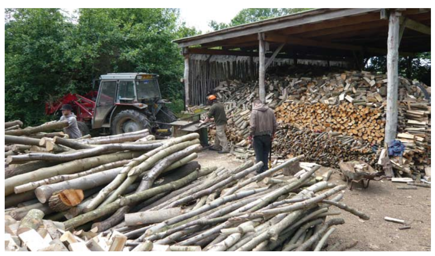
Logs for woodfuel

Wood has the potential to be used as a renewable carbon neutral fuel and the Forestry Commission Woodfuel Strategy aims to increase woodfuel harvesting to substitute for o.4 million tonnes of carbon per year from fossil fuels (FC, 2007). It can also replace materials such as iron, steel and concrete, the production of which involves high fossil fuel use; timber use in house construction could reduce carbon emissions by up to 73 per cent (FC, 2006).