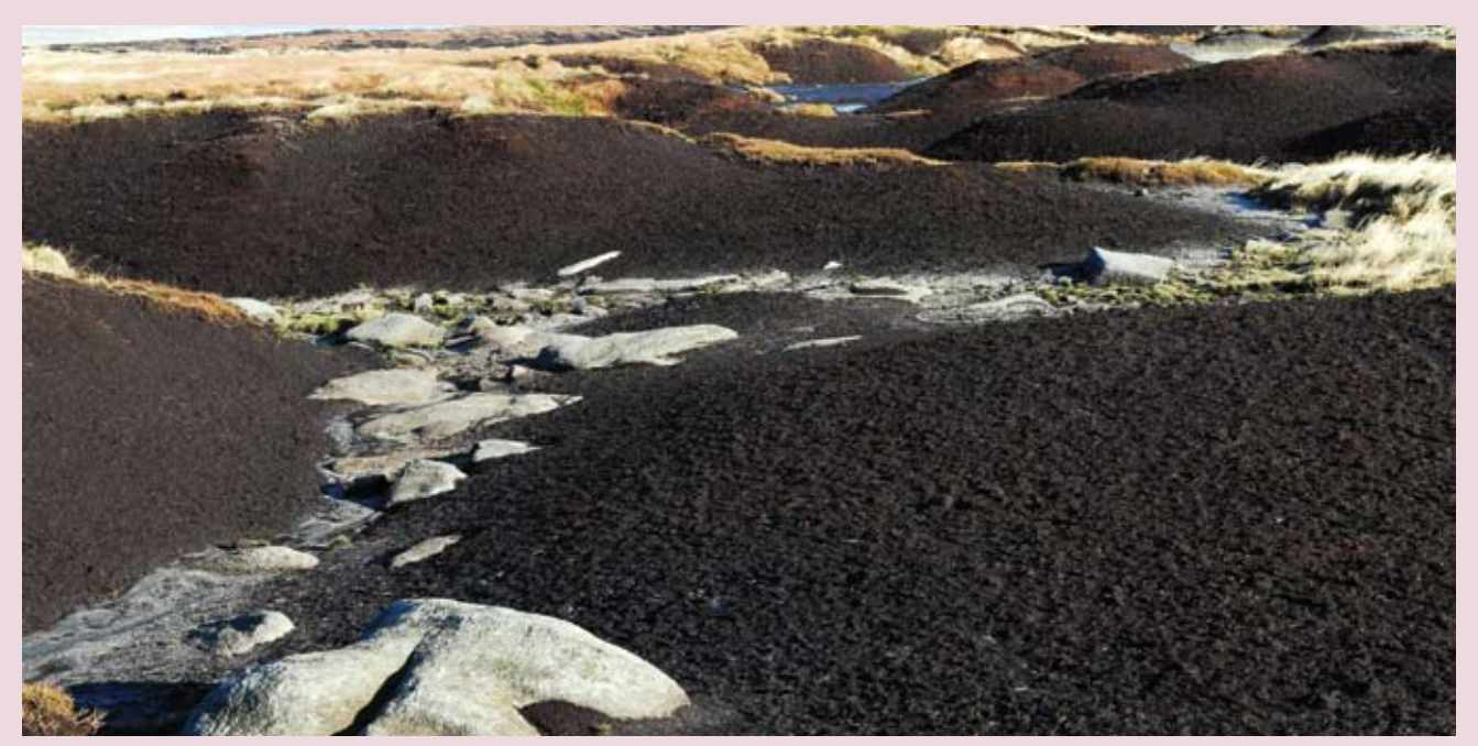
An un-restored area on Bleaklow