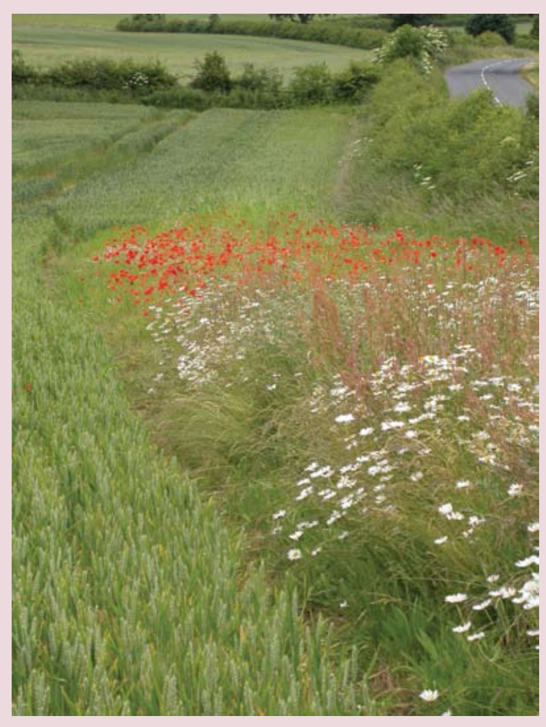
Conservation edge to an arable field

The evidence suggests that, on the whole, these schemes make a vital contribution to environmental outcomes in England (see forthcoming Natural England publication Agri environment schemes in England ). Given the current limited set of policy levers available, agri-environment schemes are likely, for the foreseeable future, to continue to be the only mechanism for rewarding those who deliver a wide range of ecosystem services from the farmed environment. Continued investment is therefore vital.