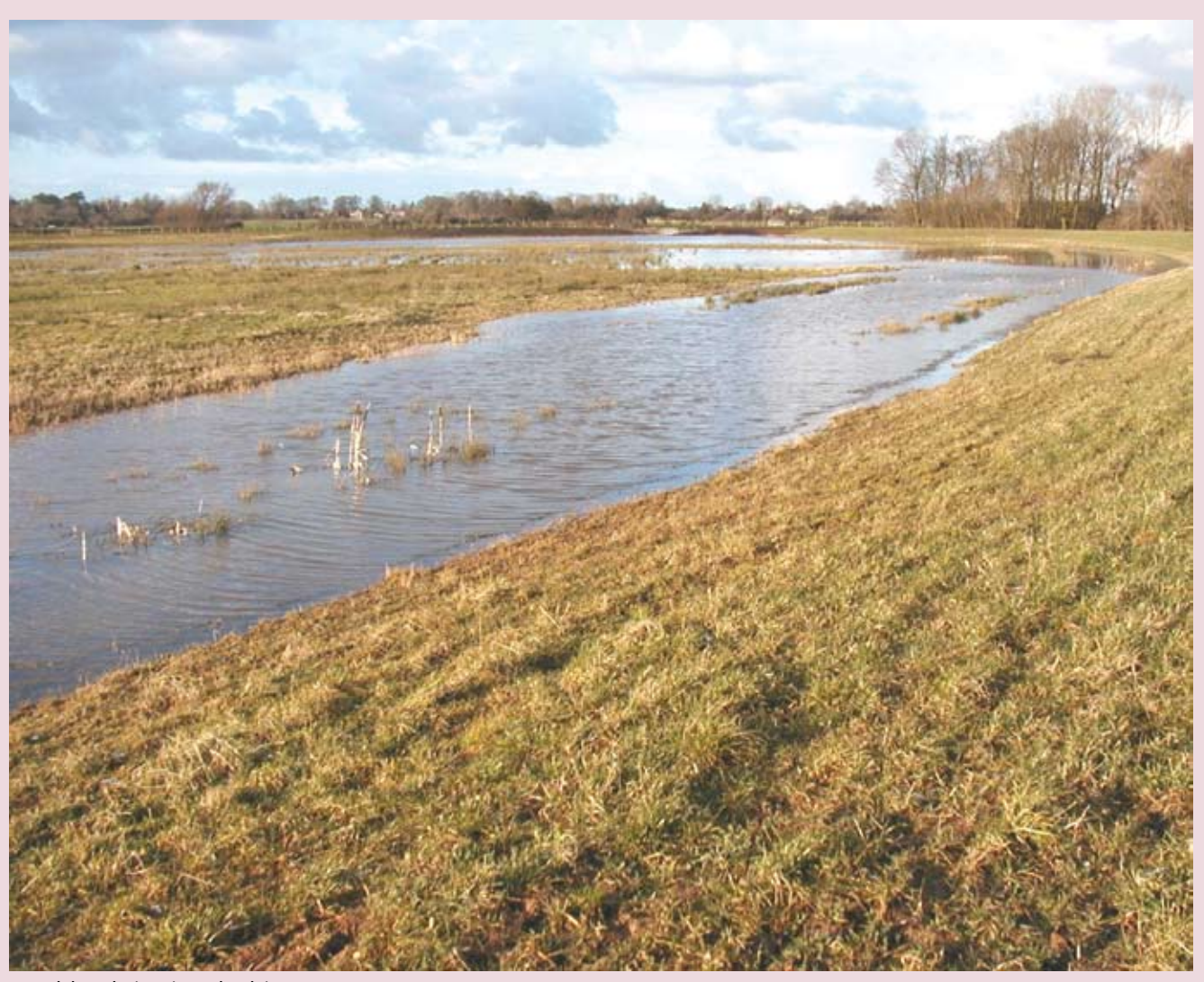
Washlands in Lincolnshire