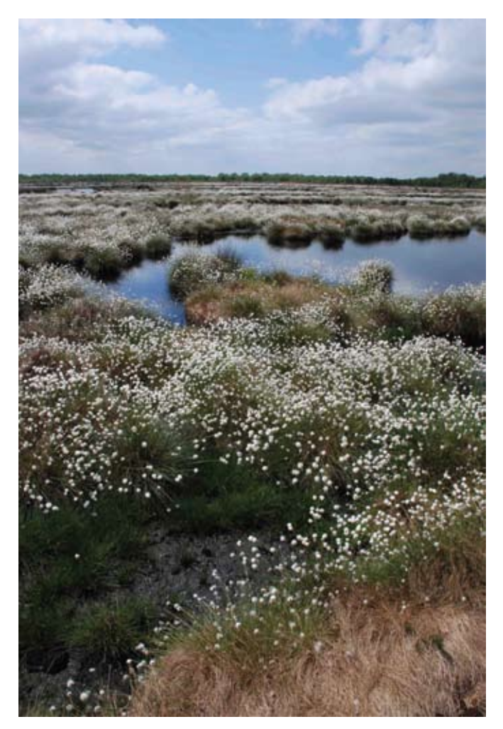
Thorne Moors; Thorne, Crowle and Goole Moors SSSI – a lowland raised bog providing carbon storage, water regulation, recreation and conserving biodiversity

CAP may next change significantly in 2014, when the new EU 'multi-annual financial framework' comes into operation and existing Rural Development Programmes come to an end. As part of this next reform, Natural England believes there is a need for a largescale transfer of funds from income support to support for sustainable rural development. This includes securing environmental goods and services, such as climate change adaptation and mitigation, which would not otherwise be provided by markets but are nevertheless essential for future wellbeing.