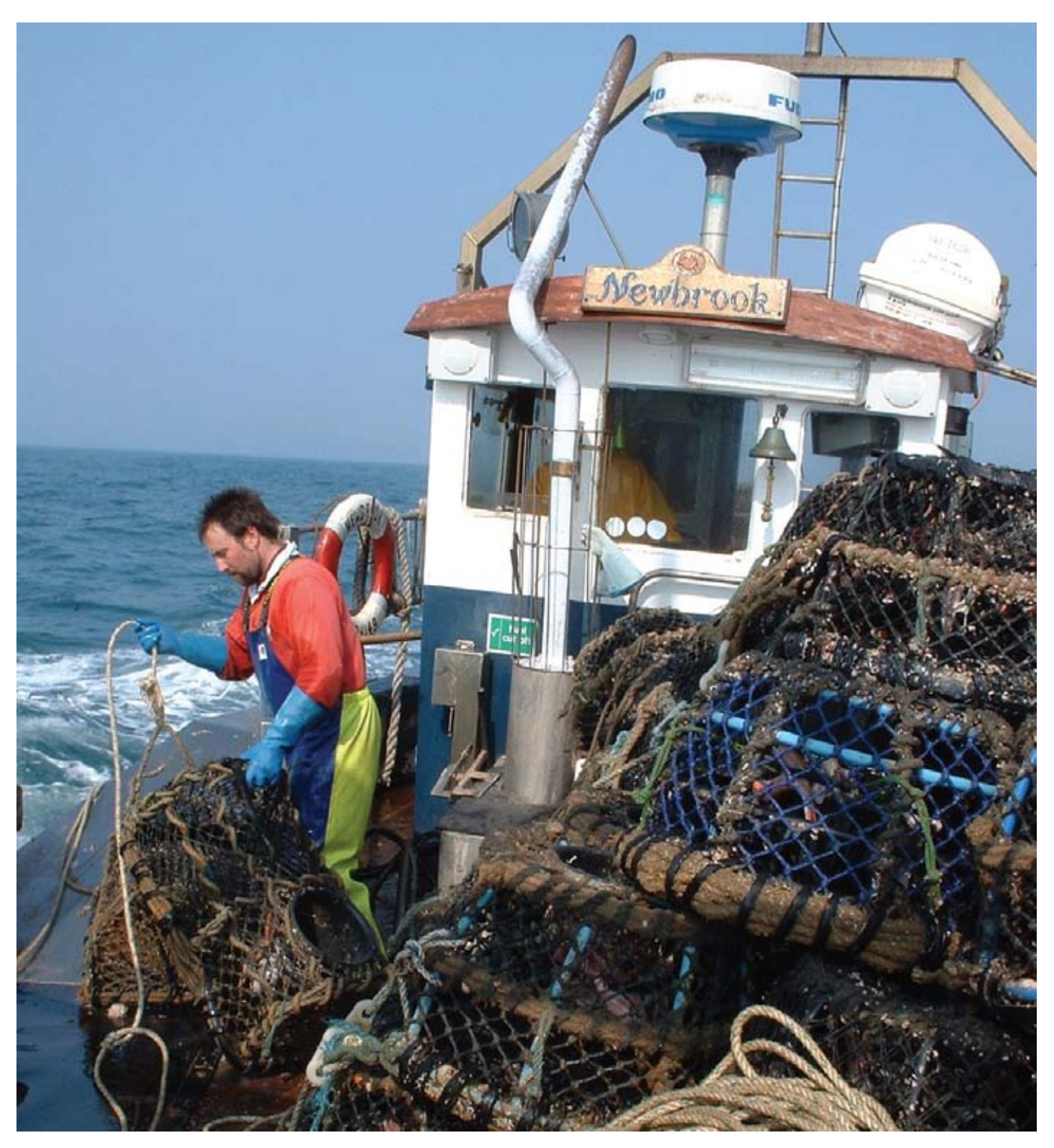
Crab fishermen shooting away a string of inkwell pots

Fishing is another industry that receives significant public support, much of which is still aimed at fleet modernisation and boosting capacity. This is despite 88 per cent of European Community stocks being fished beyond their maximum sustainable yield and 30 per cent being outside of safe biological limits (EC, 2009). The European Commission has recently concluded that the Common Fisheries Policy (CFP) – the framework that