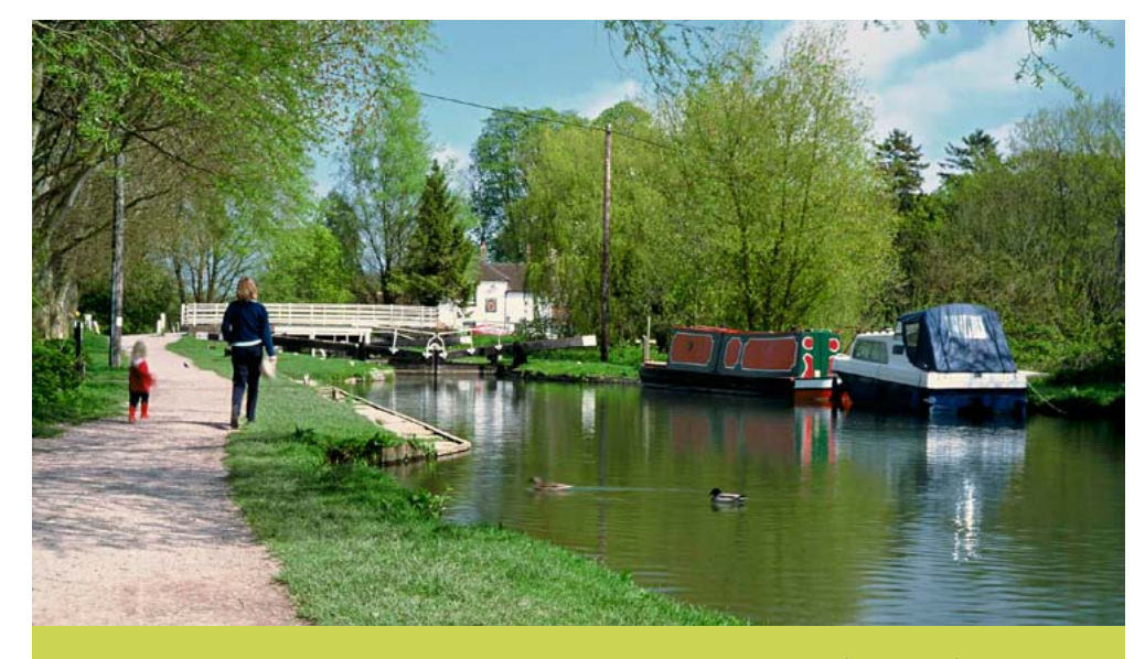
The Kennet and Avon Canal linking Bath to London is a corridor for wildlife, water and recreation.

Rivers draining the dip slope of the Downs flow east into the Thames in the London Basin, via the Thames Valley and Thames Basin Heaths NCAs. Watercourses at the base of the escarpments flow out into the surrounding vales to the north, south and west (into the Thames, Hampshire Avon and Bristol Avon catchments respectively). Groundwater flows out of the NCA largely in an easterly direction into the London Basin but water is also exported to nearby Swindon in the Midvale Ridge NCA. The Kennet and Avon Canal channels water through this NCA between the Avon and Thames rivers and also provides a through-route for transport, wildlife and recreation.