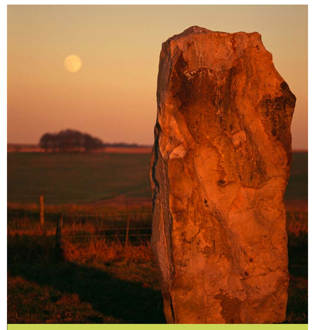
Avebury stone circle and other monuments have attracted visitors for centuries, from antiquarians to artists to pagans.