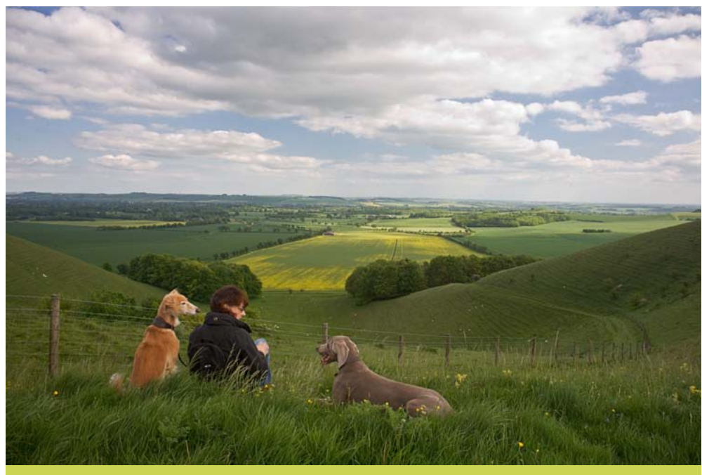
Vale of Pewsey is a low-lying corridor of Upper Greensand with numerous watercourses and densely scattered villages.

A wealth of monuments, cropmarks and historic routeways are visible evidence of a long history of human activity, with some damaged by modern cultivation. There are 442 Scheduled Monuments across the NCA including Neolithic long mounds, bronze-age round barrows and enclosures, hill forts, Saxon earthworks and chalk-cut horse figures. Historic routeways bordered by historic hedgerows remain in use today, with byways and bridleways providing for walkers, cyclists, horse riders and, in some places, motorised vehicles. This includes the Ridgeway National Trail which traverses the top of the higher escarpment, linking key prehistoric monuments such as the White Horse and associated iron-age fort at Uffington.