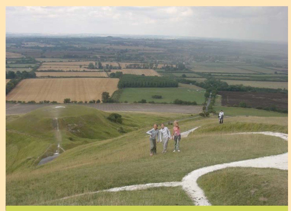
The escarpment provides a backdrop to the adjacent vales. The 'Vale of the White Horse' gets its name from the chalk-cut figure at Uffington.