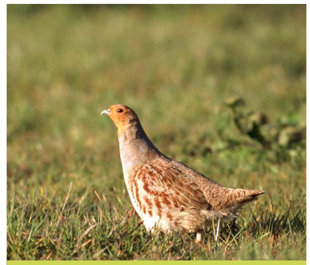
A long continuity of farming has created a landscape providing for farmland wildlife such as grey partridge, Venus'-looking-glass and brown hare.

Biodiversity and geodiversity are crucial in supporting the full range of ecosystem services provided by this landscape. Wildlife and geologically-rich landscapes are also of cultural value and are included in this section of the analysis. This analysis shows the projected impact of Statements of Environmental Opportunity on the value of nominated ecosystem services within this landscape.