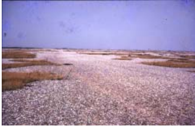
4. Old track from Lydd to Dungeness, across the shingle ridges, much as it is today