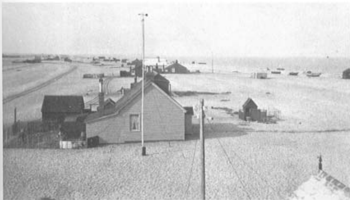
Dungeness in 1932, looking towards the north. The little cottage, Spion Kop, with the cart track at the rear, was the home of Jerry Bates. There were no roads in Dungeness at this period and today the cottages are even further from the receding sea.

1 View over Spion Cop to the north through the village area, 1932; note lack of vegetation