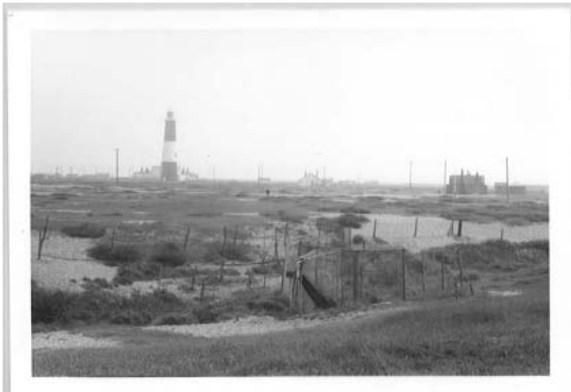
4 The mote Heligoland trap at the Bird Observatory, 1950s; scrub almost non-existent