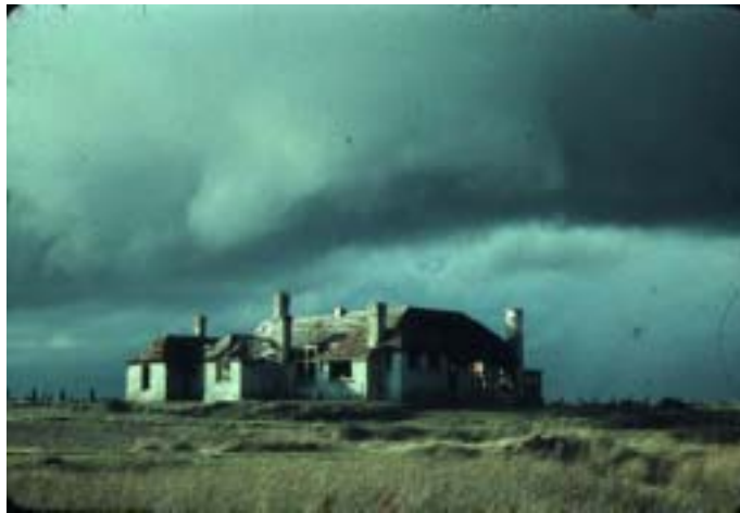
1. View of old school at Dungeness