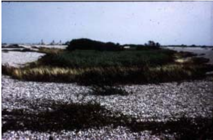
12 One of the fossil pits