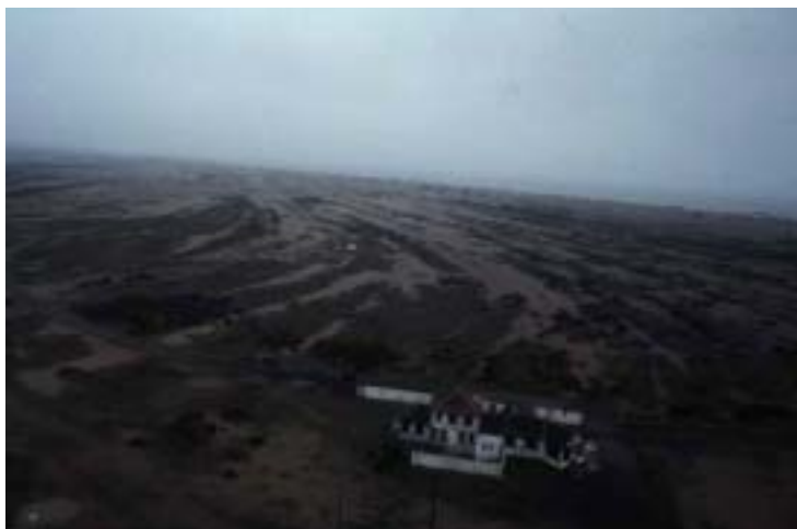
10 View from the old lighthouse over the Coastguard Cottages and Bird Observatory