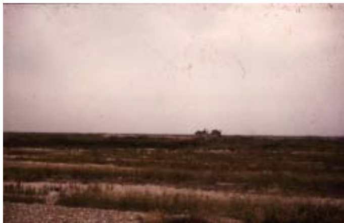
2. Old school in distance across shingle landscape