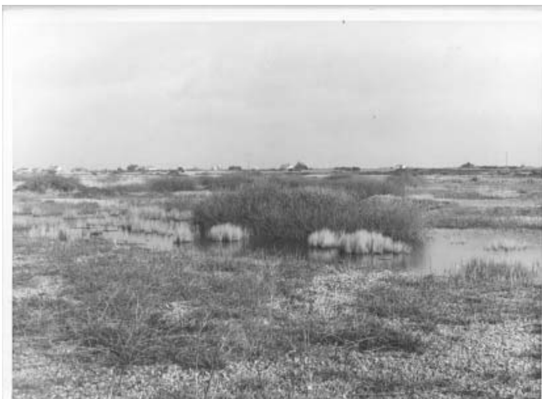
6 The Bird Observatory area, 1950s; note lack of tall scrub