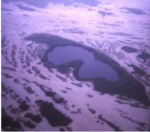
11 Northern Open Pit from the air; extent of open water double today's