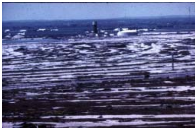
5. View over the shingle ridges from the power station towards the water tower