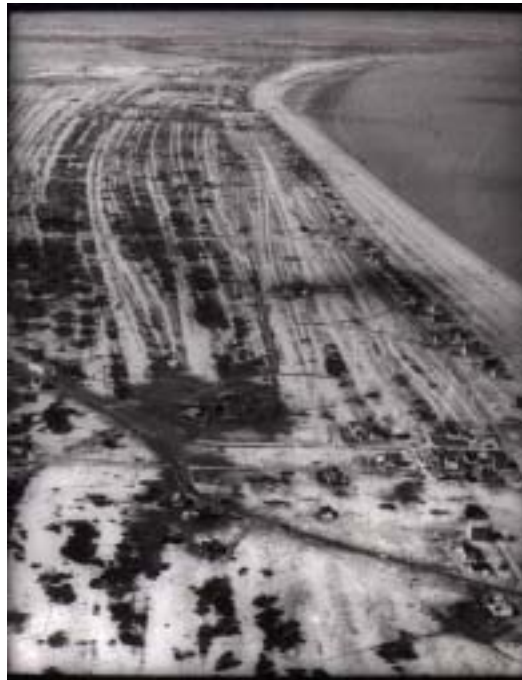
6 Coastal ridges viewed from the old lighthouse