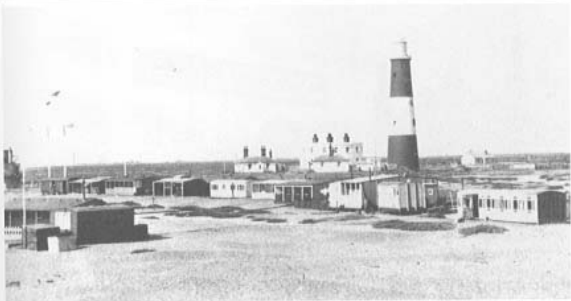
The cabins, c. 1930, in the shadow of the 1904 lighthouse. It is hard to recognize some of the cabins today, as extensions have been added through the years.