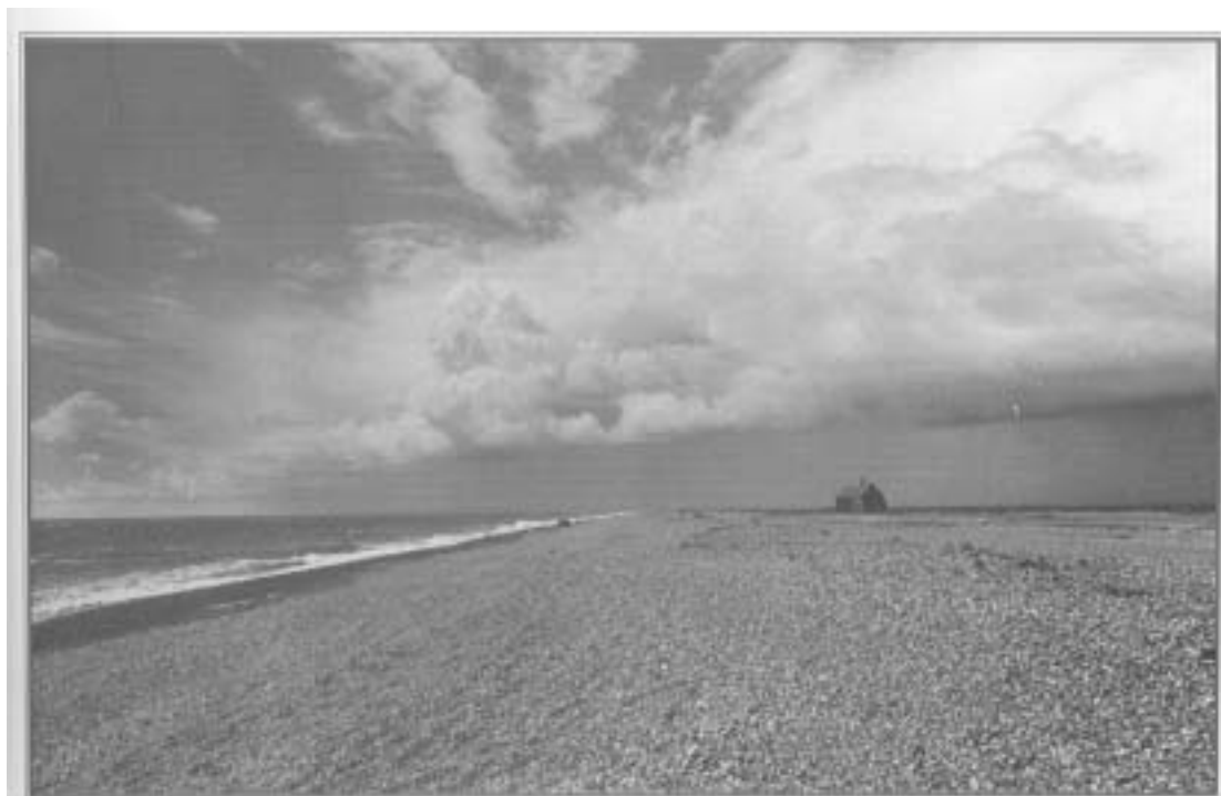
Spindrift Cottage, 1958, once a fisherman's home, standing in isolation between Dungeness and Dengemarsh. It was demolished to make way for a much bigger structure – the nuclear power station.