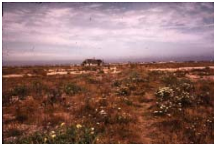
3 Footpath leading to old school from the coastguard cottages