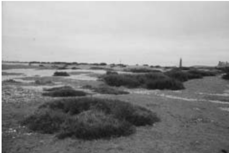
9 View over the Ballast Hole towards the old lighthouse; note lack of tall scrub