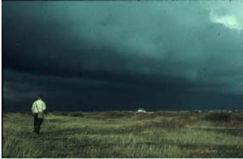
7 View over the Ballast Hole with Harry Cawkell; note lack of scrub