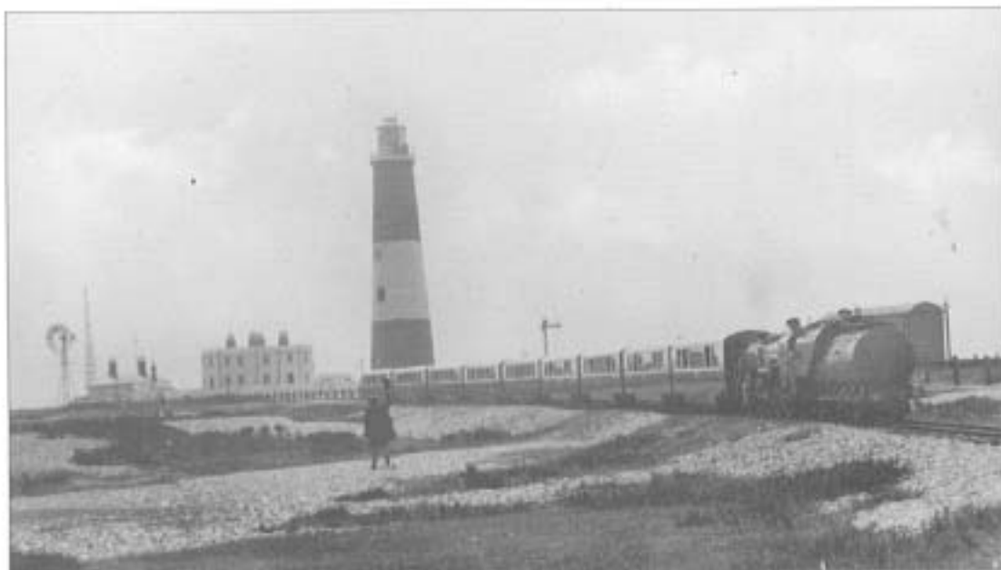
Dwarfed by the lighthouse, a train of the Romney, Hythe and Dymchurch Light Railway leaves Dungeness for New Romney, c. 1935. This miniature railway, the brainchild of Captain J.E.P. Howey, was opened in 1927.