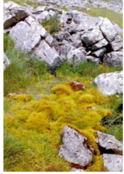
Ha Mire spring fed fen.

The lowering and straightening of watercourses converted the fens to fertile agricultural land. While much of this is now arable, livestock farming meant that some was managed as pasture. Fertility was maintained by allowing sediment-bearing water to seasonally inundate the pasture. These are the coastal and floodplain grazing marshes, which now have an intricate matrix of open water in the ditches, tall fen fringes, and wet grassland.