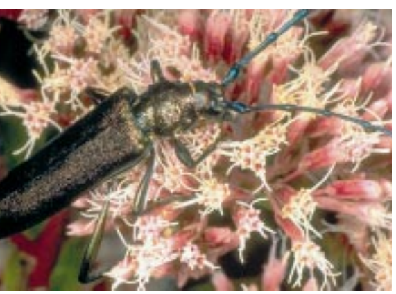
An adult musk beetle, Aromia moschata, feeding on hemp agrimony, Eupatorium cannabinum. The larvae are dead wood feeders on middle-aged osier branches. The adults feed on nectar and pollen.

5.4.2 Grazing marsh, fen and reedbed can all be found adjacent to the coast and estuaries. This means there are opportunities for habitat creation associated with 'managed realignment', in which the line of flood defence is moved landward in response to sea level rise and the deterioration of existing flood defence structures.