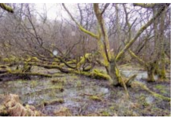
Wet woodland at Solway Moss, Cumbria.

3.6 Before major historic drainage schemes were undertaken, river and coastal plains were covered by fen, much of it being impenetrable fen carr – or wet woodland. Although not under the remit of the Wetland HAP Steering Group, wet woodland is a priority BAP habitat that frequently occurs in mosaic with open habitats such as fen. Other BAP habitats associated with the lowland wetland quartet include purple moor-grass and rush pasture, lowland (wet) heathland, mesotrophic lakes and europhic standing waters, and saltmarsh. The complete mosaic of wetland/associated wetland habitats will be taken into account by the Steering Group when considering applications for support of wetland creation and restoration projects.