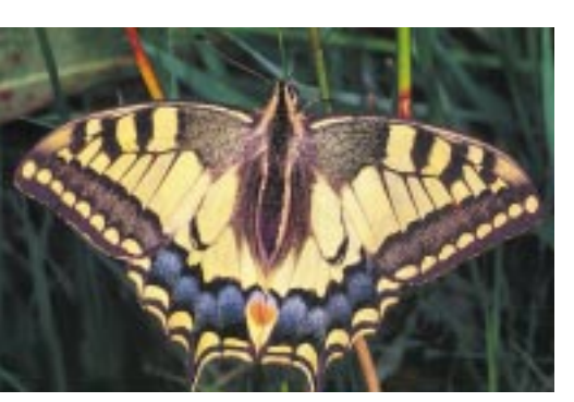
Swallowtail butterfly Papilio machaon is a fen species now restricted to the Norfolk Broads.

5.1.3 There are a number of reasons why statutory processes do not always deliver the desired suite of restoration measures and other sources of funding are, in practice, essential.