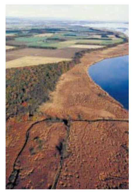
Tay Reedbeds.