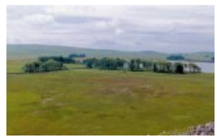
Groundwater-fed fen at Ha Mire, North Yorkshire.

5.2.1 The character of a fen is very much influenced by the chemical composition of its feeding waters, and the way in which this water enters the fen.