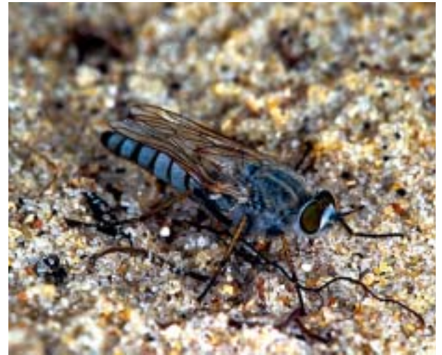
Acrosanthe anulata - a fly with a larva which digs in loose sand. Mike Edwards

Areas of bare ground are often formed of relatively loose soil. This soil is more readily tunnelled than heavily compacted soil, resulting in less wear on the legs or mandibles which are used for digging. Tunnels dug in very loose soils may collapse, however.