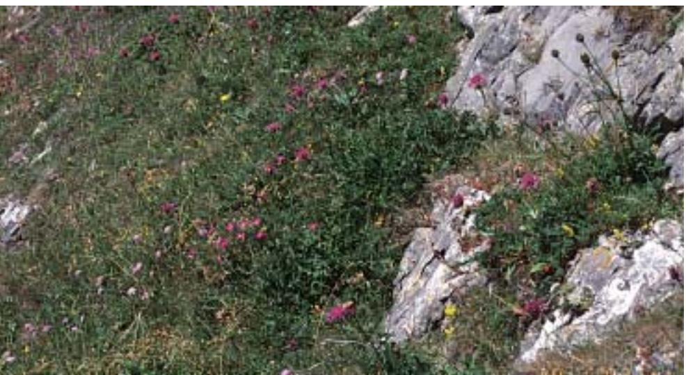
Above: Cliff at Overton. Top: Bare ground in woodland.

These are situations where the processes outlined above are continuing. It is essential to recognise that many areas of bare ground are not destined to remain that way for ever, as plants colonise and spread. This continuing development of a once-bare area to a fully vegetated one is an important process in the maintenance of the various habitats around us. It is equally important that new areas of bare ground are being created at the same time in order to balance the progressive loss of older ones.