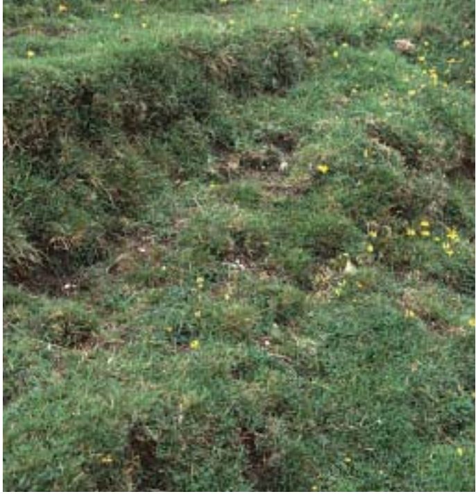
There are grazing animals present at times

Grazing animals may create areas of bare ground along the trails they make around an area, but the more widespread one is through the removal of plant foliage as they graze. This is an important way in which new spaces for plant germination are created.