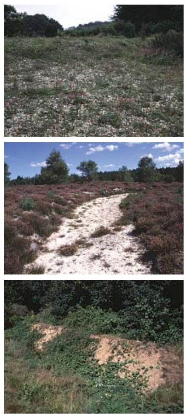
Top: Newly-created area of bare ground on chalk, Noar Hill. Middle: Reptile scrape in heathland, Lavington Common. Bottom: Small gravel bank in field margin, Lower Test.