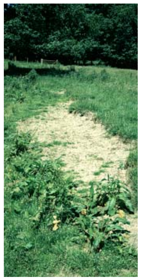
Sand bank alongside the River Wey. Mike Edwards

Periodic flooding may also result in the death of established plant cover, leaving bare ground. As with fire, this is fairly catastrophic and is best when it happens over relatively small areas. Dune-slacks often have this sort of bare ground around their margins and the sand-banks which form along rivers which flash-flood are a similarly-created feature.