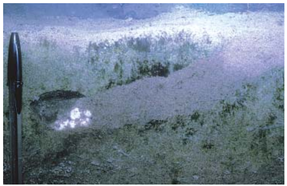
Sand lizard nest.

The soil under bare ground is significantly warmer than that under vegetation. This means that eggs laid, or young living, underground are able to develop more rapidly. This is why sand lizards need patches of bare, sun-drenched sand in order to breed successfully.