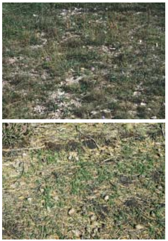
Top: Typical chalk grassland plants re-colonising scraped chalk. Above: Newly-germinating heather.