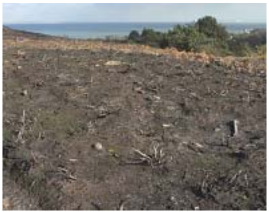
Localised clearance of accumulated litter through fire. Mike Edwards

Fire is extremely good at removing accumulated vegetable litter, as well as plant cover. Heather-dominated heathland regenerates extremely well after occasional, well-spaced, fires. It is, however, also catastrophic, so can be very damaging overall if it occurs on a large scale all at once and at short intervals.