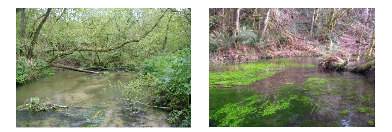
Figure 6.4 Woody debris and macrophyte patches in groundwater dominated chalk streams (a) Bere Stream, Dorset and b) Large Spring River, Oregon.

Tree lined riparian corridors in natural chalk streams and lowland rivers typically have patches created by tree fall or where locally waterlogged conditions preclude tree growth. These create gaps where light can penetrate the channel (See Figure 6.4). Thus the vision for the riparian corridor under natural conditions is one where excessive macrophyte growth is suppressed, and instead occurs in patches where sufficient light is available. Management of dense wooded sections is envisaged in order to provide a patchwork of light and shade. Active rehabilitation is envisaged to recreate natural channel dimensions prior to riparian woodland development. Thus an important management phase will be during the transition from open, light-dominated channels to shaded, patchy light under a wooded riparian margin.