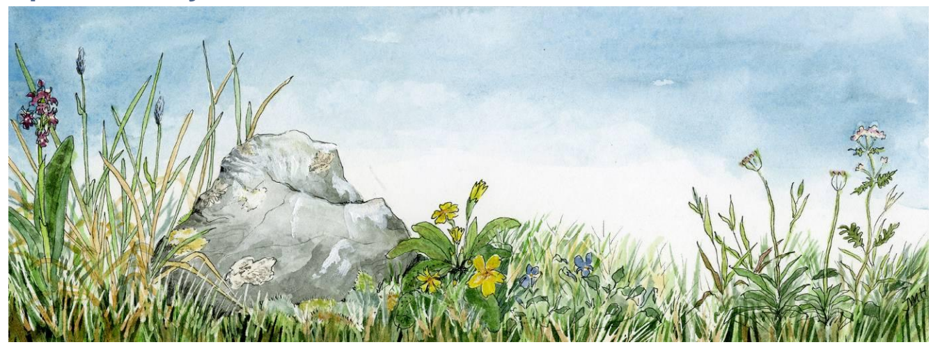
Indicator species for April and May can include common dog-violet, primrose and early purple orchid

By May limestone grassland should be showing signs of greening and the steely blue heads of blue moor-grass may be emerging. The first flowers are likely to be common dog-violet, primrose and early purple orchid.