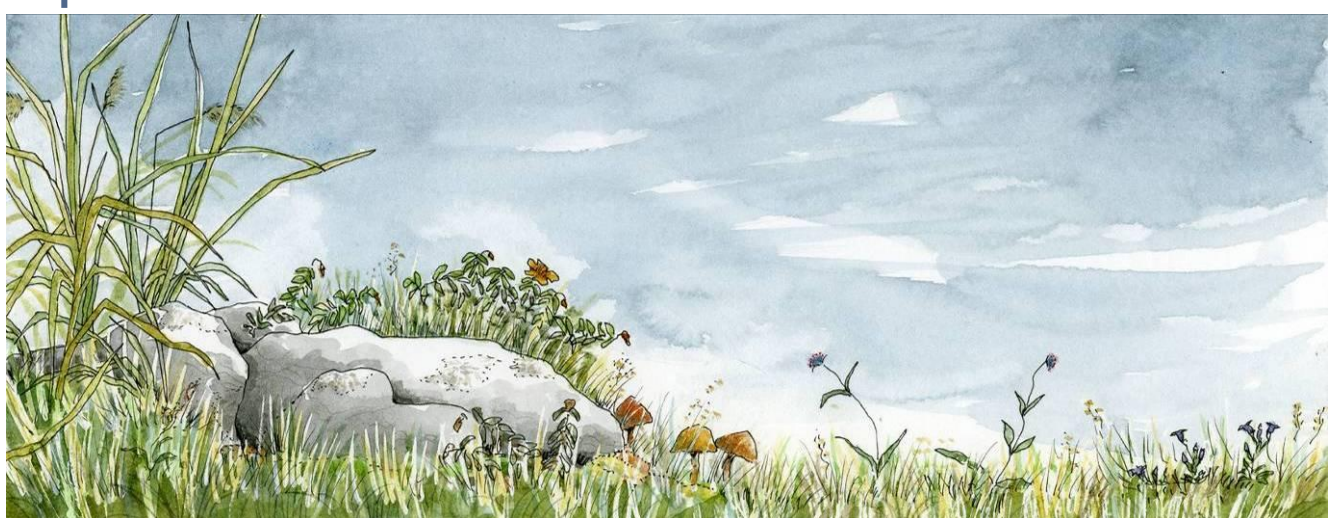
Indicator species in September and October

By late summer, most plants should have set seed, although a few late flowering species such as devil's-bit scabious and autumnal gentian may still be in bloom. Annuals such as eyebrights die after seeding and grass leaf blades yellow and die back as winter approaches.