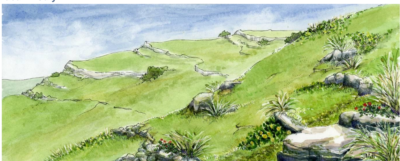
Ideal sward structure in July

Unless managing for a particular species with different requirements, aim for: