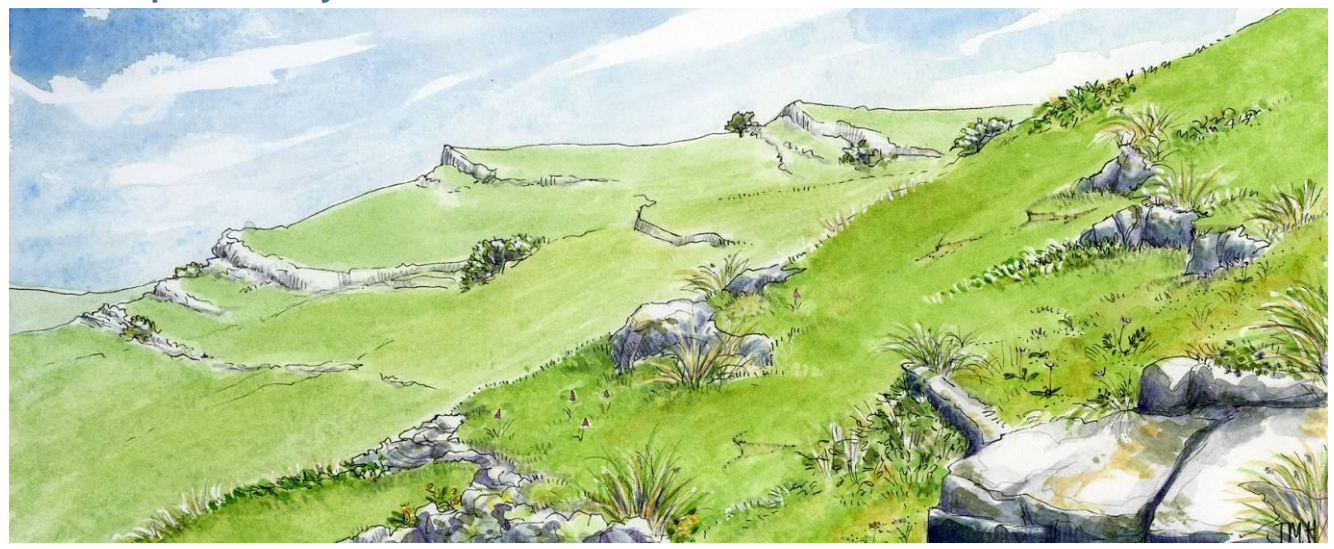
Ideal sward condition in the spring

Unless managing for a particular species with different requirements, aim for: