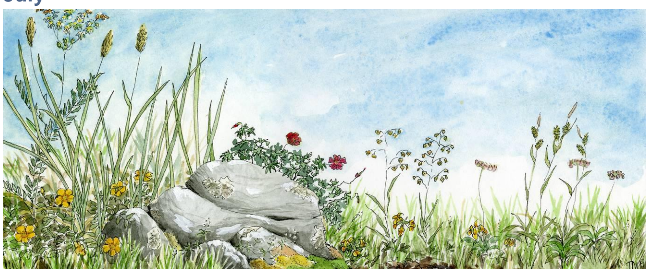
Indicator species include bird's eye primrose, common rock rose and blue moorgrass

Plants can flower and set seed where swards are lightly grazed or where stock are removed for a few weeks. Sheep like to eat flower heads so if you are grazing at this time it is better to graze with cattle.