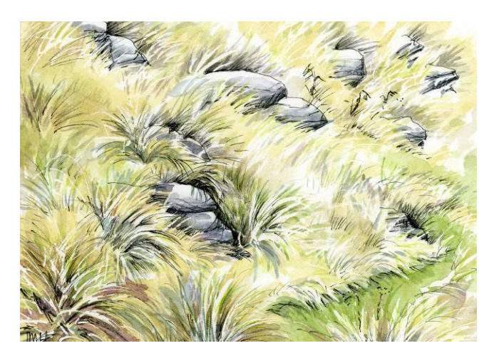
A rank sward over the majority of the field

Flowers and flower heads will be eaten off if the grass is over-grazed and too much bare ground will encourage thistles, ragwort and other undesirable species.