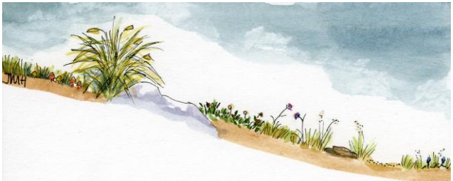
Cross section of ideal sward in autumn

Graze with cattle or sheep to remove surplus grass and limit the build-up of litter. Cattle are better than sheep because they are less selective grazers.