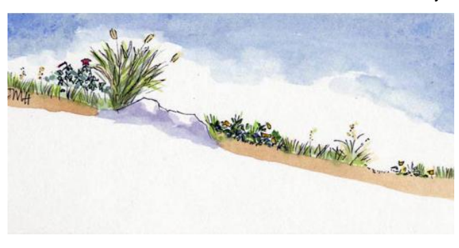
Ideal sward cross section