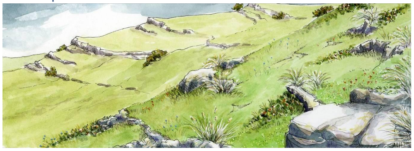
Ideal condition of the sward in the autumn