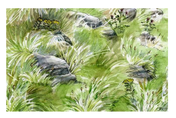
Under-grazing the sward

Grazing the sward too short with too much bare ground will encourage ragwort, thistles, nettles and other undesirable species. Any flowers will be eaten and the sward will be too uniform and shrubs and tree sapling will be grazed out.