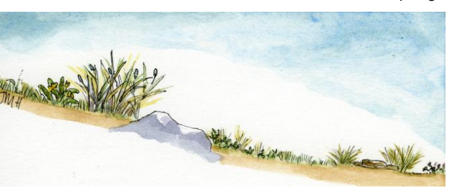
Cross section of ideal conditions

Scattered bare soil on less than 5% of the area.