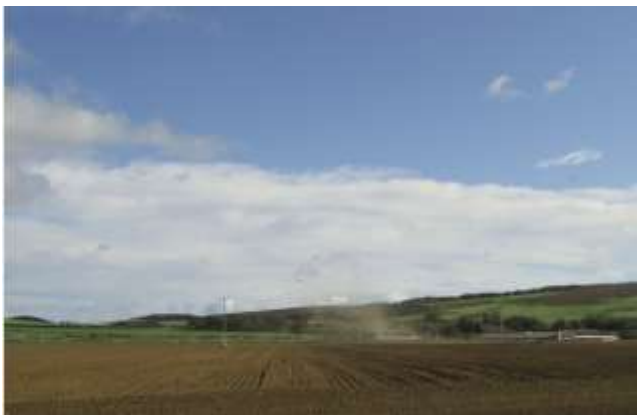
Wind erosion on light soil

As a result of this risk assessment a range of potential actions were identified to improve the resilience of North Doddington Farm to climate change. These include: