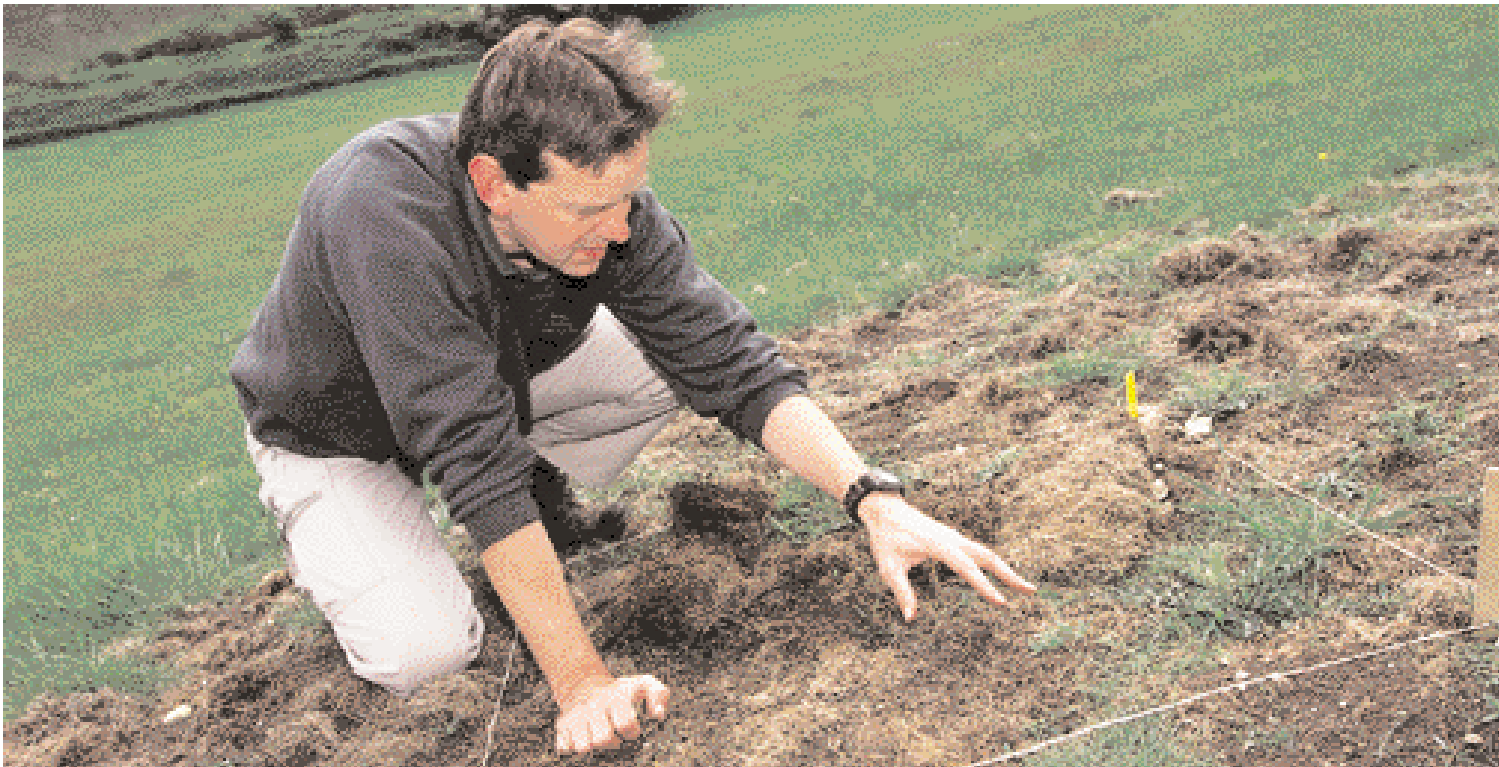
Searching a quadrat for plants at Butser Hill NNR