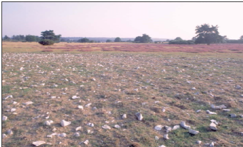
Photo 6. Breckland heath and acid grassland vegetation, Thetford Heath