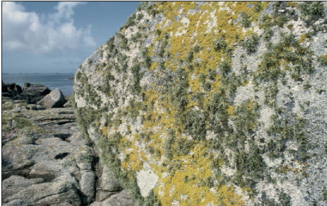
Photo 1. Lichens growing on a granite boulder, Isles of Scilly

however, is whether these distinctive communities reflect the chemistry of the rocks of some other property such as small-scale weathering patterns.