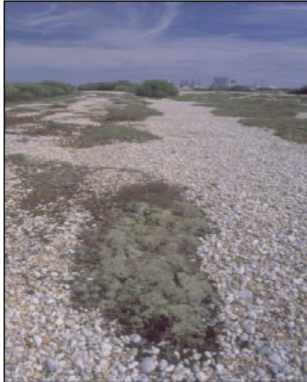
Photo 12. Lichen heath vegetation on shingle ridges, Dungeness.

Crambe maritima and sea pea Lathyrus japonicus , all species that can tolerate periodic movement, is significant. In more stable areas above this zone, where sea-spray is blown over the shingle, plant communities with a high frequency of salt-tolerant species such as thrift Armeria maritima and sea campion Silene uniflora occur. These may exist in a matrix with abundant lichens.