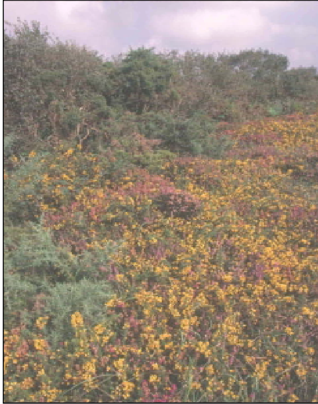
Photo 7. Heathland vegetation with gorse and heather. The Lizard, Cornwall.