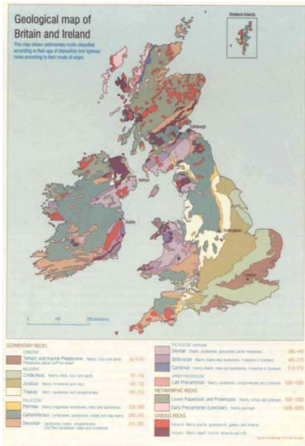
Figure 1 Geological map of the British Isles.

The role of geology in the development of the characteristic landscapes of England and the presence and distribution of wildlife, particularly vegetation, has been a topic of debate and discussion amongst natural historians and ecologists for hundreds of years.