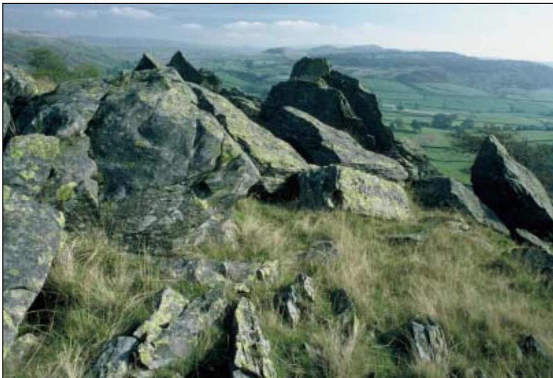
Photo 5. An outcrop of Silurian slates in North Yorkshire, supporting acidic grassland in contrast to the surrounding vegetation of the Carboniferous Limestone.

In Cumbria, heathland vegetation predominates on areas of outcrop of the acidic Borrowdale Volcanic Series and Skiddaw Slates, again reflecting the generally nutrient poor and thin nature of the soils. This vegetation is very extensive in a number of areas, notably the Buttermere Fells, Skiddaw Group, Amroth Fells and to a lesser extent Pillar and Ennerdale Fells. The principal vegetation community present comprises heather-bilberry heath, however at higher altitudes the subalpine NVC H18 community with wavy hair grass is present. Associated species include cowberry V. vitis-idaea , and locally bearberry Arctostaphylos uva-ursi and crowberry Empetrum nigrum .