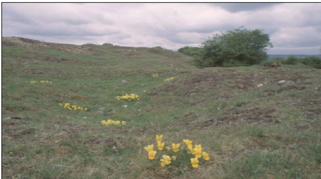
Photo 8. Viola calaminaria , a metallophytic species typical of old lead mining areas, Gang mine, Swaledale

In the Moor House-Upper Teesdale area of Cumbria and Durham, calaminarian grassland occurs on lead-mine spoil associated with the Carboniferous limestone at high altitude in the Pennines of northern England. Much of the spoil is unvegetated and has a variety of particle sizes ranging from coarse rubble to fine sediment, and several steep, unstable slopes. Metallophytic plants such as spring sandwort, alpine penny-cress and Pyrenean scurvygrass Cochlearia pyrenaica occur along with lichens such as Cladonia rangiformis , C. chlorophaea and Coelocaulon aculeatum .