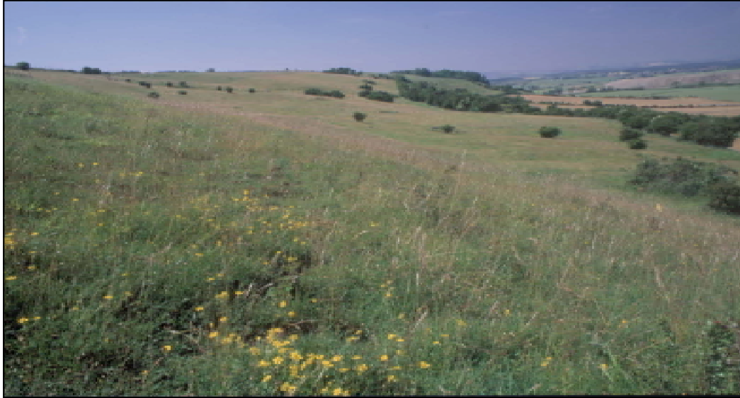
Photo 4. Magnesian Limestone grassland and scenery, Cassop Vale, Durham

The Magnesian Limestone provides habitat for a number of calcicole species at their farthest north on the east side of England. Travellers' joy is thought to be native on the Magnesian Limestone in south-west Yorkshire, while Nottingham catchfly Silene nutans reaches as far north as Knaresborough. The occurrence of species typical of the southern Chalk gradually decreases northwards along the outcrop of the Magnesian Limestone so that species such as stemless thistle Cirsium acaulon and dark mullein Verbascum nigrum just peter out. However, sufficient of the characteristic plants of places like the South Downs make it far enough north to make the Magnesian Limestone of interest to botanists.