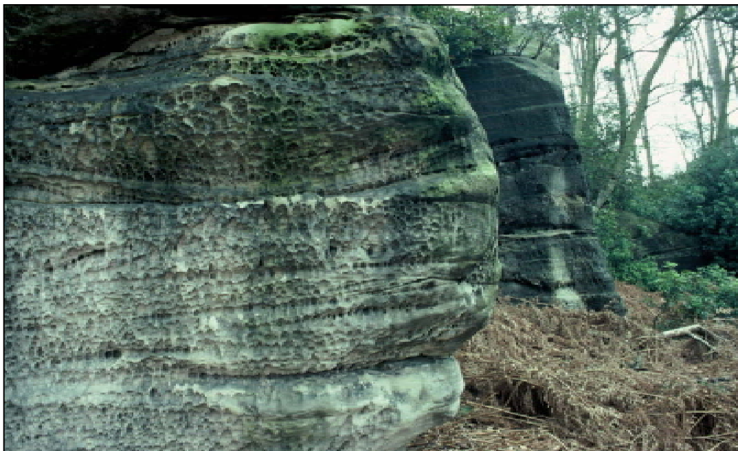
Photo 9. Low cliffs formed in the Ardingly Sandstone (Wealden), Wakehurst, West Sussex

Although rock chemistry may not be a predominant factor in controlling the distribution and presence of plant species it is apparent that one aspect of cliff geology and geomorphology that is important to ecological communities is the degree to which cracks, crevices and ledges are present and their spatial scale. As a general rule cliffs formed of unconsolidated materials provide few-large scale heterogeneities compared with cliffs formed of solid rock, due largely to their relatively rapid erosion (Larson et. al. (2000)). Cliffs composed of igneous rocks, such as basalt and andesite, tend to provide more habitat (ie niches) than softer sedimentary rocks. The number, size and spacing of crevices, ledges and fractures etc. can strongly influence the density and diversity of flora of cliffs. Coates and Kirkpatrick (1992) document that on sandstone cliffs in Tasmania, colonies of higher plants are found concentrated along joint crevices while sheer faces are covered only by mosses and lichens. Such distribution patterns can be observed on any cliff sections, although scant attention is usually paid to the factors that may be influencing distribution at this scale.