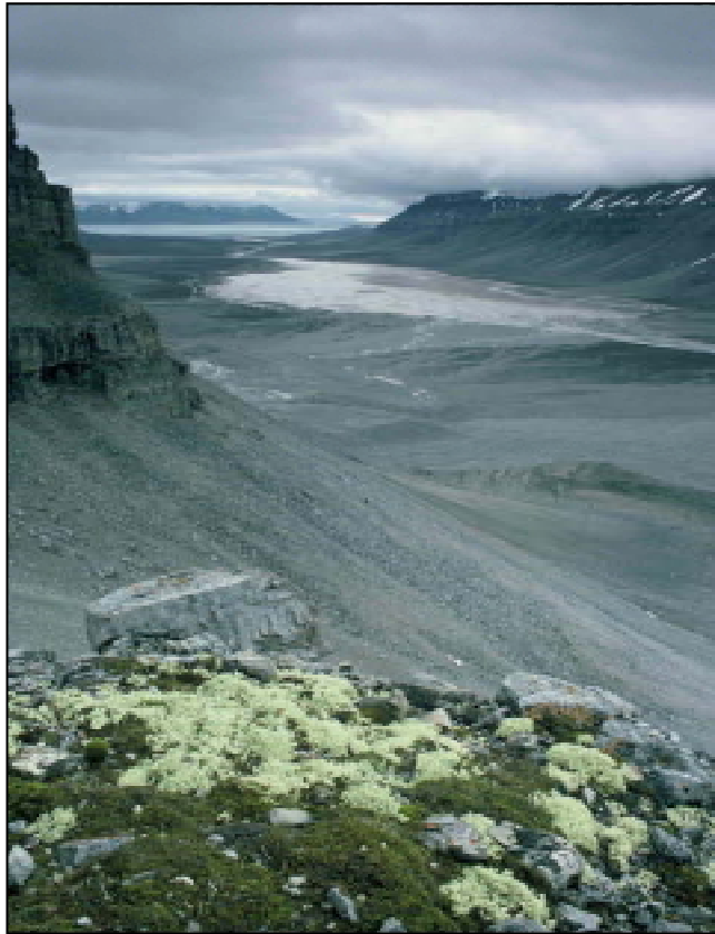
Photo 2. Glaciated landscape, Svalbard. Parts of Northern Britain may have once looked like this following the retreat of the last ice sheet.