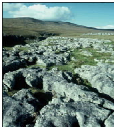
Photo 10. Limestone pavement, Ingleborough, North Yorkshire.

One interesting example of the influence of slope processes comes from the high plateaus of the Scottish Highlands. Here, open and unstable substrates can lead to an enrichment of the flora, particularly on solifluction terracing. Alternate freezing and thawing of soil water on slopes at high altitude forms the terracing. Many plants benefit from the instability, which stirs up the soils, releases nutrients and counteracts the effects of leaching. A special feature in the UK is that strong winds at high altitude can keep the more exposed risers of the stair-like terraces open, resulting in distinctive bands of vegetation. Norwegian mugwort Artemisia norvegica , which is known from only two mountains in the north-west Highlands, is present in open moss-heath on solifluction terracing and on open basal rock surfaces.