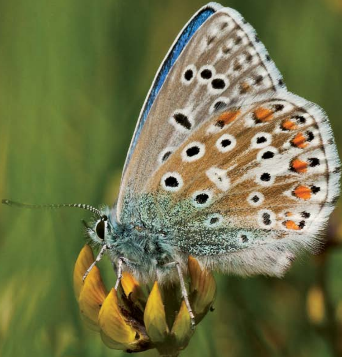
Adonis Blue male