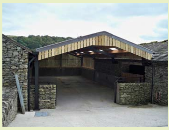
Roofed livestock gathering area

The Catchment Sensitive Farming Officer will also be working with Town End Farm to produce a nutrient management plan. This will assess the nutrient levels of the land, nutrients available on the farm from manures and help target fertiliser applications and ensure that applications meet the requirements of the grass. The result will minimise excess application of nutrients thereby reducing the likelihood of nutrient run off.