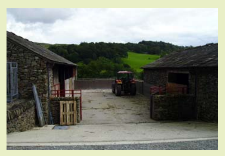
Livestock gathering area

The land is predominantly pasture, with some land on the fells and is stocked with a combination of beef and sheep. The Freeman's keep pedigree Limousin cattle, which are housed over winter. The buildings on the farm are typical of a Lakeland hill farm and are protected so any developments are tightly monitored to ensure that the character of the valley is maintained.