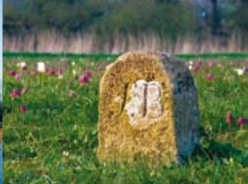
Left to right: Hay making, the meadow in flood, North Meadow stone.