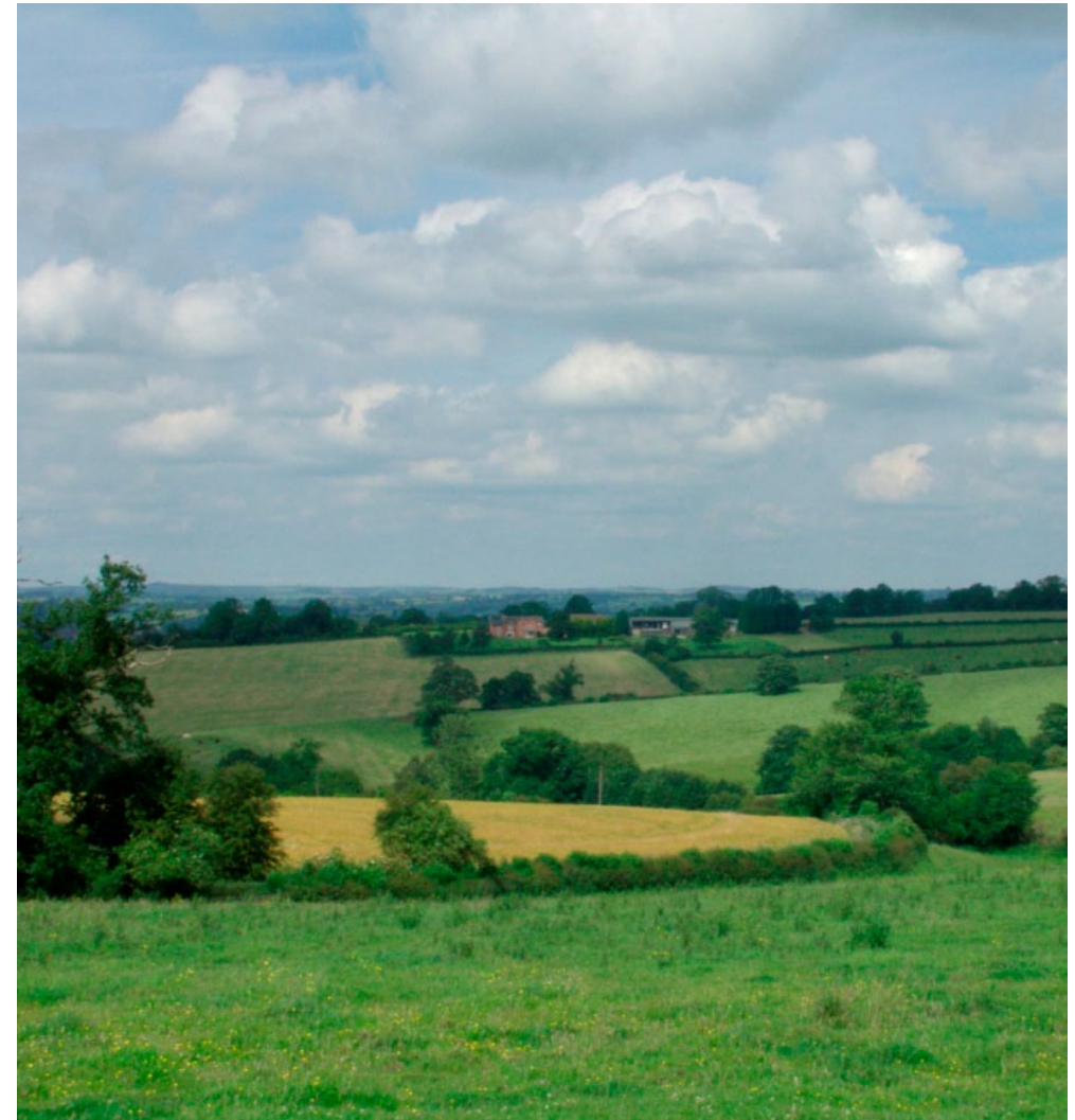
The area features a well maintained network of hedgerows