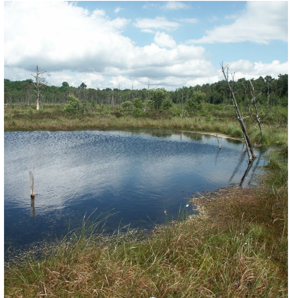
The peat forming the rare basin mire habitat at Chartley Moss SAC also acts as a carbon store.