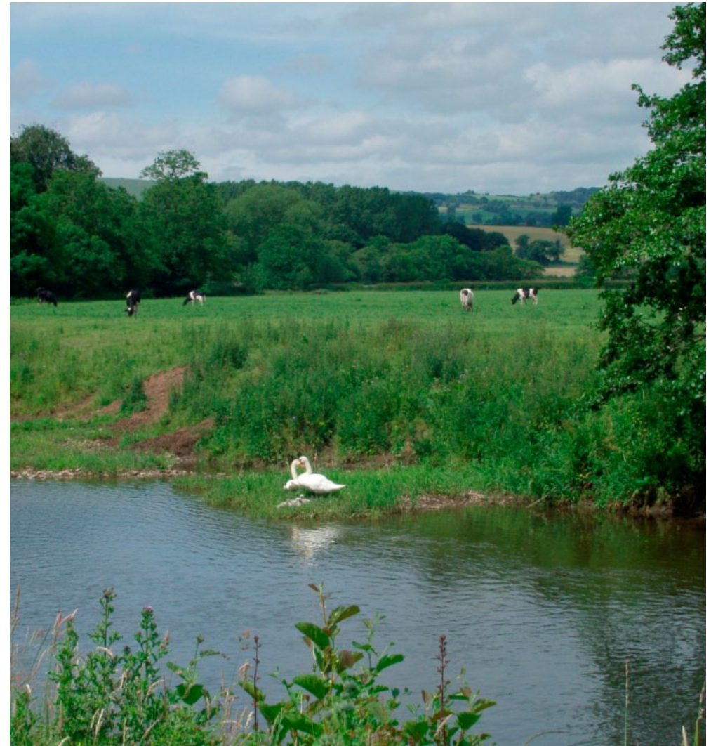
The river valley of the Dove includes areas of ridge and furrow and in places traditional water meadows

There is moderate recreational access within the NCA, with part of The National Forest featuring in the east and the Staffordshire Way crossing between Uttoxeter and Rugeley. The Trent and Dove valleys are major transport corridors and many people experience the area while travelling along these routes. Despite urban and road expansion north-west of the Dove, the countryside remains essentially tranquil and rural.