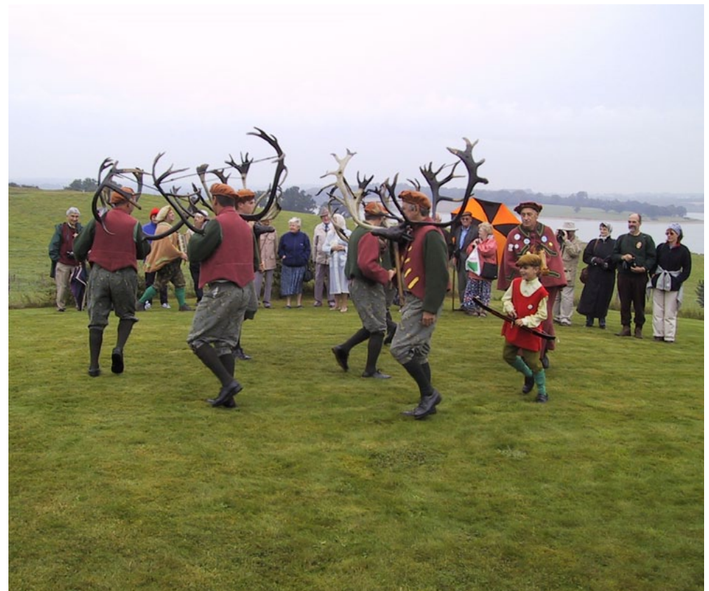
Blithfield Reservoir, seen in the background, provides regional supply of drinking water and is popular for a wide range of recreational uses.