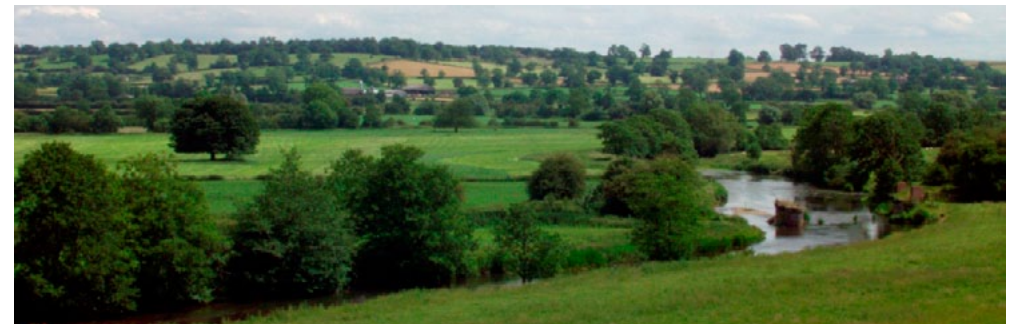
The floodplain of the Dove allows space for the river to overflow when in flood

The Staffordshire Way passes through the area, crossing into it just north of Uttoxeter and then running down to Rugeley and onwards south. In the south-east of the NCA is a portion amounting to a seventh of The National Forest, connecting the area to Burton-upon-Trent and Ashby-de-la-Zouch beyond.