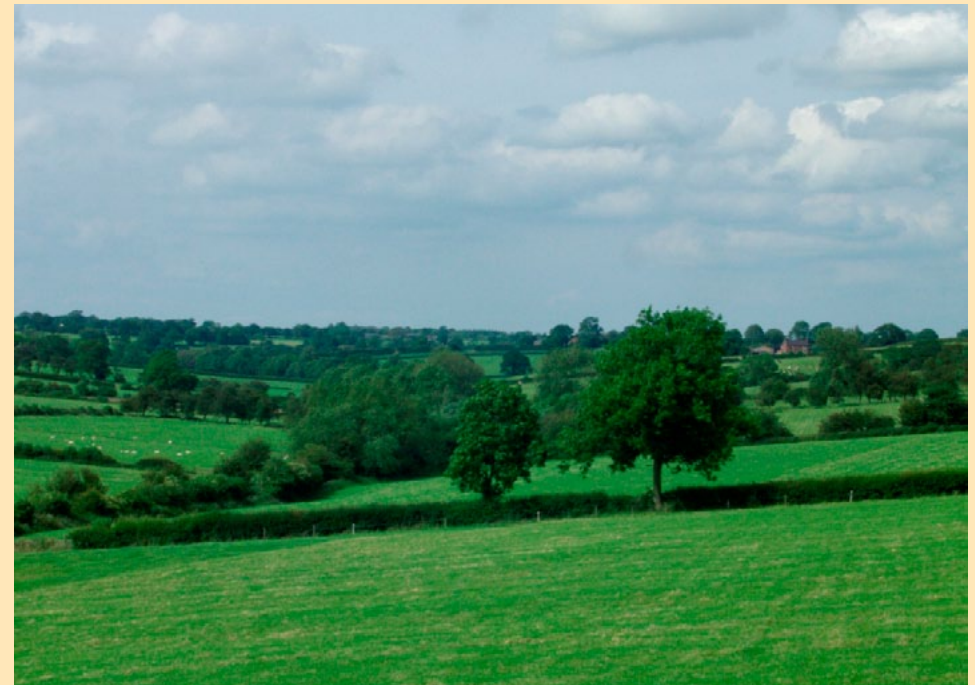
Hedgerow trees in the wooded estatelands add to the sense of wooded enclosure in the surrounding farmland