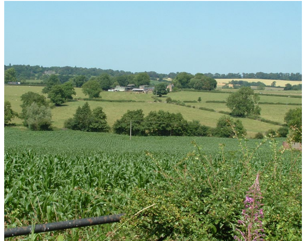
Farmland is predominately managed as grassland for livestock though arable use also features.