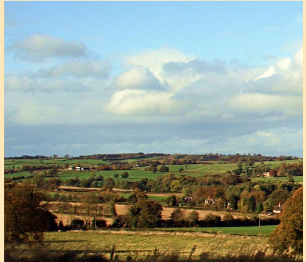
Mainly rural the NCA features a dispersed pattern of settlements giving it a sense of tranquillity.