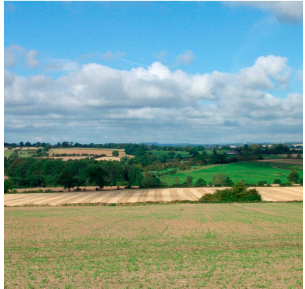
View across typical estate farmland near Mecaston