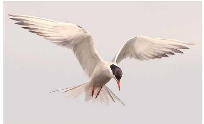
Common tern.

In light of this work, areas of sea adjacent to the Outer Thames Estuary SPA, including areas of the marine environment to the west of this designation, are now being considered as for extension to the existing SPA.