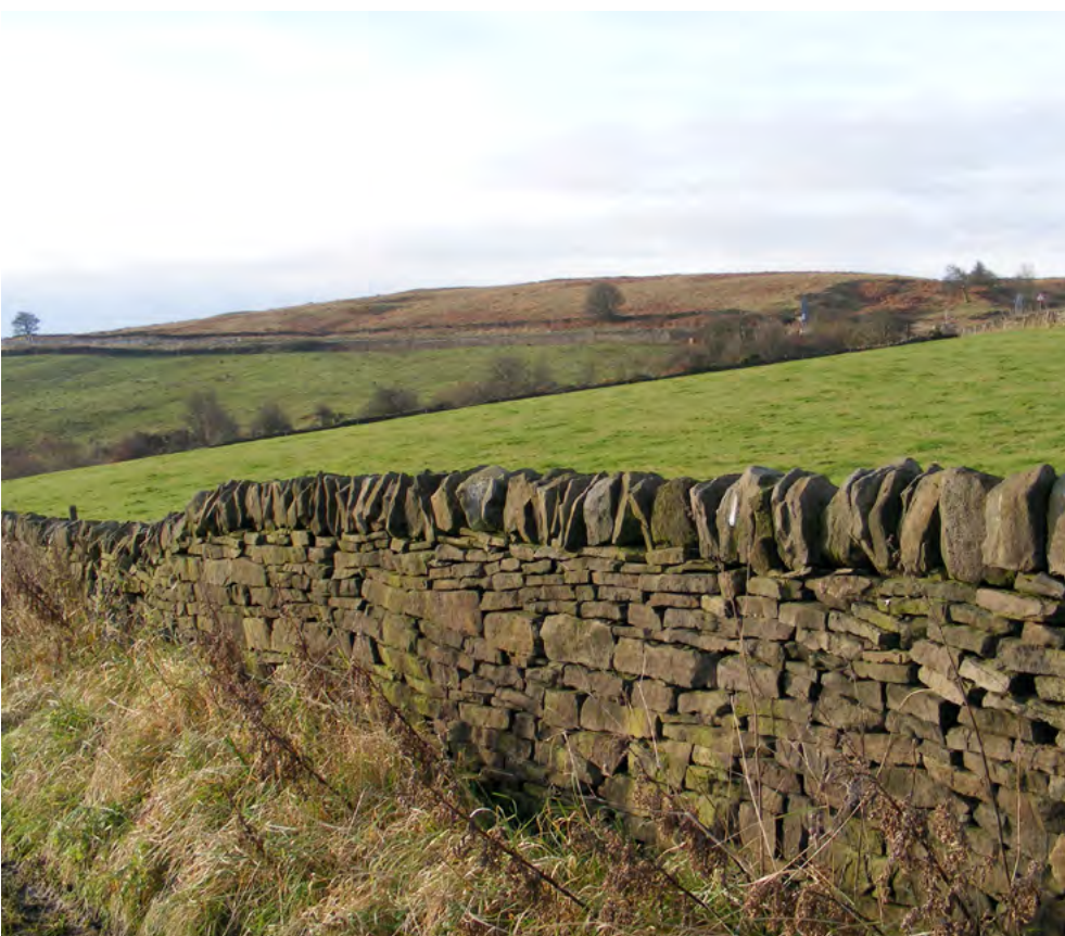
Dry stone walls.