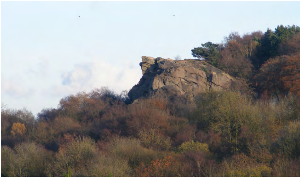
Black Rock – a very popular climbing location.

Although the Derbyshire Peak Fringe and Lower Derwent NCA lack the 'honeypot factor' of the Peak District National Park, the landscape is of a high quality. The World Heritage Site, particularly at Cromford, is a major draw, and Crich Tramway Village is internationally famous. For the adventurous, there are many popular climbing faces, and the rivers provide opportunities for canoeing and kayaking; the Milford to Darley Abbey stretch of the Derwent, for instance, is classed as an easy touring section 6 . For walkers, the Derwent Valley Heritage Way stretches from Ladybower Reservoir, in the Peak District National Park, to Derwent Mouth, at the junction with the Trent. Carsington Water and Cromford Canal are key recreational assets, presenting a range of water- and walking-based opportunities; in addition, the former is also a key source of potable water for communities outside the area.