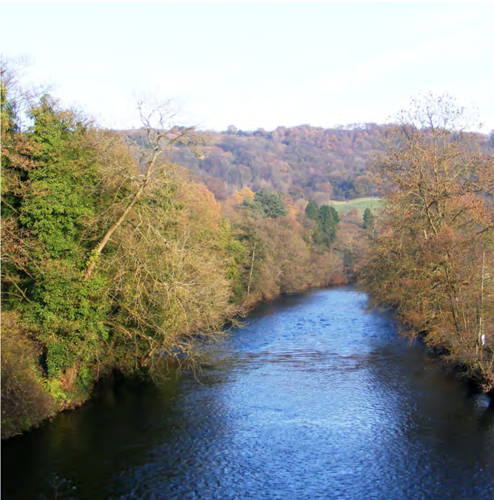
The River Derwent links this NCA to those both upstream and downstream.