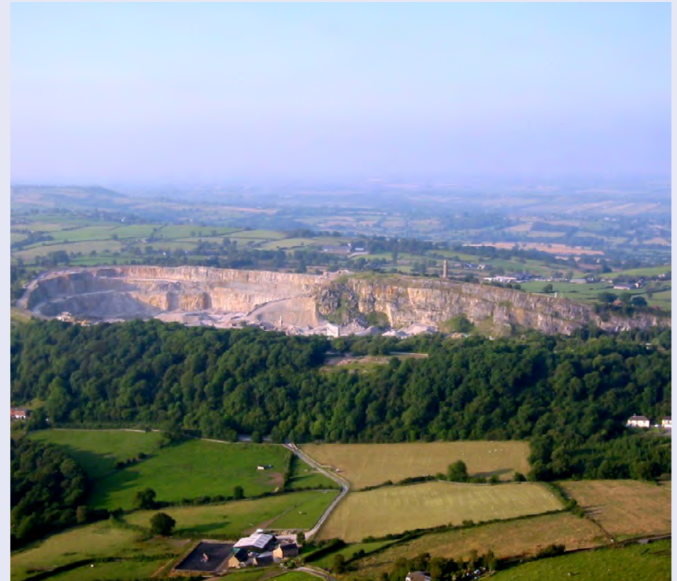
View towards Crich Stand and quarry.