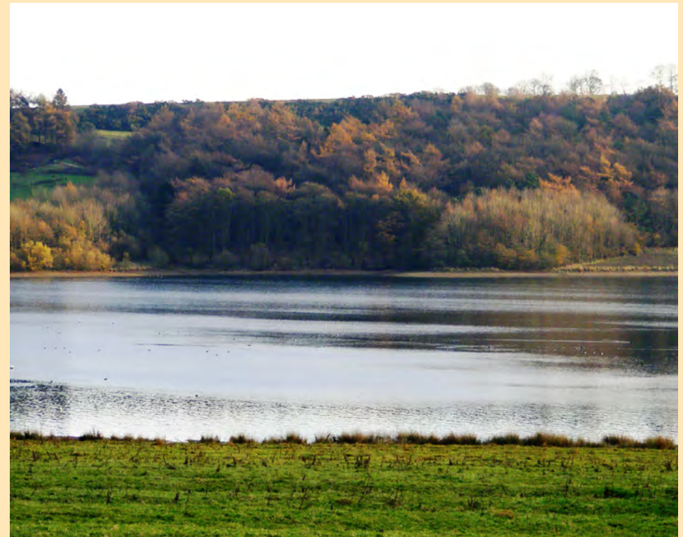
Carsington Water was created to supply water to the Derwent in times of low flow.