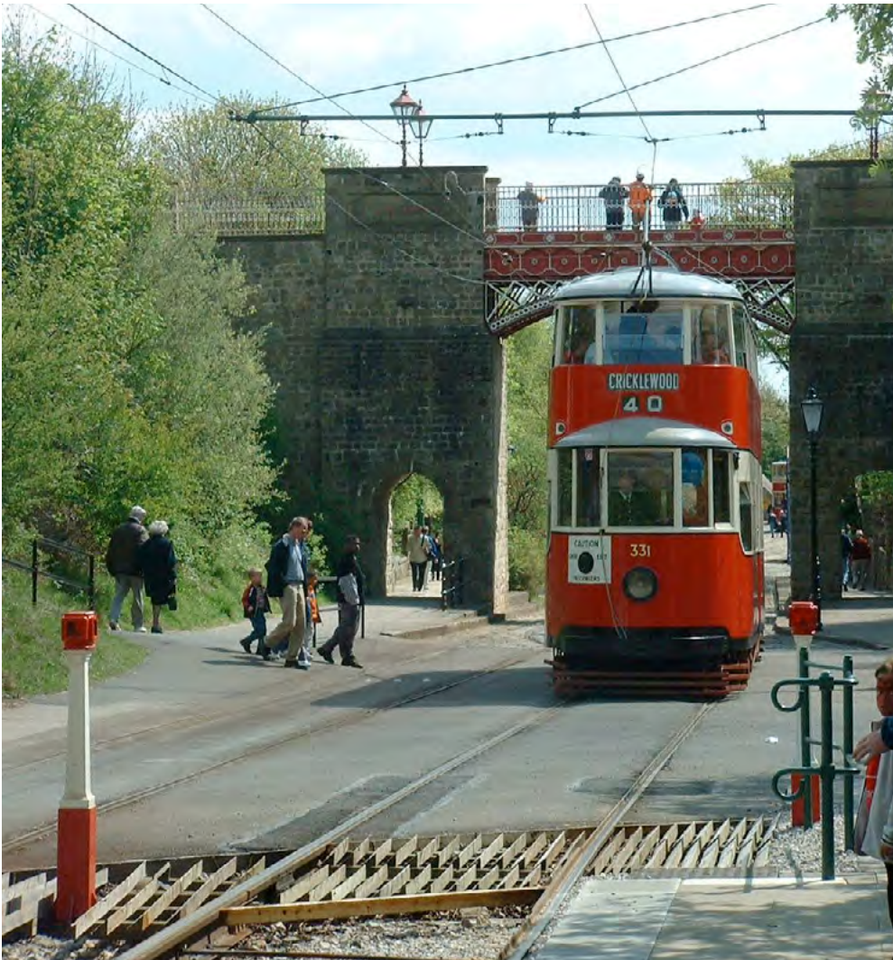
Crich Tramway Village, a popular tourist destination in the NCA.