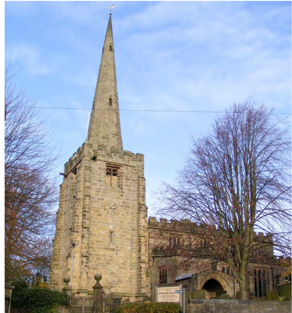
Ashover Church – built from local stone.