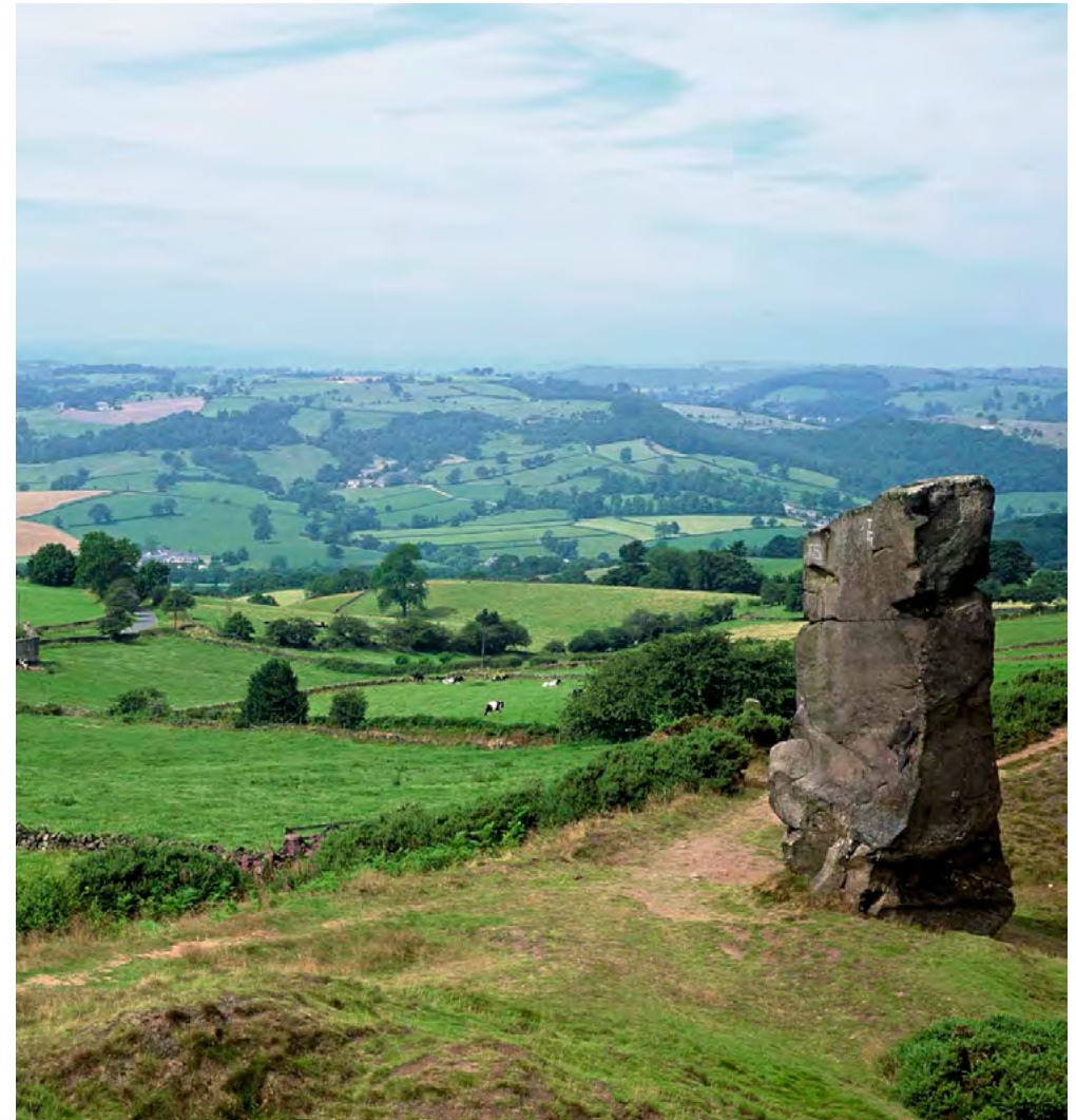
A view towards Ecclesbourne Valley from Alport Heights, showing a landscape of small mixed fields enclosed by stone walls, and the area's characteristic woodlands.