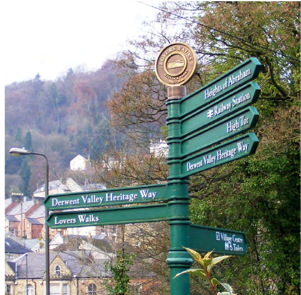
The Derwent Valley Heritage Way is a major recreational resource.