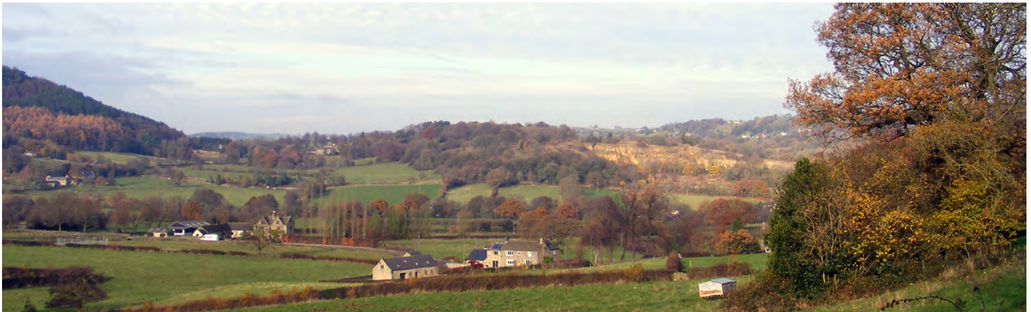
The landscape just outside Ashover.

Biodiversity and geodiversity are crucial in supporting the full range of ecosystem services provided by this landscape. Wildlife and geologically-rich landscapes are also of cultural value and are included in this section of the analysis. This analysis shows the projected impact of Statements of Environmental Opportunity on the value of nominated ecosystem services within this landscape.