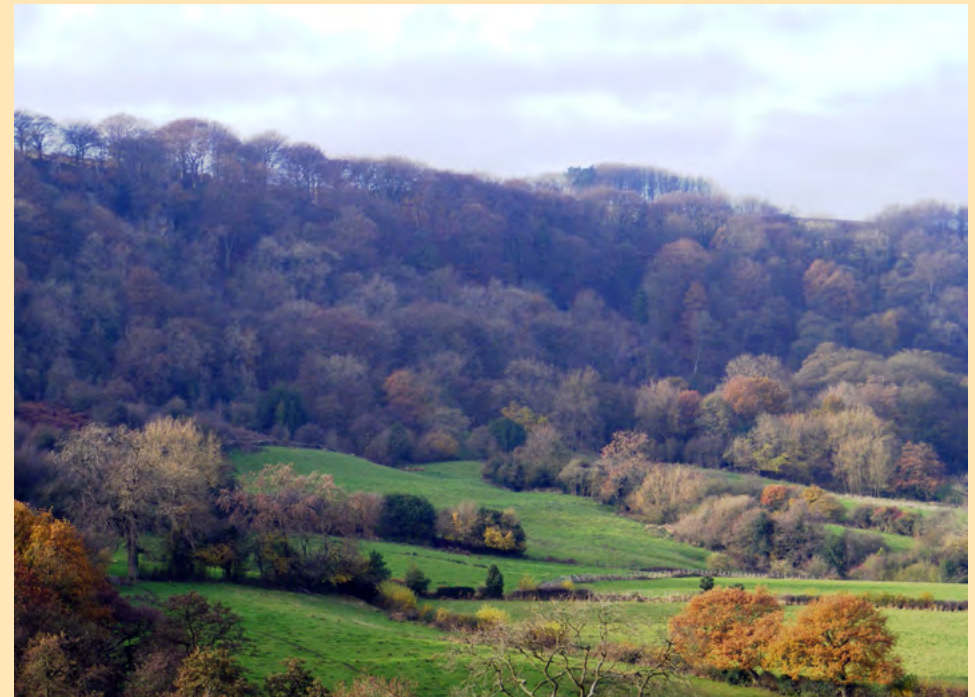
Broad-leaved woodland – an essential quality of this NCA.