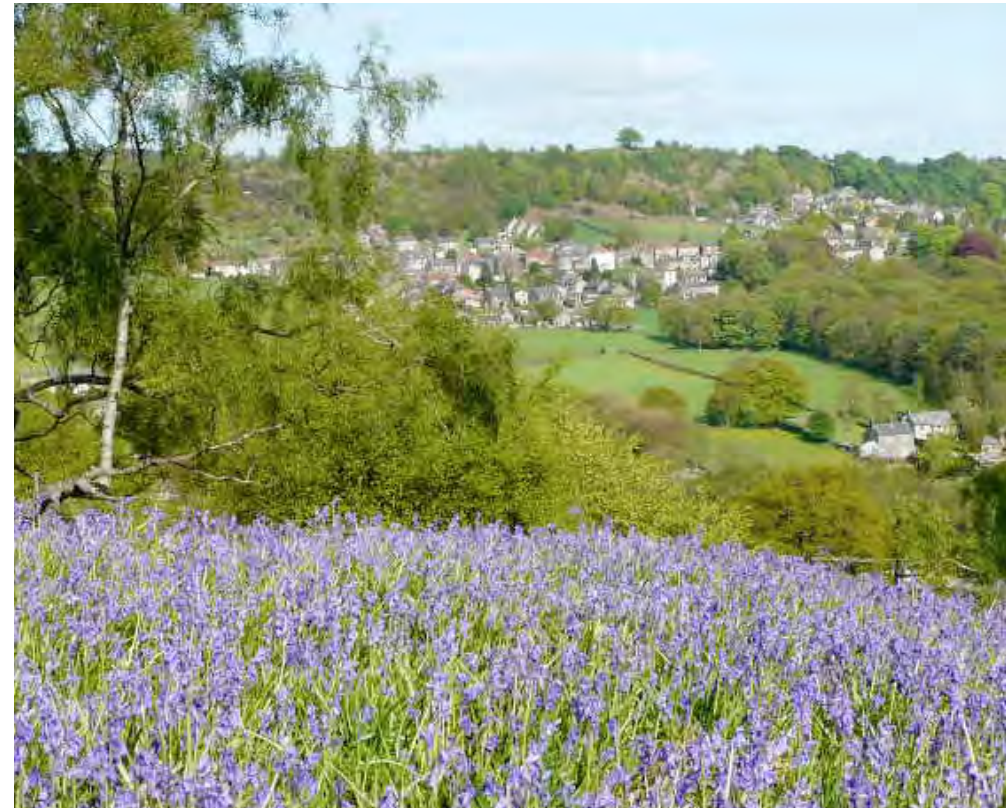
Bluebell woods are a key feature here.

The name 'Derwent' derives from a Brythonic (ancient Celtic) word – derventio – which means 'a valley thick with oaks'. Unsurprisingly, therefore, woodland cover in this landscape is strongly characteristic, including irregularly shaped deciduous woodland along valley slopes, and wooded farmland. Woods tend to be small to medium sized and often irregular in shape, with isolated copses and woodland on higher ground (historically providing charcoal for local industries), and some large blocks of post-war commercial conifer plantation. Wet woodlands, a priority habitat, occur on the Coal Measures – particularly near Brackenfield and Bolehill, but also further south, including near Holbrook, Wingfield and Duffield. There has been some scrub encroachment, particularly where farming is marginal. Broadleaved woodlands and scrub are important for biodiversity, and the NCA has important populations of woodland birds. 4,5