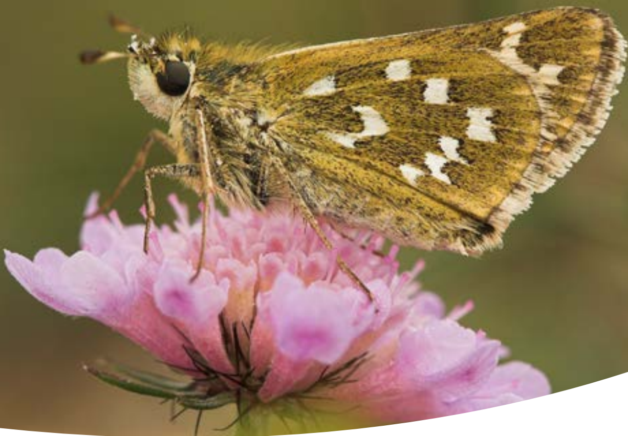
Silver spotted Skipper Hesperia comma