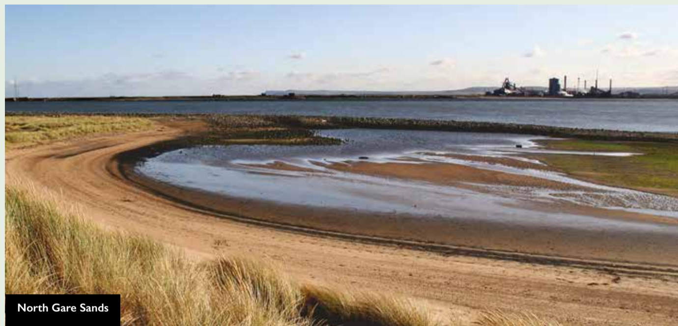
North Gare Sands

Birds of prey also enjoy rich pickings at Teesmouth; merlins and peregrine falcons patrol Seal Sands for much of the year.