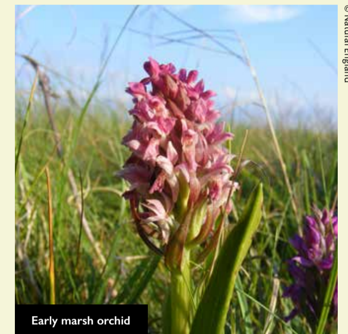
Early marsh orchid

Marvel at the swirling flocks of knots arriving from Greenland and the Canadian Arctic – this is the coastal equivalent of those great inland starling roosts. Several hundred handsome, brightly-coloured shelduck also spend the winter on Seal Sands.