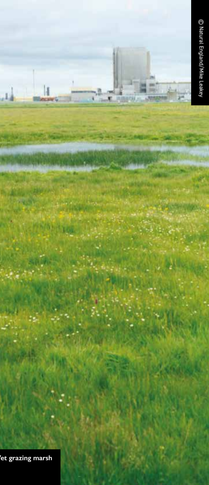
Wet grazing marsh

For further information please contact the NNR team: Castle Eden Dene Office on 0191 586 0004 or visit the Teesmouth National Nature Reserve Facebook page.