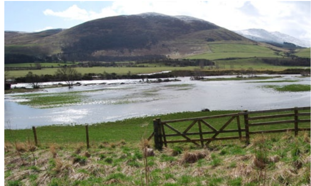
The River Glen in flood; much of the Cheviot Fringe forms the natural flood plains of the numerous rivers and streams that meander across it.

to crops and stock rather than residential properties. The preferred approach to managing flood risk as detailed in the Catchment Flood Management Plans includes restoring natural flood plains, promotion of sustainable land management practices that reduce the amount and rate of run-off and erosion, and investigation of measures such as floodwater storage.