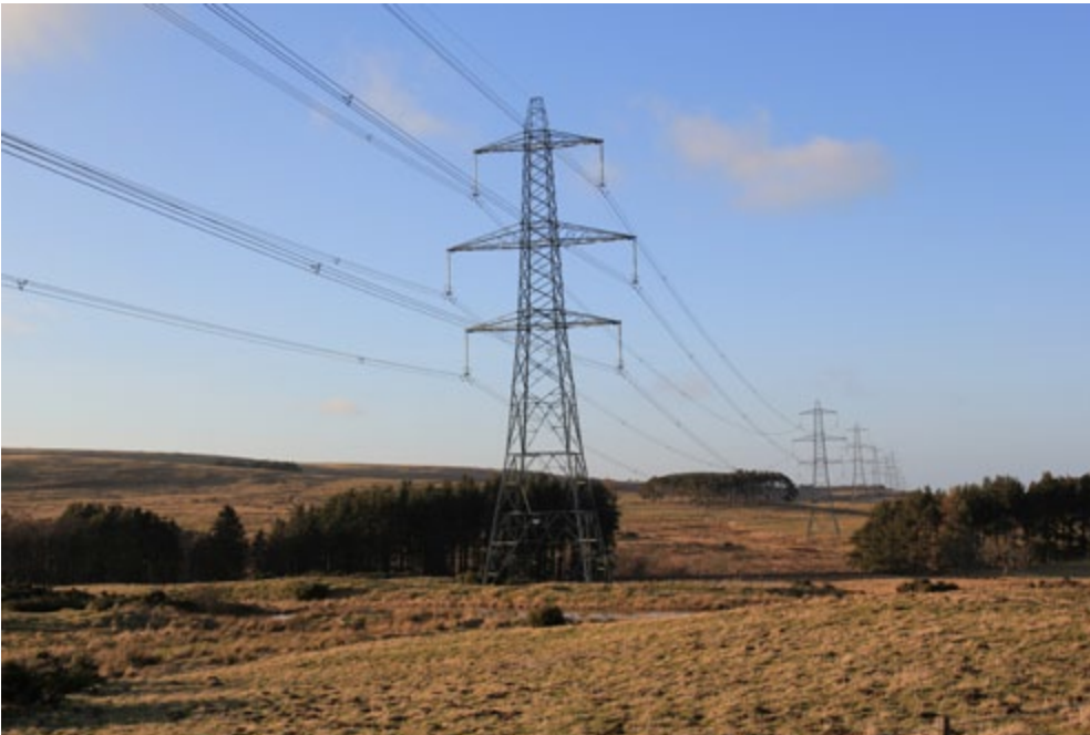
Vertical structures, such as these pylons at Roddam, are prominent features in the open landscape.