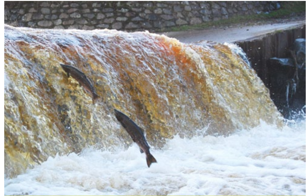
Rivers and streams are key features of this landscape. Man-made structures such as this ford at Haugh Head on Wooler Water make it difficult for species like salmon to negotiate the rivers.