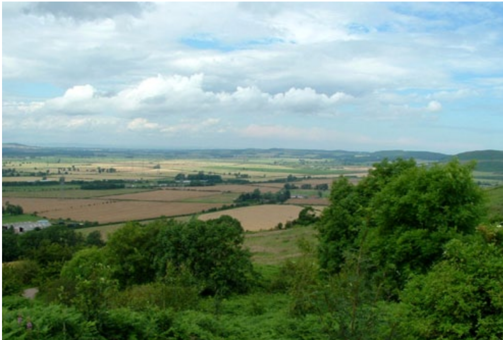
The Northumberland Sandstone Hills frame the arable plain near Ford with the English/Scottish border in the distance.

course in the centre of the NCA to join the Tweed, flowing through the Milfield Plain, collecting the waters of the River Glen and its tributaries en route. These rivers all have their steep headwaters draining upland heather and peat moors in the Cheviot Hills which means they respond quickly to rainfall; much of the valley floors form the natural flood plains of these dynamic, mobile rivers and occasional flooding of agricultural land and a small number of residential properties is an issue. The rivers provide important riparian habitats such as river shingle, wet woodland and grazing marsh, and support internationally and nationally threatened species such as Atlantic salmon, sea trout, otter,