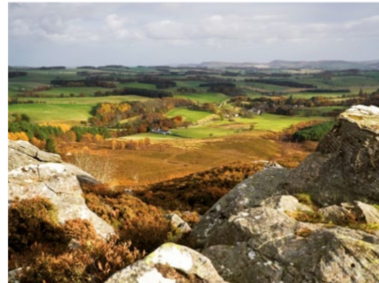
From the hills above Harbottle, looking south-east across the southern end of the NCA: the Cheviot Fringe is a lowland landscape framed by the Cheviots (foreground) and the Northumberland Sandstone Hills (distance).

This lowland landscape, dominated by views of the Cheviots and Northumberland Sandstone Hills, is dissected by three major river systems, all radiating from the Cheviot Hills, which cross the broad valleys and plains of the Cheviot Fringe before flowing into adjacent NCAs. The rivers Coquet and Aln in the south flow eastwards and on through the Northumberland Sandstone