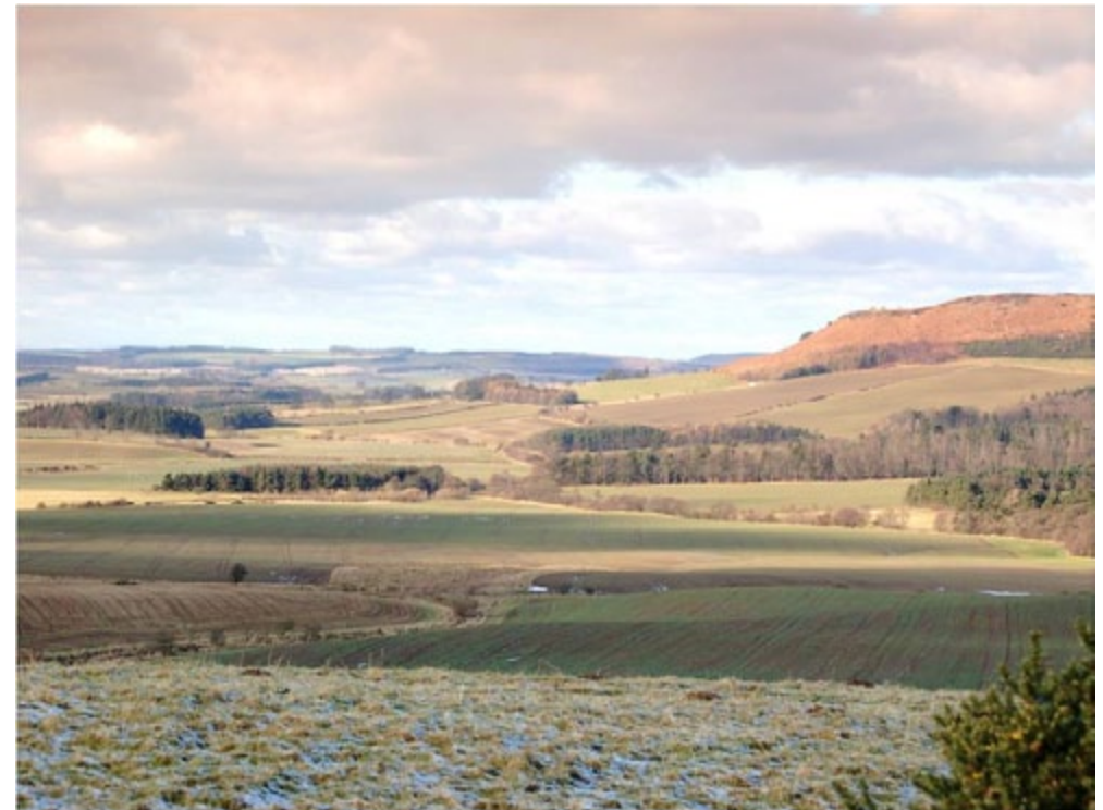
The Lower Breamish Valley where small mixed and coniferous woodland copses, blocks and shelterbelts are prominent features in the landscape.

The present pattern of dispersed settlement, with isolated farmsteads and farm hamlets, dates from when the landscape was hugely altered, reorganised and redistributed in the late 18th and 19th centuries, driven by the large estates which formed the backbone of farming in the area. Grand country houses such as Pallinsburn House, Ewart Park, and Lilburn Tower, were built, surrounded by the estates' farmland. These large houses sometimes incorporated older fortified structures into the fabric of the buildings, and were often set within parkland, much of which can still be seen. Farmsteads consisted of large fields well-fenced with quicksets and blocks of conifer plantation interspersed with