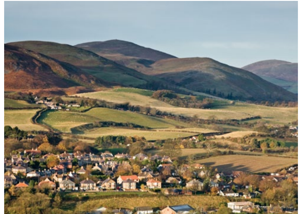
Small, nucleated villages, dispersed farmsteads and farm hamlets are scattered throughout this rural landscape. Like many of the settlements in this area, Wooler is situated at the break of slope between the uplands and the flatter vale floor.

Wooler is the largest town in the area, located on the A697 which is a key route running north–south and linking Morpeth with Coldstream. Owing to its proximity to the English/Scottish border, this landscape features many historic defensive structures including iron-age hill forts, fortified castles, bastle houses and tower houses, and Flodden Field and Homildon Hill battlefields are important tourist attractions. The rivers also draw visitors from far afield as they represent some of the most important game fisheries in England; the