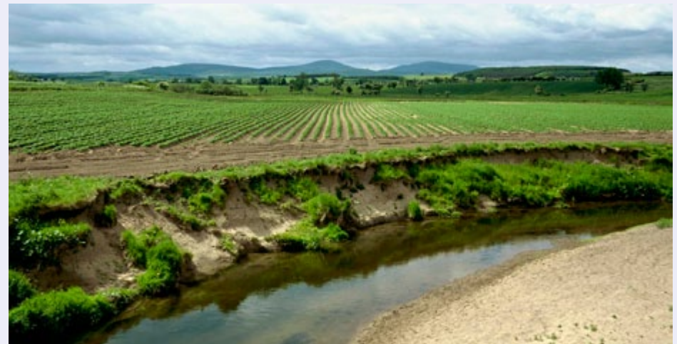
Arable cultivation dominates on the alluvial terraces of the Milfield Plain. Large fields are enclosed by fragmented hedgerows.