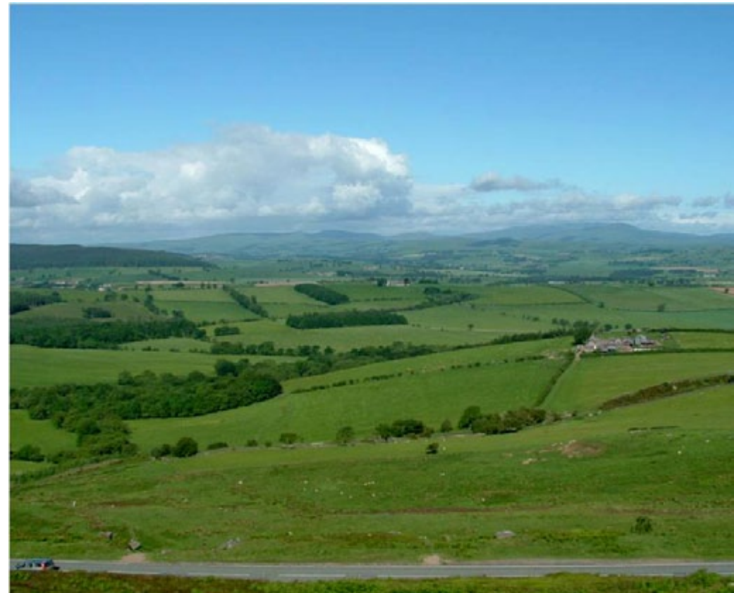
The vale of Whittingham is a patchwork of pasture, meadows and arable fields; the historic field pattern is still strong, delineated by hedgerows punctuated with hedgerow trees.

Biodiversity and geodiversity are crucial in supporting the full range of ecosystem services provided by this landscape. Wildlife and geologically-rich landscapes are also of cultural value and are included in this section of the analysis. This analysis shows the projected impact of Statements of Environmental Opportunity on the value of nominated ecosystem services within this landscape.