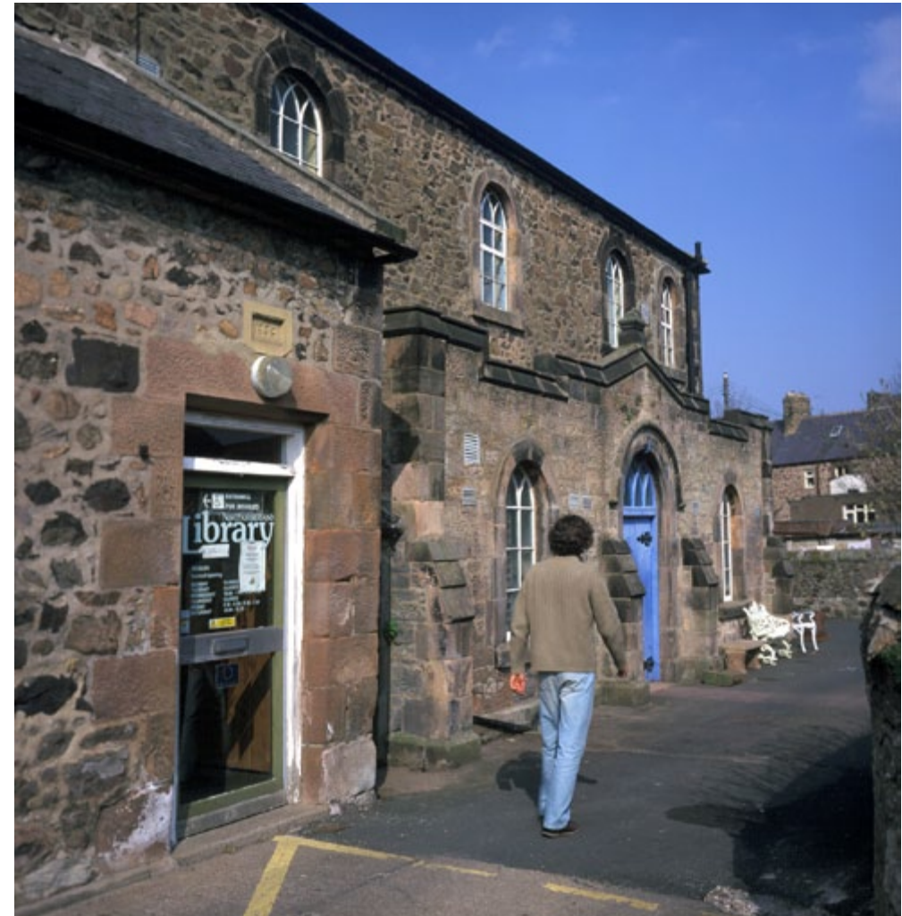
This Grade II-listed building in Wooler, formerly the Western Chapel but rebuilt in 1818 as a Masonic Hall is typical of the area, constructed from rubble and dressed sandstone with the pink hue characteristic of the Milfield Plain.

Three major river systems, all radiating from the Cheviot Hills, flow across these valleys and plains and are excellent examples of dynamic montane river systems, characterised by active meandering, large depositional features and connected and active flood plains. In the south of the area, the rivers Coquet and Aln flow eastwards across the broad, undulating valleys of Coquetdale and Whittingham Vale, and on through the Northumberland Sandstone Hills. The River Breamish, which eventually becomes the Till, also flows eastwards from the Cheviots, before swinging northwards at Powburn on a long meandering