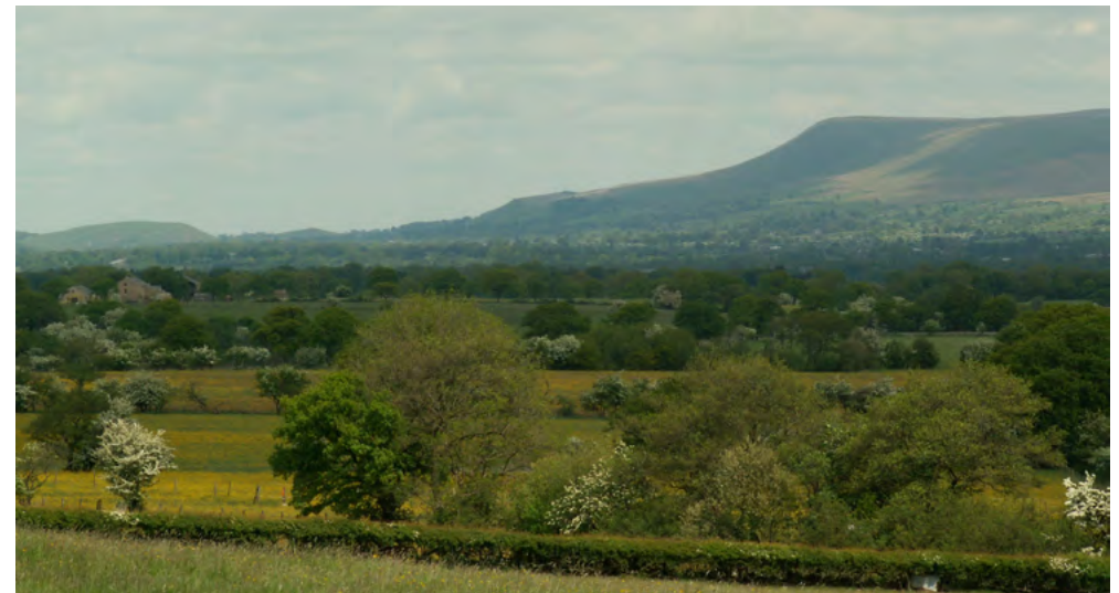
Pendle Hill from Copster Green.

This development began as a cottage industry during the 16th century with weaving rather than spinning. Traditionally, wool came from the Southern Pennine hillsides and flax from the low-lying country of the Lancashire and Amounderness Plain around Rufford and Croston. By 1700 each district was specialising in the production of one type of cloth. Blackburn was a centre for fustians, and most woollens and worsteds were manufactured in Burnley and Colne. The textile industry grew rapidly and, with new machines, the domestic system was replaced by factory systems which further accelerated the growth of these weaving communities. Nucleated settlements, developed from the late 18th century, were built around factory locations. These dominate the main north-east to south-west route alongside the Ribble flood plain and between the forests of Pendle and Trawden. Regular, imposing stone terraces were built to accommodate textile workers in the 19th century.