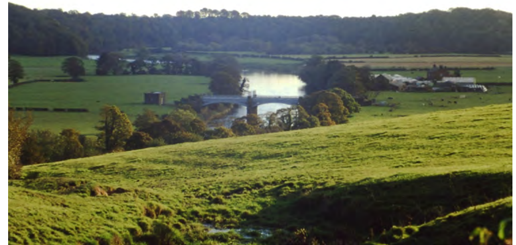
River Ribble at Salmsbury Bottoms.

Many important communication routes pass through the NCA, including the Leeds and Liverpool Canal, the Preston–Colne rail link and the M6, M61 and M65 motorways.