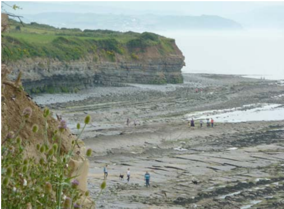
The coastline viewed from Kilve showing the low cliffs and distinctive geology, and the limestone grassland on the fringes of the cliff tops.

Based on the CPRE map of tranquillity (2006) it seems that much of the NCA is disturbed; a reflection of the larger settlements, numerous settlements and road (M5) and rail infrastructure running through the area. It is at its most tranquil to the west of Wellington around the Tone valley.