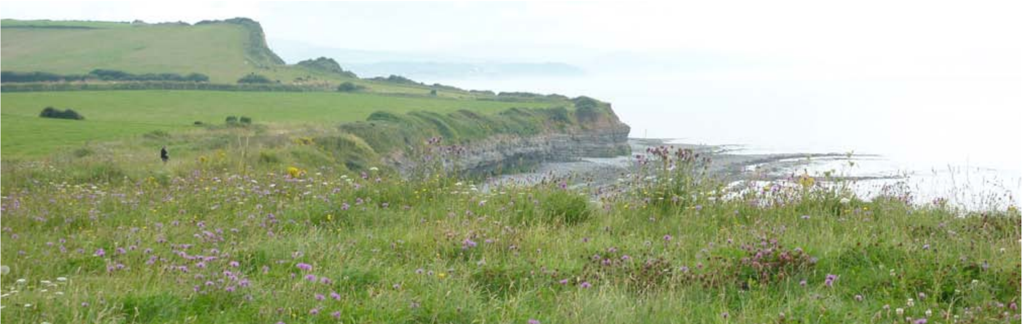
Limestone grassland fringes the Somerset Jurassic Coast cliffs, particularly between Kilve and East Quantoxhead, providing a nectar-rich habitat for invertebrates.

Biodiversity and geodiversity are crucial in supporting the full range of ecosystem services provided by this landscape. Wildlife and geologically-rich landscapes are also of cultural value and are included in this section of the analysis. This analysis shows the projected impact of Statements of Environmental Opportunity on the value of nominated ecosystem services within this landscape.