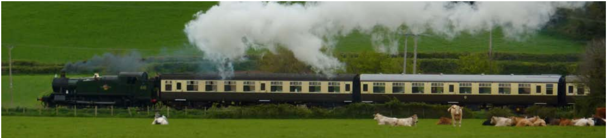
The West Somerset Railway runs as a tourist attraction between Minehead and Bishops Lydeard. The train runs through the gentle rolling landscape in the north of the NCA showing typical grazing pasture and wooded slopes, which eventually rise to Exmoor National Park.