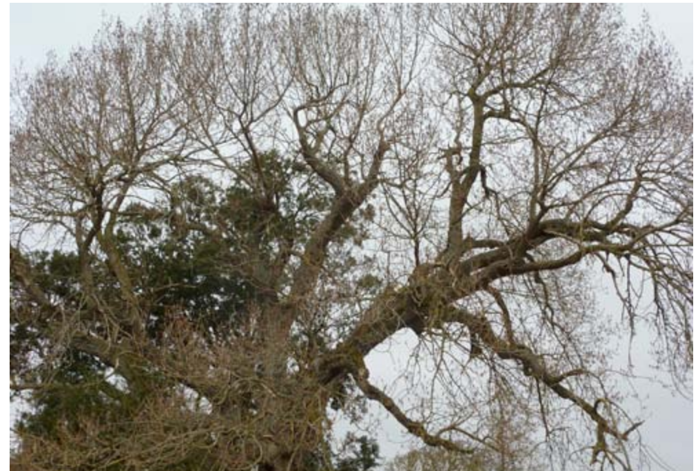
A black poplar on the edge of the village pond at East Quantoxhead. There are some fine examples of this nationally rare tree species in the NCA, generally on low lying wetter ground.