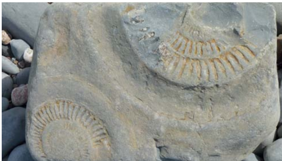
An ammonite found on the beach, which forms part of the Somerset Jurassic Coast, and a key feature of this coastline's SSSI designation.

There are 35 Local Geological Sites within the NCA.