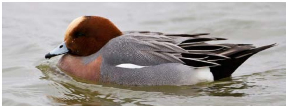
Wigeon feeding on the mudflats, are regularly winter visitors to Bridgewater Bay and are one of the birds that make up Bridgewater Bay SPA.