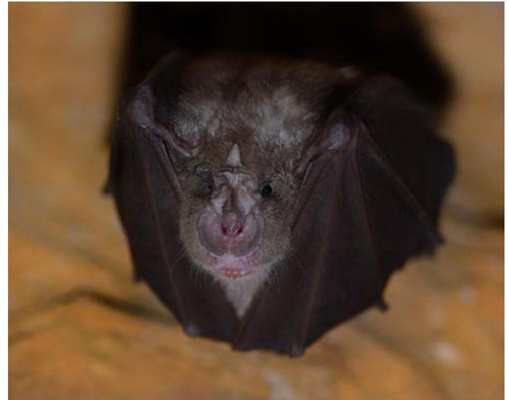
Lesser horseshoe bats are found roosting at Hestercombe House and use the network of hedgerows and other semi-natural habitat as hunting grounds.

A network of winding narrow sunken lanes link settlements. The M5 corridor and national rail line cut west-east along the bottom edge of this NCA. Locally dominant, the M5 influences the development of Taunton and Wellington; the industrial and commercial developments at their edges extend over a wide area.