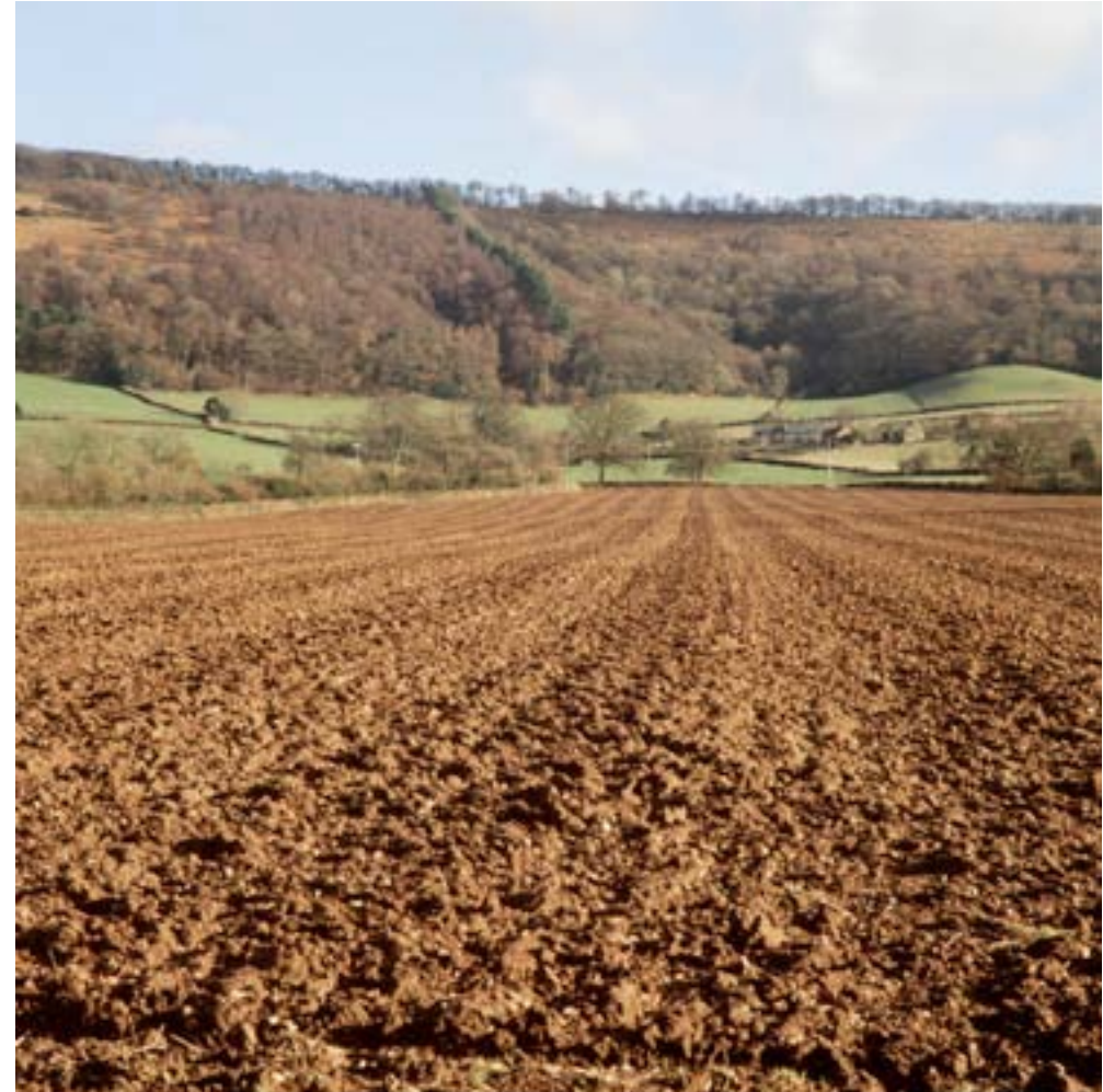
The red soils of the area seen on agricultural land at the base of the wooded scarp at the western edge of the Quantock Hills AONB.