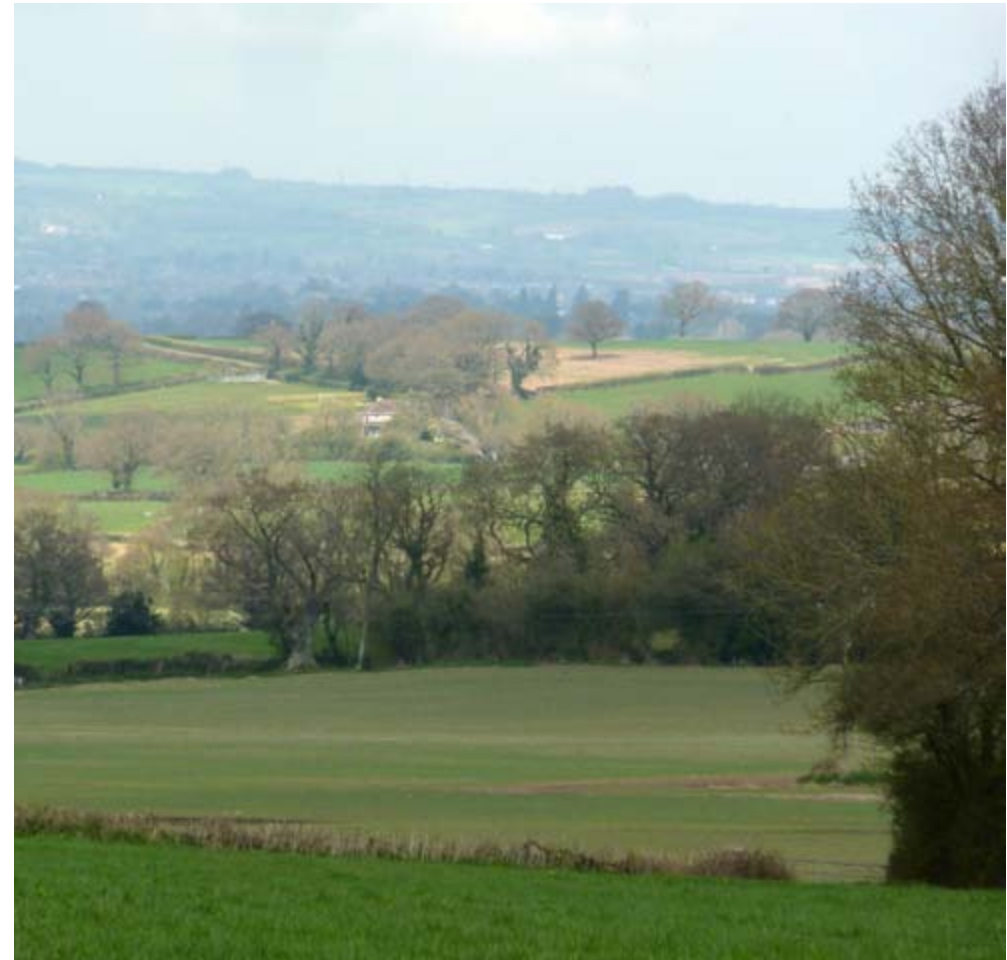
Hedgebanks, hedgerows and hedgerow trees, small woodlands and pollarded trees, help delineate distinctive field patterns and provide an ecological network within the farmed landscape. They are key features that need protection and maintenance to ensure continuity in the landscape.