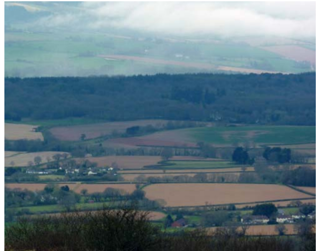
View from the Quantock Hills AONB showing a wooded feel to the landscape from small areas of woodland and hedgerow trees. There are also scattered farmsteads and hamlets found throughout the NCA.

Combwich and Bridgwater, just outside the NCA. The development will have an impact on the visual setting of the area which will be mitigated by extensive landscape enhancement measures, including tree and woodland planting, grassland creation, hedgerow planting and other landscaping works.