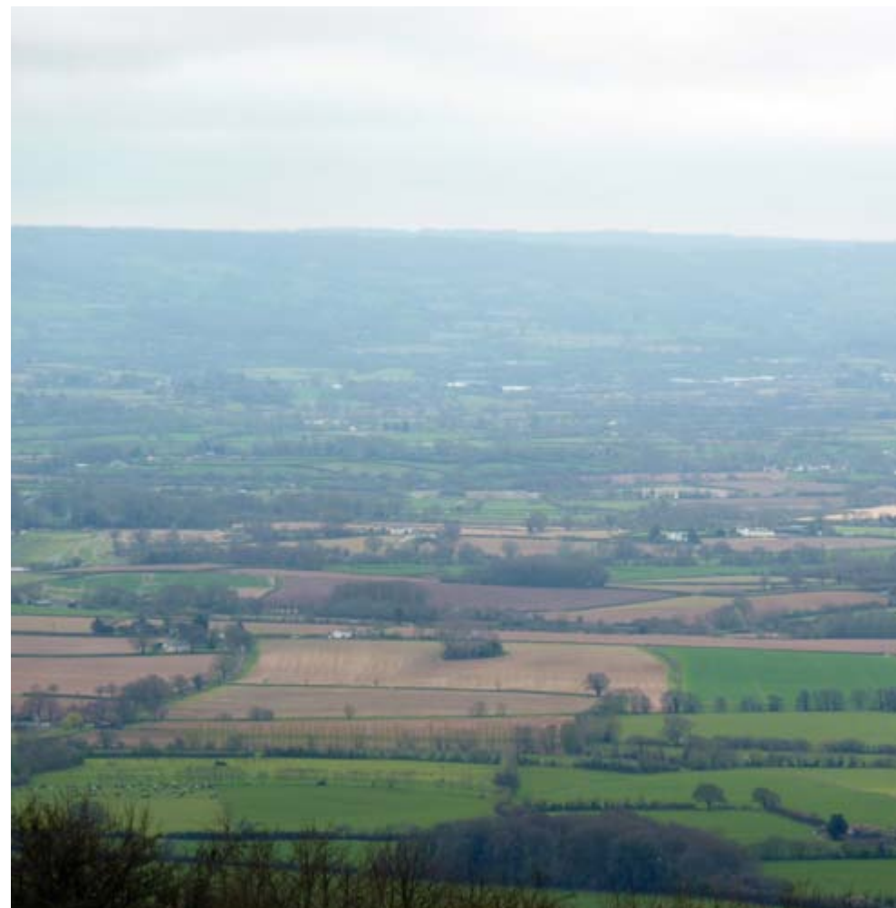
View across the the lower-lying Vale of Taunton and Quantock Fringes from Quantock Hills AONB. The mixed farming pattern of the area is obvious with a patchwork of irregular fields bounded by hedgerows with trees and small pockets of woodland.

Maps are available from the Environment Agency showing current and projected future status of water bodies at: http://maps.environment-agency.gov.uk/wiyby/wiybyController?ep=maptopics&lang=_e