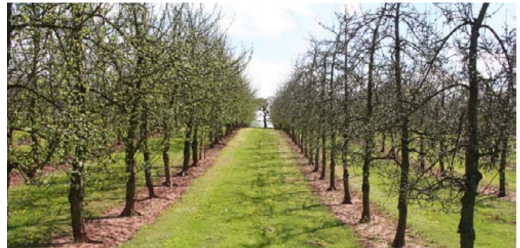
An orchard near Bishop's Lydeard. Orchards are particularly common in the southern half of the NCA and are benefiting from a renaissance in cider consumption with new orchards being planted, ensuring they remain a key part of the landscape.

The vale has a patchwork of arable, pasture, market gardening and orchards and small woodlands on slightly higher ground. Hedgerows are lush with a rich variety of shrub and tree species, often dominated by hazel, dogwood, holly and blackthorn. Small villages and larger hamlets were often the centres of small manors, represented today by manor houses.