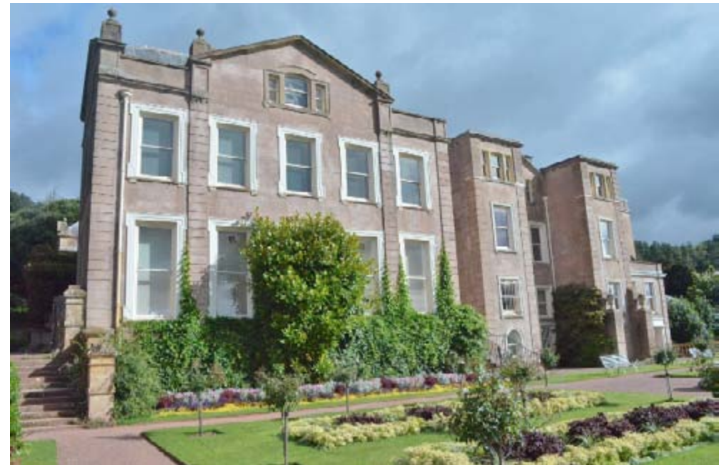
Hestercombe House. An example of one of the area's fine manor houses built on the back of wealth generated by prosperous farming here. The area around the house is also designated an SAC for its lesser horseshoe bat population.