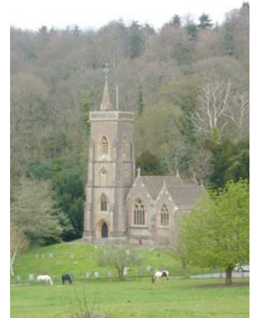
St. Etheldreda (also known as St. Audries) near West Quantoxhead village, is a typical sandstone-built church with a perpendicular tower; a prominent and characteristic feature of the small settlements and hamlets of the area.

The M5 cuts through the south-eastern edge of the NCA while the A39, A38, A358 and A3259 connect the north and south of the NCA by way of Taunton and Bridgwater.