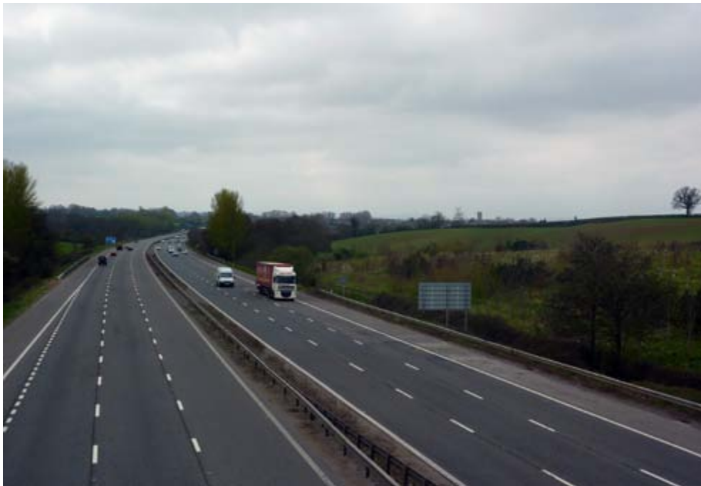
The M5 motorway corridor, which passes through the south-east edge of the NCA and exerts a strong influence over much of the southern part of the Vale of Taunton.

The poets Wordsworth and Coleridge frequented the area. Coleridge wrote The Rime of the Ancient Mariner while travelling through Watchet, and Shurton Bars, to the west of Hinkley Point, inspired his poem to his fiancée Lines Written at Shurton Bars .