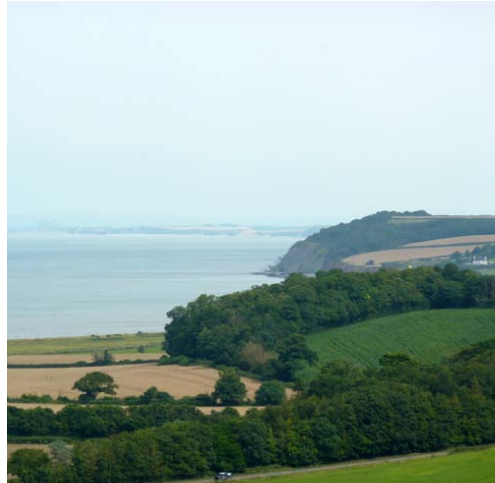
A sweeping coastal view across the main coastal road. There is an intimate network of woodland and hedgerows and farmland and other habitats such as limestone grassland set against the backdrop of Bridgwater Bay.