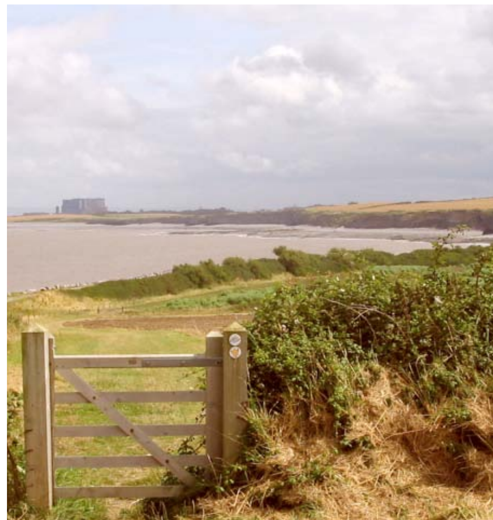
View from the route of the West Somerset Coast Path at Lilstock, Bridgwater Bay. Hinkley Point power station is in the distance.

Please note: Common Land refers to land included in the 1965 commons register; CROW = Countryside and Rights of Way Act 2000; OC and RCL = Open Country and Registered Common Land.