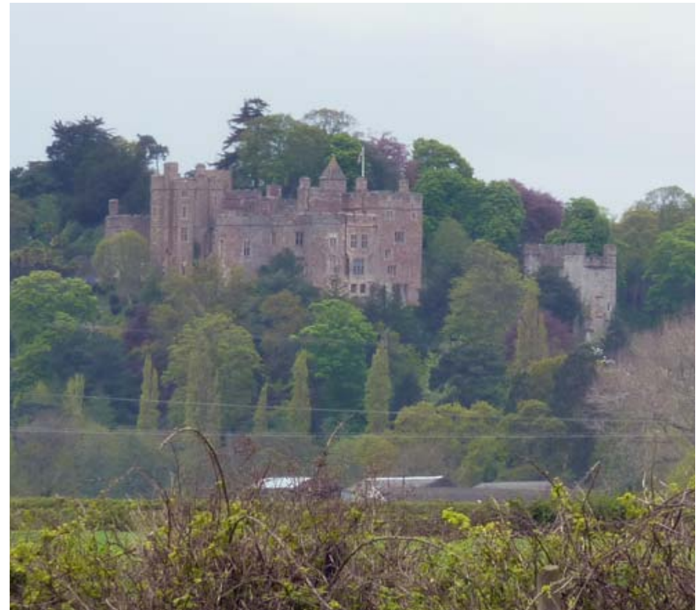
Dunster Castle overlooking the north-western part of the NCA on the fringes of Exmoor NCA. Historic features such as this and their associated parkland are a notable feature of the area and an indication of the wealth and prosperity built on the back of agriculture.