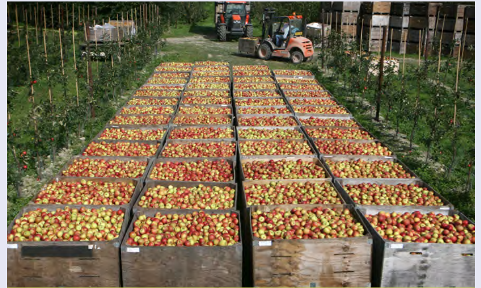
Apple harvest at Blackmoor Estate, Hampshire.