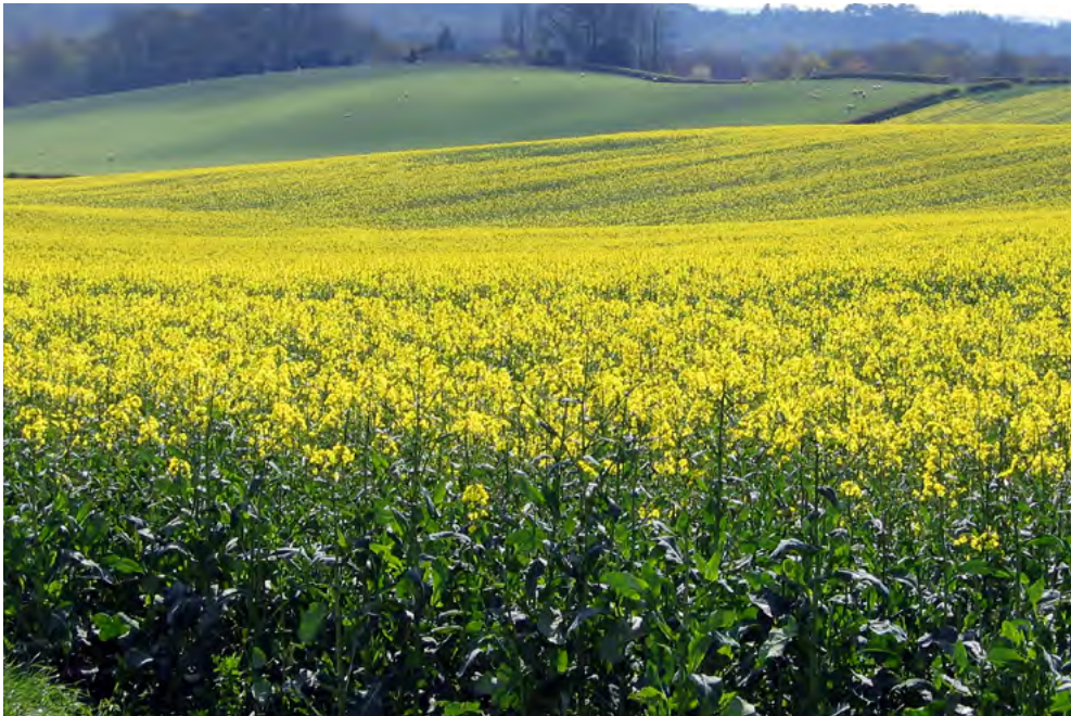
Fields near Petworth, West Sussex.

Development pressures are likely to pose significant challenges within the NCA, with increasing demands on water resources, the landscape, biodiversity and the sense of place. Well planned green infrastructure is likely to play a critical role in both new and existing developments, to bring about a range of economic, social and environmental benefits. The creation of resilient ecological networks will become increasingly important, especially as our climate changes. There are opportunities to strengthen the networks of semi-natural habitats – particularly wetlands, woodlands and heathlands – integrating them into the mixed farmed landscape and taking action to reduce further fragmentation.