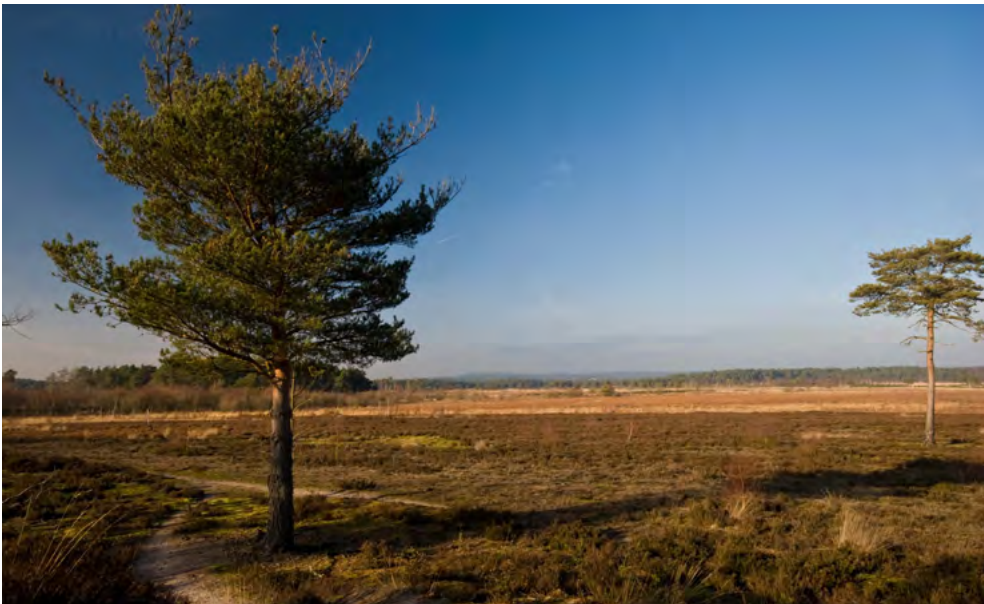
View across Ockley Common.

To the west, in Hampshire, Sussex and West Surrey, the Greensand forms an intimate landscape with a diverse character – from the more or less parallel sandstone ridges to the steep and dramatic scarp slopes, and the rounded clay vales containing river valleys with broad plains. The small pasture fields and linear woodlands of the scarps and ridges give way to larger and more regular field patterns and regular-plan farmsteads – the result of the successive reorganisation and enlargement of farms. This arable landscape of large, geometric fields is encouraged by the light, fertile soils of the Western Rother plain that cuts through the sandstone. It provides a local contrast with the more intimate nature of the sandy soils dominated by small pasture fields. On the higher ground, these sandy soils support some extensive heathland, including two Special Protection Areas (SPA) and three SAC. These heathlands give the landscape an impressive purple hue in mid to late summer, from the darker purples of the bell heather to the soft mauves of the ling/common heather. The species associated with these habitats – such as the Dartford warbler, nightjar, woodlark, amphibians, reptiles and butterflies (including the silver-studded blue butterfly and green hairstreak) – all add diversity to the landscape in sound, colour and texture.