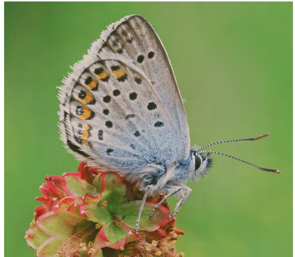
Silver-studded blue butterfly.

Biodiversity and geodiversity are crucial in supporting the full range of ecosystem services provided by this landscape. Wildlife and geologically-rich landscapes are also of cultural value and are included in this section of the analysis. This analysis shows the projected impact of Statements of Environmental Opportunity on the value of nominated ecosystem services within this landscape.