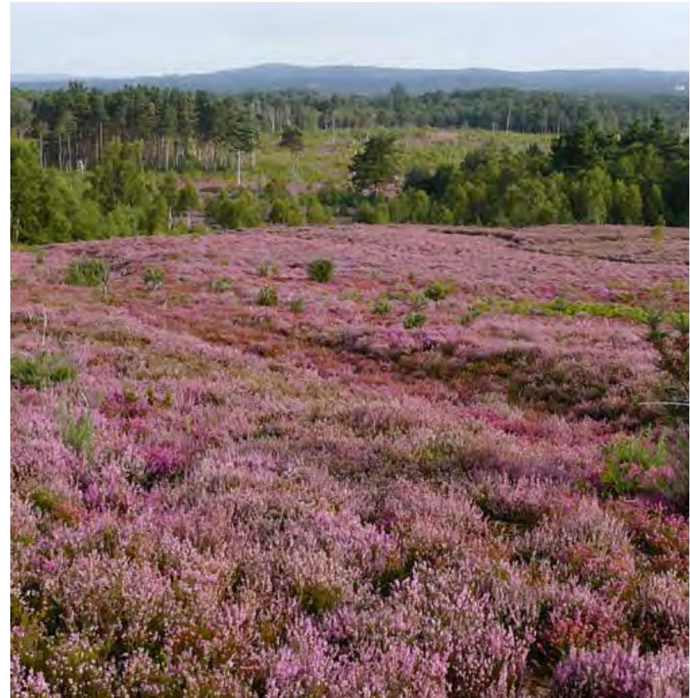
View north from the Greensand ridge across Thursley Common. The dry heath, dominated by ling and bell heather, supports a wide range of wildlife including uncommon reptiles and rare heathland birds.

A major transport corridor runs through the eastern part of the NCA, including the Channel Tunnel rail link connecting Folkestone to London.