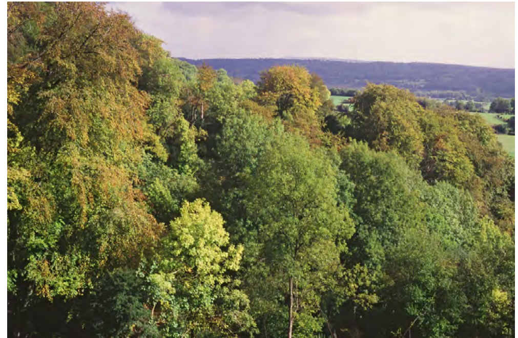
Ashford Hangers National Nature Reserve.