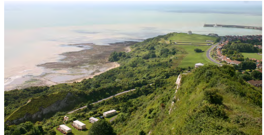
Cliffs at Copt Point.

the Great Stour and East Stour both rise on the Greensand before joining upstream of Ashford and flowing northwards. A key characteristic of this area are the large areas of woodland dominated by sweet chestnut coppice, originally planted to support the hop industry and more recently for use as renewable fuel.