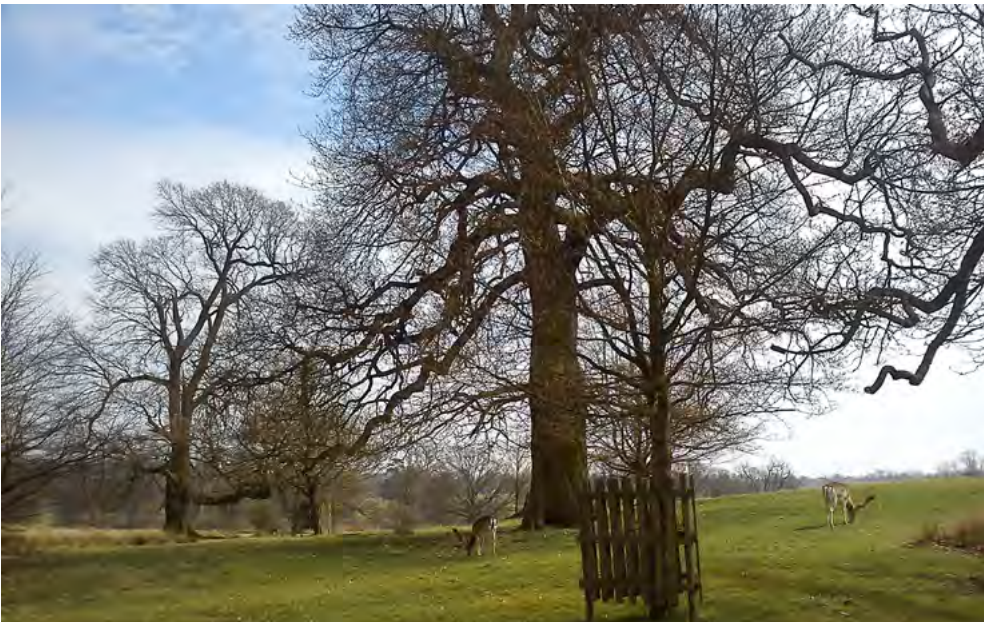
Kent's last medieval deer park at Knole.

The Greensand is scattered with landmarks that document the activities of previous centuries and make important contributions to England's heritage. These include Waverley Abbey, remains of the first Cistercian abbey in England, and a series of historic bridges over the River Wey, linked to the remnant water meadow system and thought to have been built by the monks of the