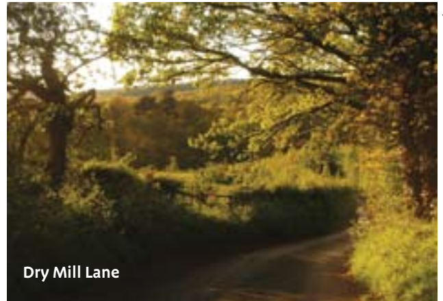
Dry Mill Lane

Oak was the coppice species of choice in the forest, although by the late 1700s coppice management meant that there were few mature trees left in the wood.