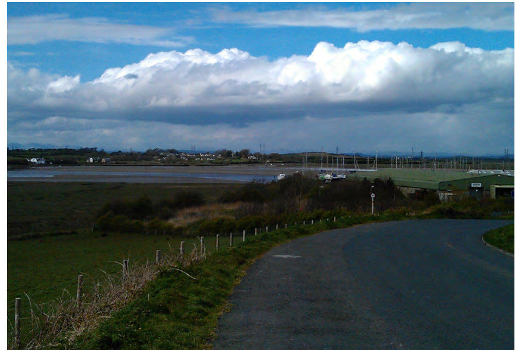
View of the Lune Estuary looking towards the marina at Glasson.

North of Heysham development of the coastal strip has been reinforced over time, starting with the arrival of the railway in the 1840s, which led to the development of the seaside resort of Morecambe. In the 20th century caravan sites and golf courses were also developed either side of Morecambe in the rural zone, followed by the development of the port and the power station at Heysham, the latter with a connecting infrastructure of power lines. These economic forces, combined with the development of Lancaster as the (former) administrative capital of Lancashire, have resulted in large parts of the NCA developing into urban and suburban landscapes.