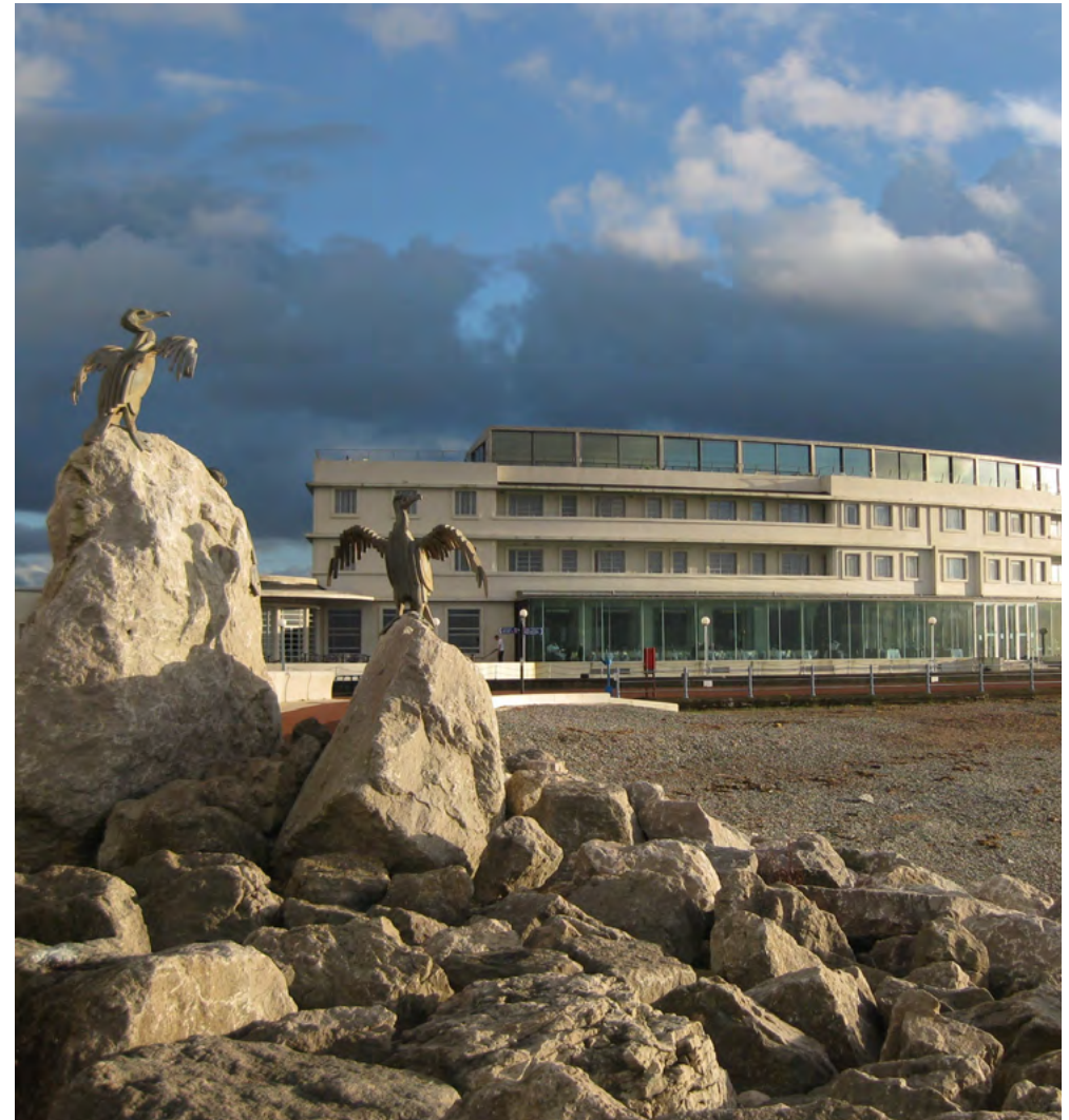
The sea front of Morecambe has evolved over time but has always reflected the identity of Morecambe Bay.

The urban settlements in the NCA differ in nature. The town of Morecambe has a Victorian seaside resort character, particularly along its seaside town facade, reflecting its development as a coastal town with recreation and visitors at its heart, which was made possible by the arrival of the railway in the 1840s. The coastal strip is dominated by guest houses and shops serving the needs of seaside visitors. Behind this the town has a more suburban character. This character, which is shared by some of the other coastal towns, differs from that of Lancaster, the important historic city and modern university town, which was formerly the administrative centre for Lancashire. Associated with its history as a trade and administrative centre, the city has a number of historic buildings including Lancaster Castle, overlooking the Lune crossing points, and Lancaster Cathedral. It rises up from the banks of the River Lune to high points such as the Ashton Memorial in Williamson Park, with panoramic views across the NCA, Morecambe Bay and on towards the mountains of Cumbria. The majority of the buildings in Lancaster are constructed from local natural sandstone from the Millstone Grit Series and typically take the form of two- and three-storey stone terraces. Millstone Grit is also the traditional building material in the villages south of Lancaster along the course of the Lancaster Canal.