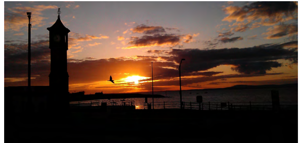
Sunset across Morecambe Bay from the clock tower.