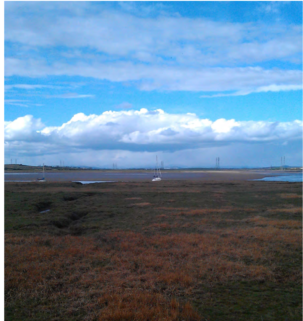
The Lune Estuary with its estuarine habitats is of international importance for waders and wildfowl.