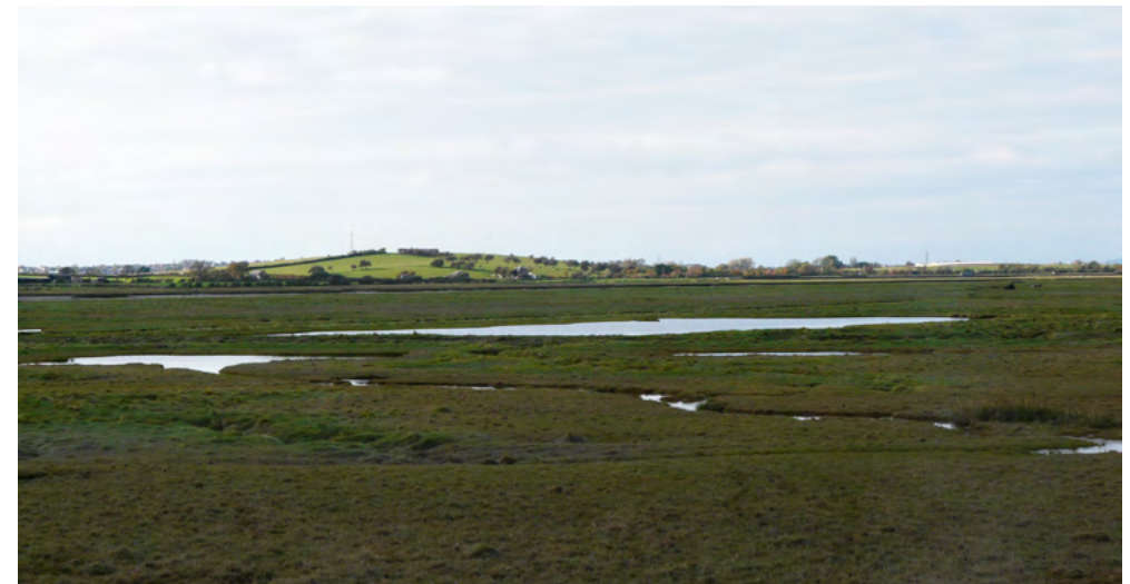
The pastoral landscape of the Lune Estuary with extensive salt marshes backed by low-lying glacially shaped hills.