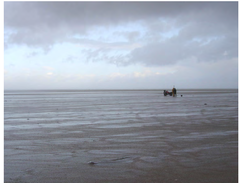
Cockle fishermen, Morecambe Bay. The riches of the bay have for centuries shaped both cultural and economic development.

Upland NCAs form the backdrop from viewpoints in the area to the Bowland Fells to the east and the Lake District across the sands of Morecambe Bay to the north. From these surrounding NCAs the Morecambe Coast and Lune Estuary NCA forms a low-lying fringe punctuated by such features as Heysham nuclear power station and the Ashton Memorial.