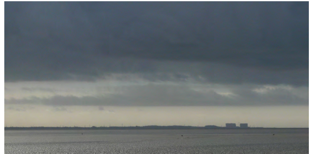
Heysham power station dominates the view across the sands of Morecambe Bay.

Although coastal trade was part of the early influence on settlement, more recently land-based trade routes have been more important and the NCA sits at one end of a bottleneck in north-south trade routes up the west side of England. This route is still much evidenced today with the Lancaster Canal, the West Coast Main Line railway and the M6 motorway all squeezed into a narrow corridor between the uplands of Bowland and the lowlands of Morecambe Bay.