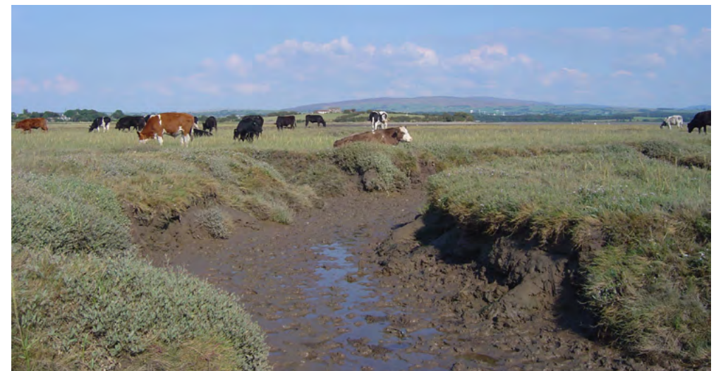
Cattle grazed salt marsh, Lune Estuary. The salt marshes of the coastal margin are internationally important for wildlife and support a range of ecosystem services.

Please note: (i) Some of the Census data is estimated by Defra so will not be accurate for every holding (ii) Data refers to Commercial Holdings only (iii) Data includes land outside of the NCA belonging to holdings whose centre point is within the NCA listed.