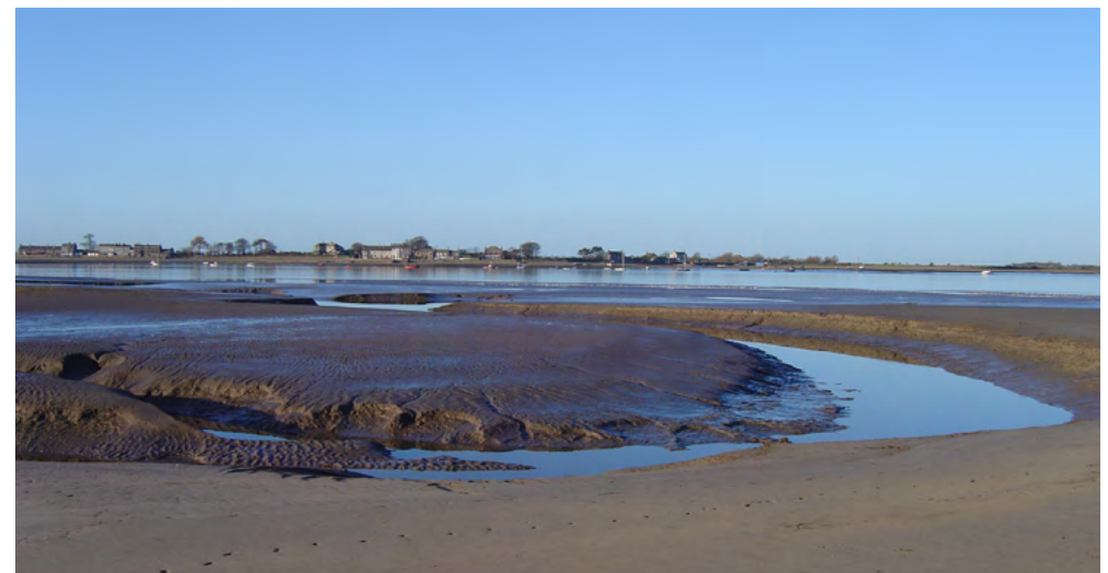
Sunderland Point and the Lune Estuary. The dynamic coastal environment has always exerted a strong influence on coastal settlements.

Point north the same features are present but as part of a narrower coastal strip associated with a more open coastline. This part of the NCA's coast is more diverse with occasional rock outcrops and glacially derived cobble skears. The natural attributes of the coast include extensive salt marshes and intertidal mud and sand flats which, along the entire coastal margin of the NCA, are nationally and internationally important and designated as Sites of Special Scientific Interest (SSSI), Special Area of Conservation (SAC), Special Protection Area (SPA) and Ramsar site for the habitats they include and the species they support, most notably hundreds of thousands of wintering wildfowl and waders including oystercatcher, knot and pink-footed geese, rare insects such as the belted beauty moth and also extensive reefs of the honeycomb worm on cobble skears.