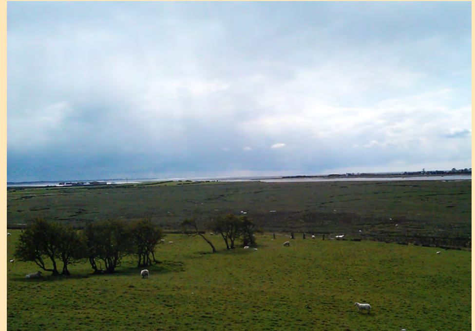
Hedges are a common boundary feature in the low-lying areas of the NCA but are often in poor condition, as here near Glasson.