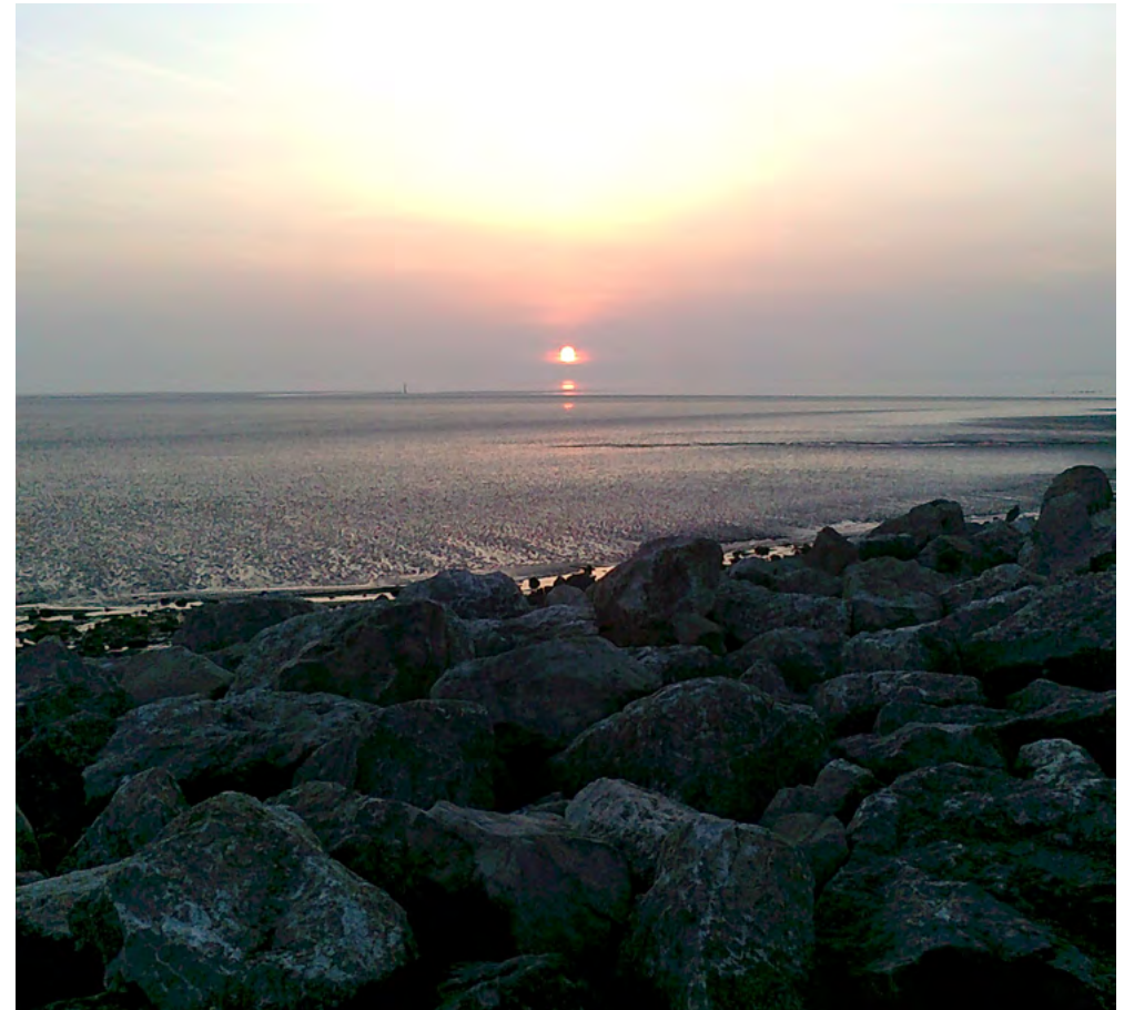
The tides, weather and light combine to constantly adapt the appearance of Morecambe Bay.

Biodiversity and geodiversity are crucial in supporting the full range of ecosystem services provided by this landscape. Wildlife and geologically-rich landscapes are also of cultural value and are included in this section of the analysis. This analysis shows the projected impact of Statements of Environmental Opportunity on the value of nominated ecosystem services within this landscape.