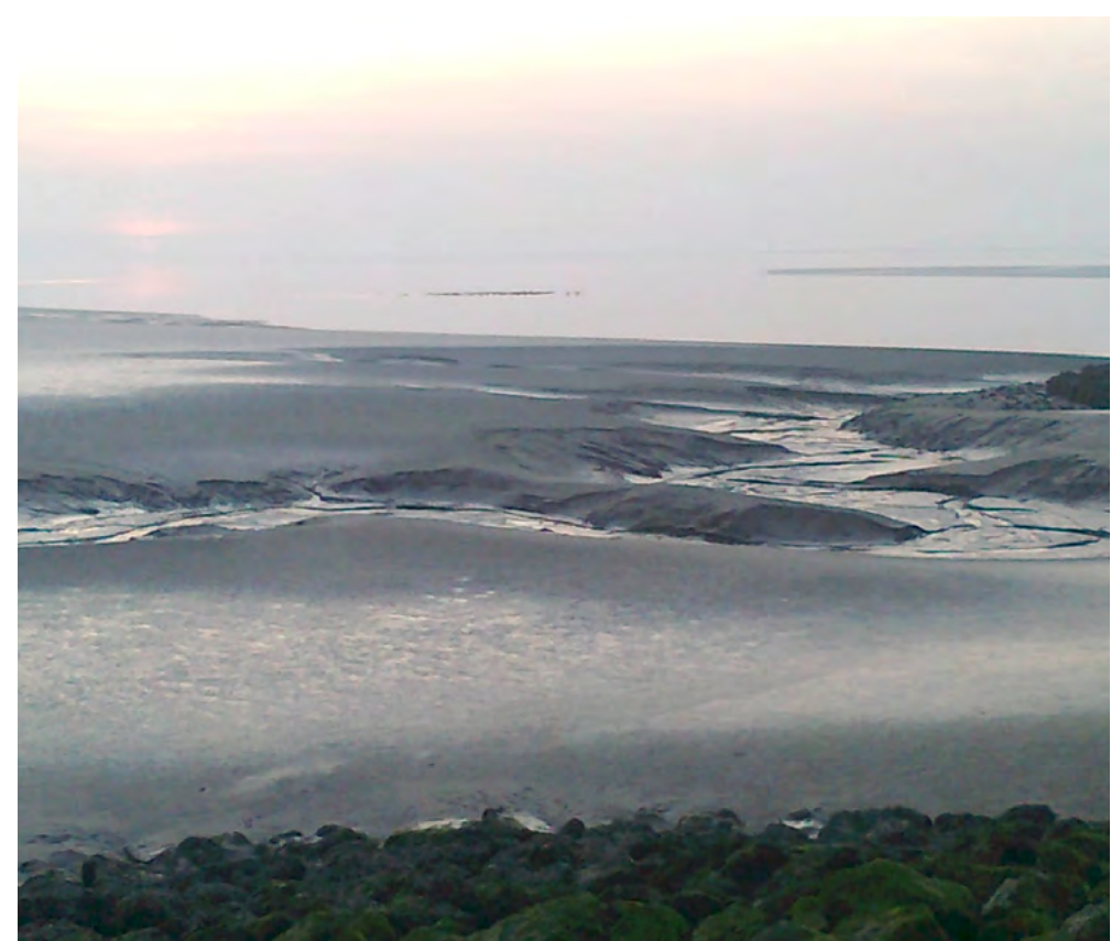
New tidal creek forming in response to coastal sea defences protecting Morecambe.

a network of artificial watercourses. By the mid-1800s the land around the bay was mostly drained and let in large farms producing crops of wheat, oats or barley, turnips and seeds. Today, however, the agricultural system is essentially pastoral with grazing and grass managed for winter feed which forms the dominant agricultural land use.