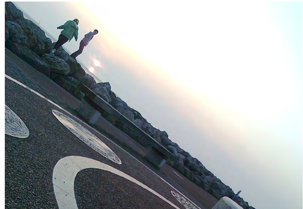
Experiencing and celebrating the coast through the arts - the Tern project on Morecambe sea front.