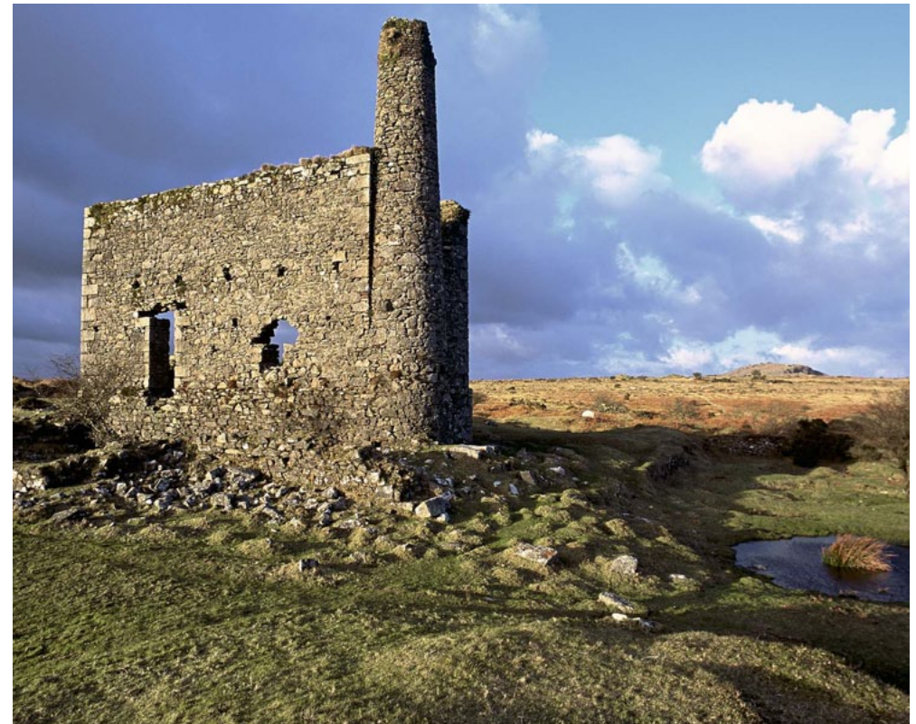
Ruins of tin mine near Minions, Bodmin Moor

The remote and bleak nature of Bodmin Moor makes it an important location for outdoor pursuits, with many people enjoying walking and mountain biking across the area. This is complemented by the lakes and reservoirs, notably Colliford Lake, that provide opportunities for watersports such as sailing and windsurfing. Many areas of the moor are used for field studies by international educational establishments, in recognition of the special landscape.