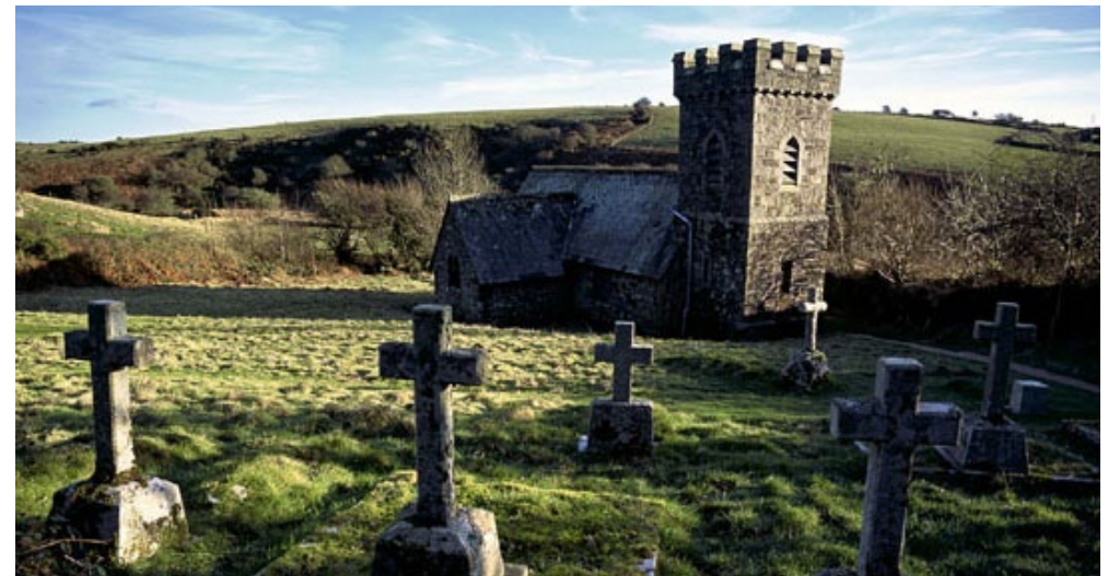
Temple Church, Bodmin Moor