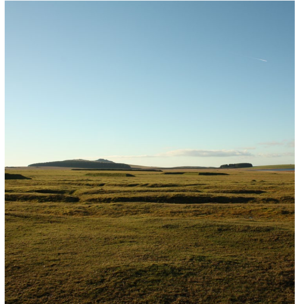
Brown Willy from Davidstow Airfield