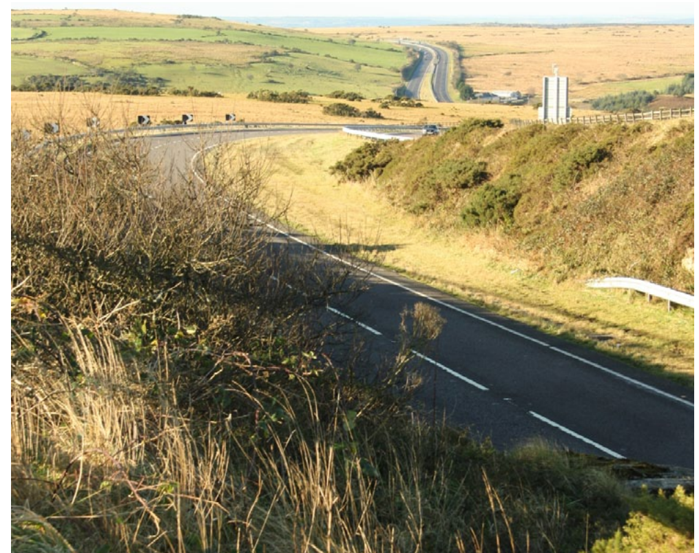
A30 trunk road bisecting the Moor

Links to the surrounding countryside are emphasised through the pattern of farmsteads and settlements connected to the moor by trackways, allowing the movement of grazing livestock to the moor in summer and back to the lower valley pastures in the winter.