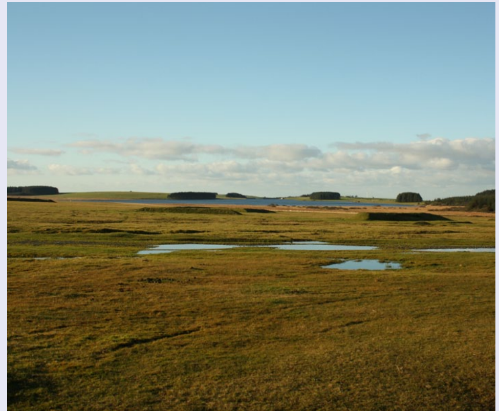
Crowdy Reservoir across the Second World War airfield at Davidstow