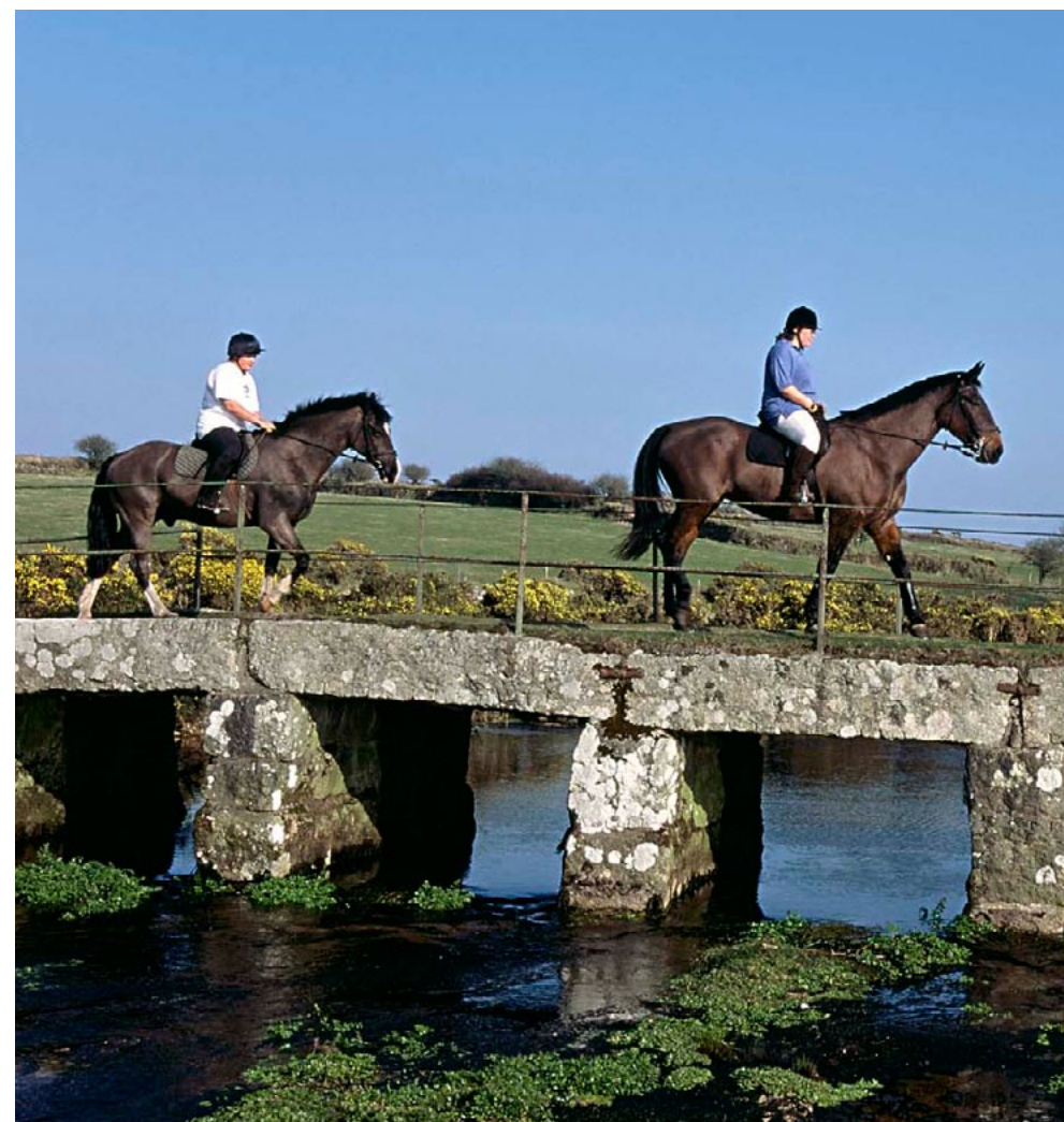
Pony trekking on the moor

Please Note: Common Land refers to land included in the 1965 commons register; CROW = Countryside and Rights of Way Act 2000; OC and RCL = Open Country and Registered Common Land.