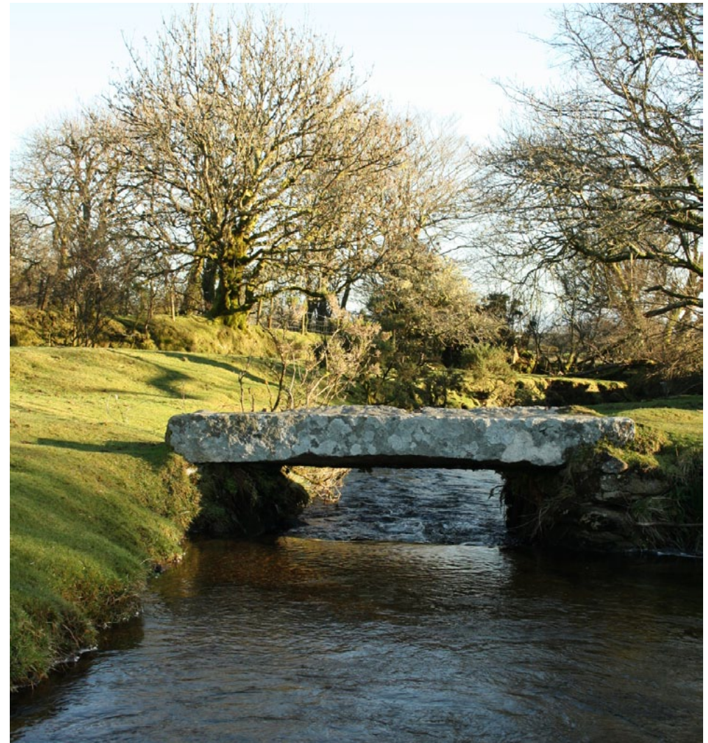
Ancient clapper bridge over Penpont Water