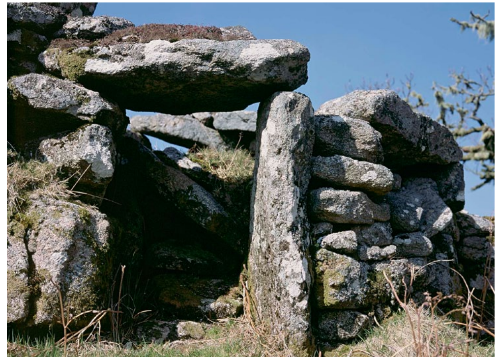
Remains of ancient settlements on Bodmin Moor

Early settlers were involved in the clearance of trees from the moor. Flint scatters can be found across the area suggesting a transition from hunting to settled agriculture. Bronze-age settlers continued the domestication of the area, adding to the already abundant remains of Neolithic ritual and funerary monuments, including barrows, cairns and standing stones with notable concentrations in the Rough Tor and Stoves Pound areas. From around 1000 bc, a cooling climate and wetter conditions brought about the steady abandonment of the high moor.