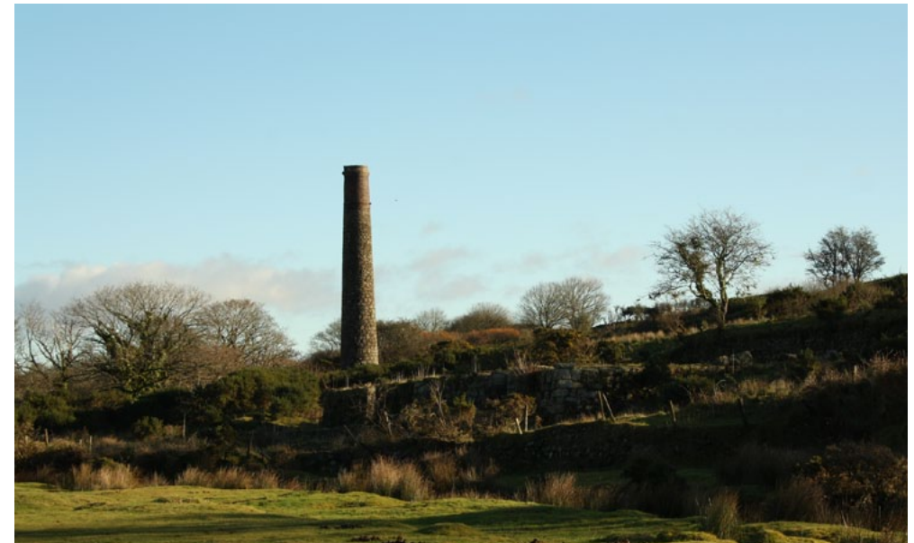
A derelict mining chimney at Furhouse

Bodmin links with the surrounding areas through five main rivers that rise in shallow bogs on the high moor. They flow into wooded valleys, for example at Golitha Falls – a National Nature Reserve (NNR) – and plunge off the moor flowing either directly to the sea or into the larger River Tamar.