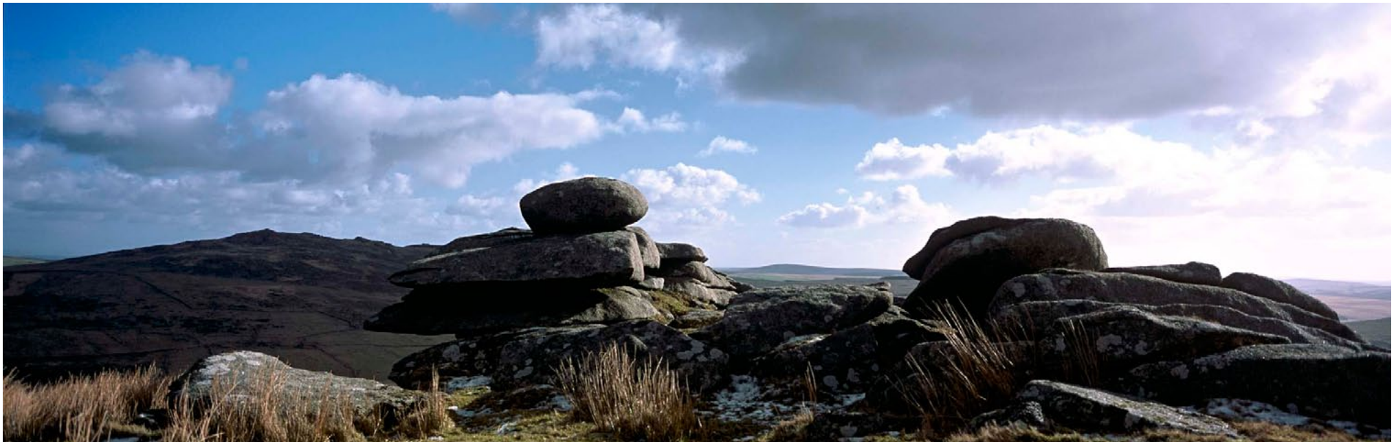
Granite outcrops at Rough Tor with Brown Willy behind, Bodmin Moor

Biodiversity and geodiversity are crucial in supporting the full range of ecosystem services provided by this landscape. Wildlife and geologically-rich landscapes are also of cultural value and are included in this section of the analysis. This analysis shows the projected impact of Statements of Environmental Opportunity on the value of nominated ecosystem services within this landscape.