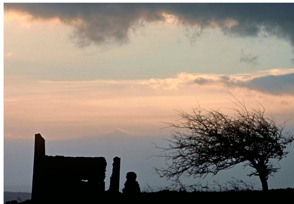
Tin mine near Minions