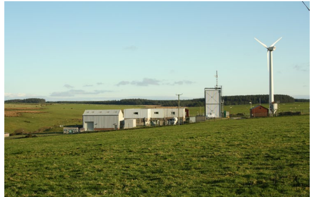
Camelford water treatment works