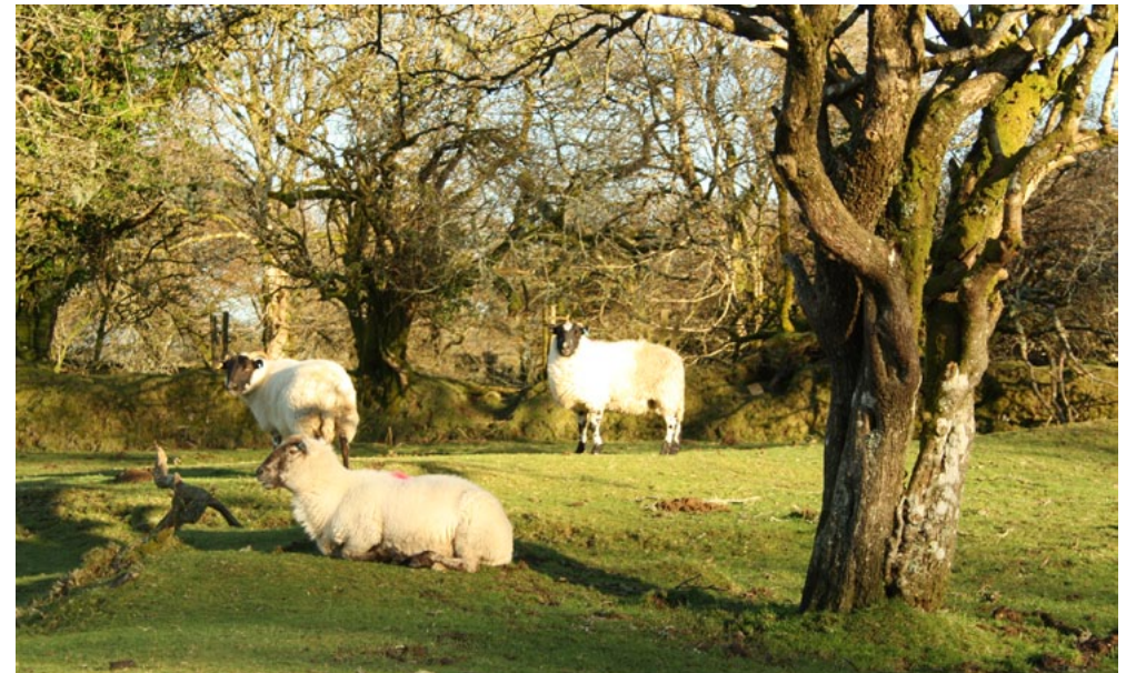
Sheep sheltering by a hedge

Cattle rearing has long formed a major element of the area's agricultural economy. This has led to the intensification of grass production with any suitable areas being used to provide winter fodder crops. While cattle are still a component of Bodmin Moor, the area is now dominated by sheep grazing with an average of 74,000 sheep being grazed within the NCA. Ponies have historically and culturally played a significant part in the development and management of the moor and many ponies still graze on the moor.