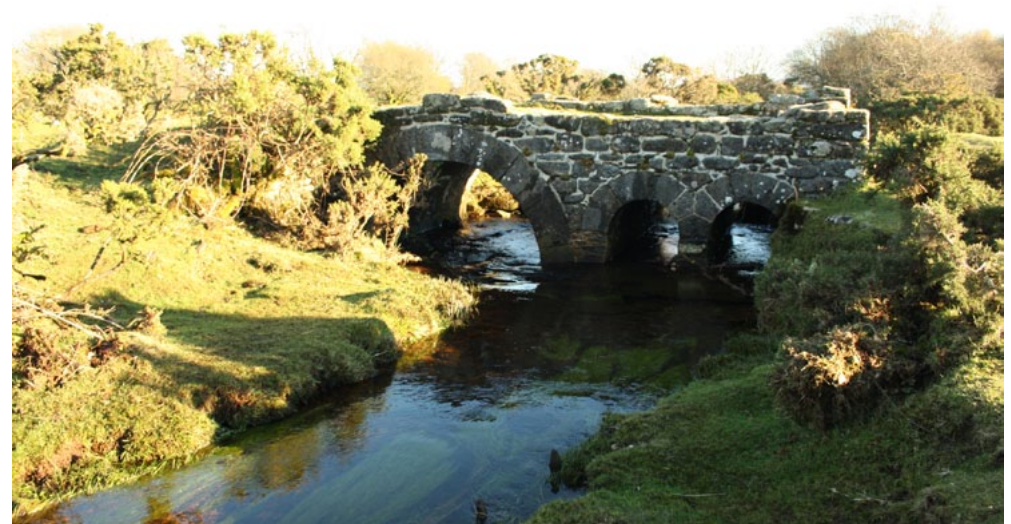
Pack horse bridge