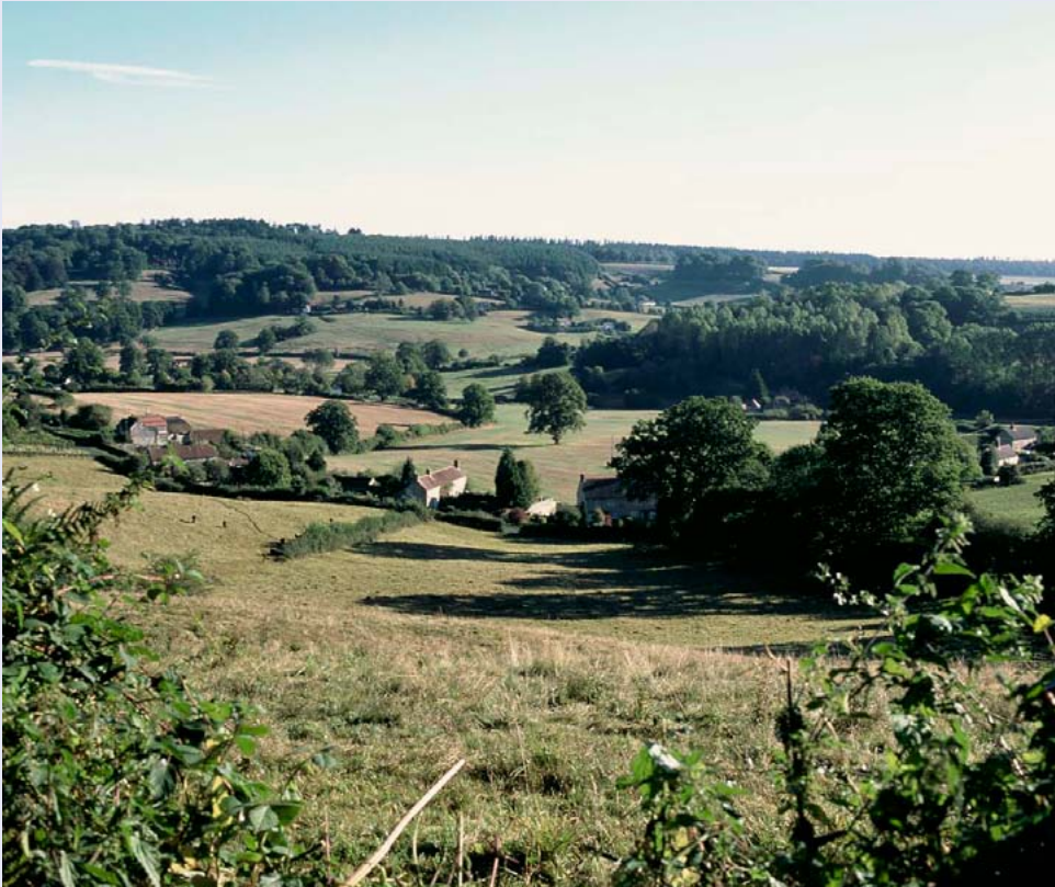
Looking east towards Horsingsham, Wiltshire.