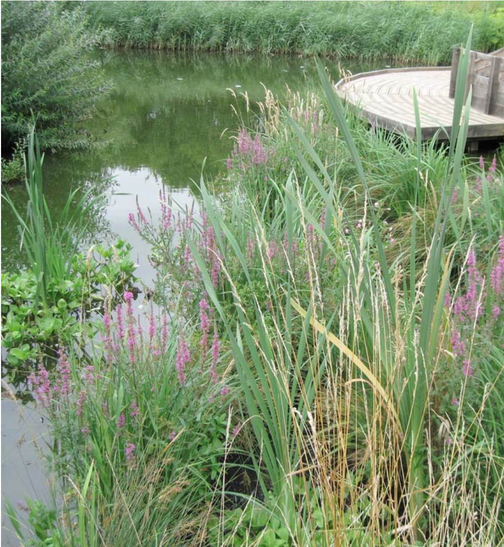
Coir rolls with purple loosestrife in pond at Biss Meadows Country Park.