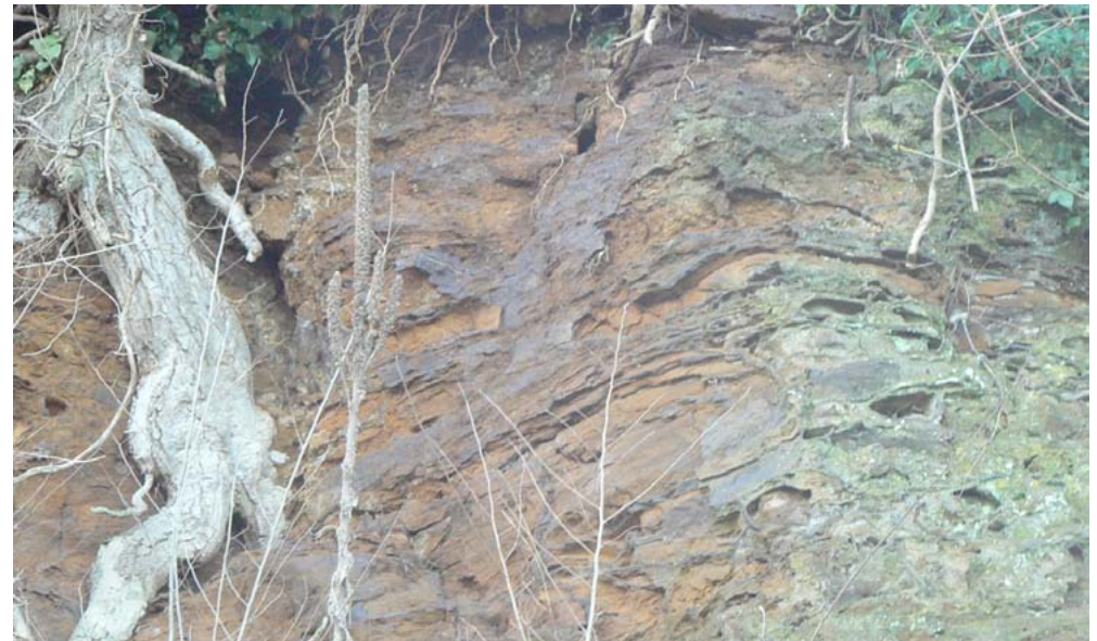
Seend Ironstone Quarry SSSI; view of the Cretaceous ironstone.