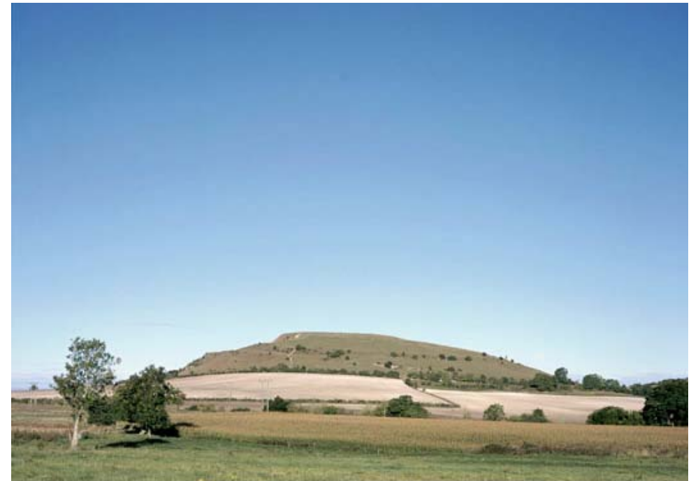
Cley Hill hill fort, now also a Site of Special Scientific Interest.