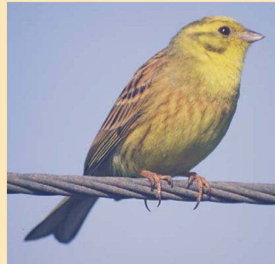
Yellowhammer; a Red-listed species, often seen in this area.