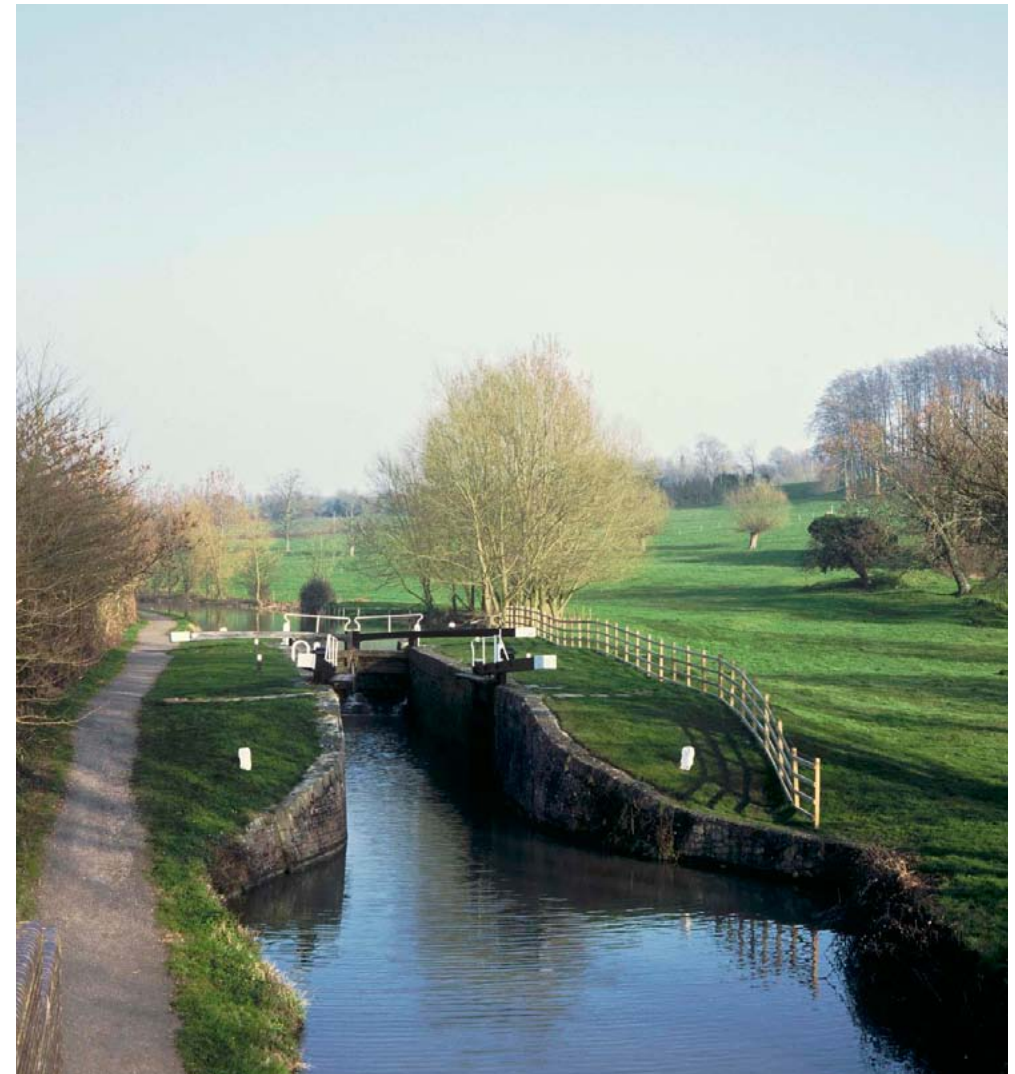
Lock at Seend on the Kennet and Avon Canal.

The NCA is largely underlain by hard rock aquifers, with little scope for greater water extraction; it also benefits from access to water from the adjoining chalk of the Salisbury Plain and West Wiltshire Downs NCA to the south.