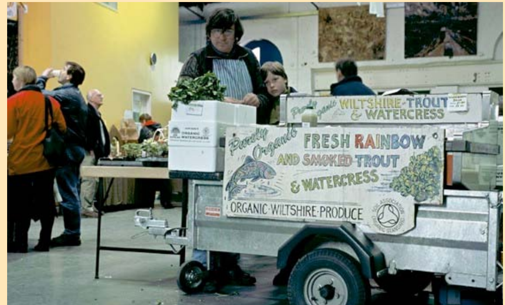
Organic produce from Wiltshire, for sale at Frome Farmer's market.