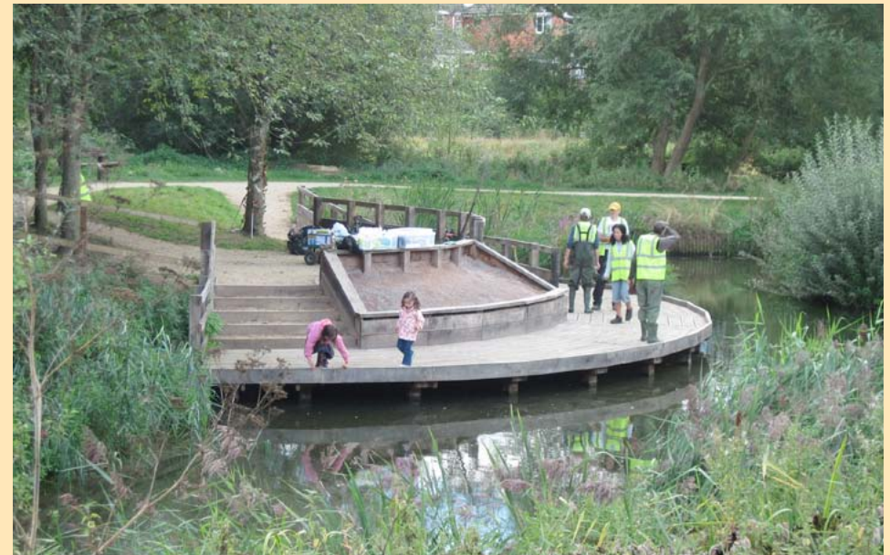
Volunteers working on the viewing platform for the observation pond in Biss Meadows Country Park, Trowbridge. The pond works in part to act as flood alleviation for this still developing town.