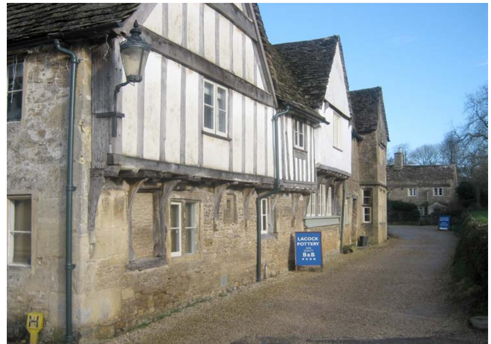
Lacock: an estate village in the clay vale near Chippenham, a honeypot for tourism.

in England as a borough, since the time of Alfred the Great, and hosts the country's oldest operating purpose-built hotel (inherited from the medieval abbey); and Frome dates back to the Saxon period. Many towns contain exceptional collections of buildings, and most lie close to the Avon and thus along the historical lines of communication. There was much urban development in the late 20th century, and towns are much larger in population than was the case immediately post war. In particular, Chippenham has prospered from its position on the Bristol to London train line built in the mid 19th century and being, as a result, within the London travel-to-work area.