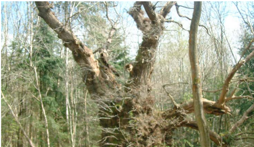
Oak tree in the parkland at Spye, near Lacock.