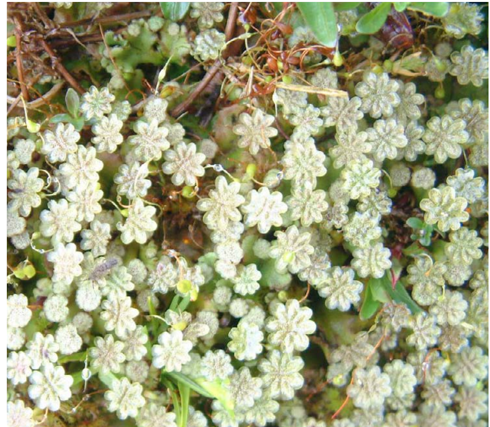
Common liverwort found in Spye Park SSSI, a woodland site rich in lichen and bryophytes.

Biodiversity and geodiversity are crucial in supporting the full range of ecosystem services provided by this landscape. Wildlife and geologically-rich landscapes are also of cultural value and are included in this section of the analysis. This analysis shows the projected impact of Statements of Environmental Opportunity on the value of nominated ecosystem services within this landscape.