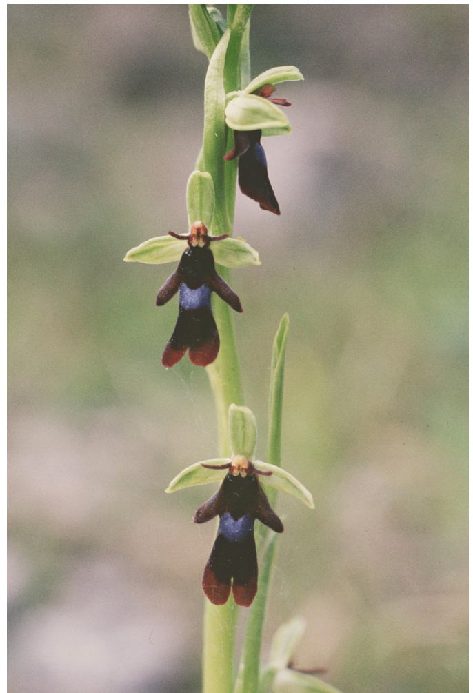
Fly orchid.

The ground flora is extremely rich due to calcareous and acidic soils and there are many locally rare plants such as: lily-of-the-valley, wood spurge, great wood-rush, violet helleborine, nettle-leaved bellflower, fly orchid and columbine. Dog's mercury, wood anemone, creeping soft-grass, wood sorrel and false brome are some of the more widespread plants. Several large areas of bracken occur and are often associated with tree pipits, one of the less common species from a good representative of breeding birds.