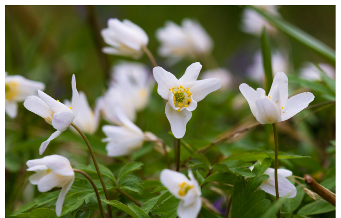
Wood anemone.

Enquiries to request a permit can be made by emailing: enquiries@naturalengland.org.uk